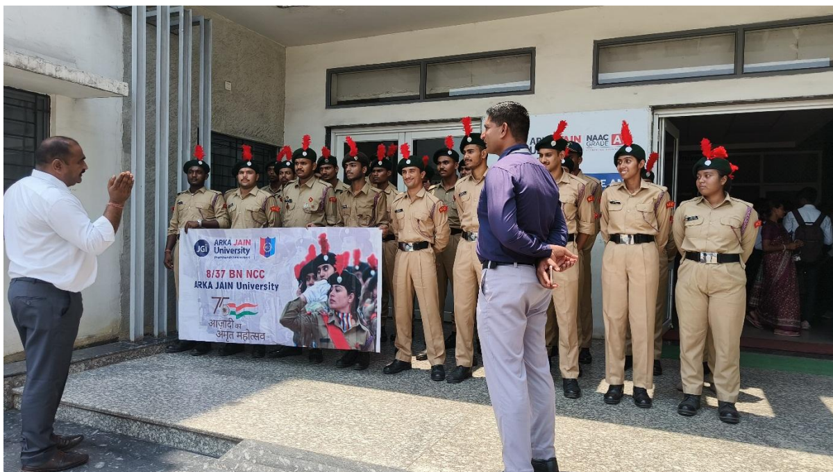
Fig.1- During Group Photo