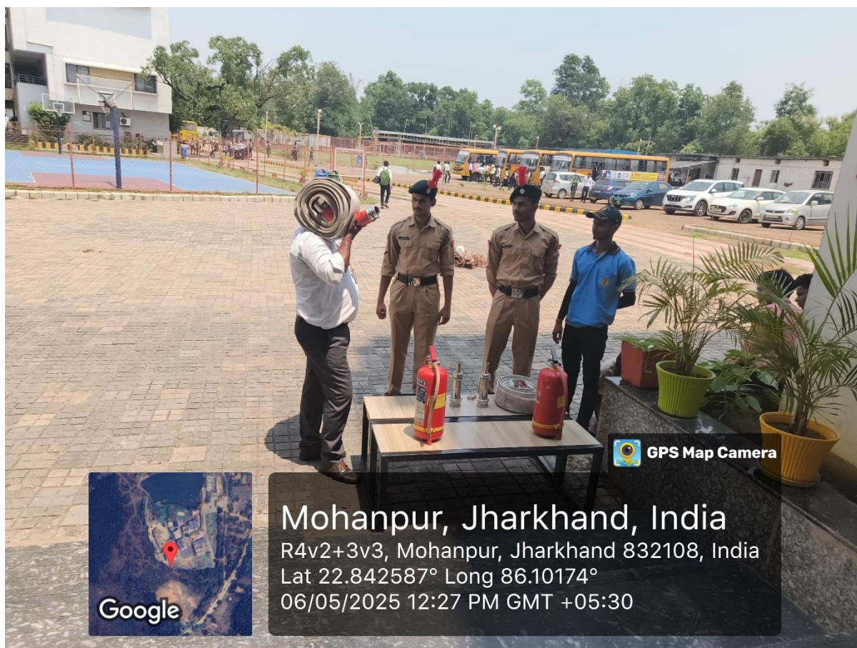
Fig. 2- During Training