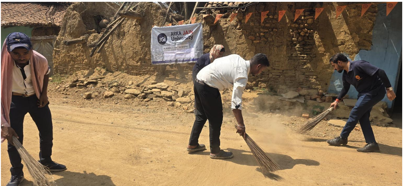
Fig. 2- Swachata activities–Cleaning is done by B.Sc. Nursing students.