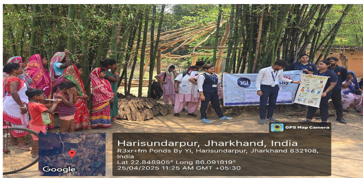
Fig. 4- B.Sc. 5 th semester students giving health talk- covering all the vital information of regarding Malaria- treatment, prevention, and its control.