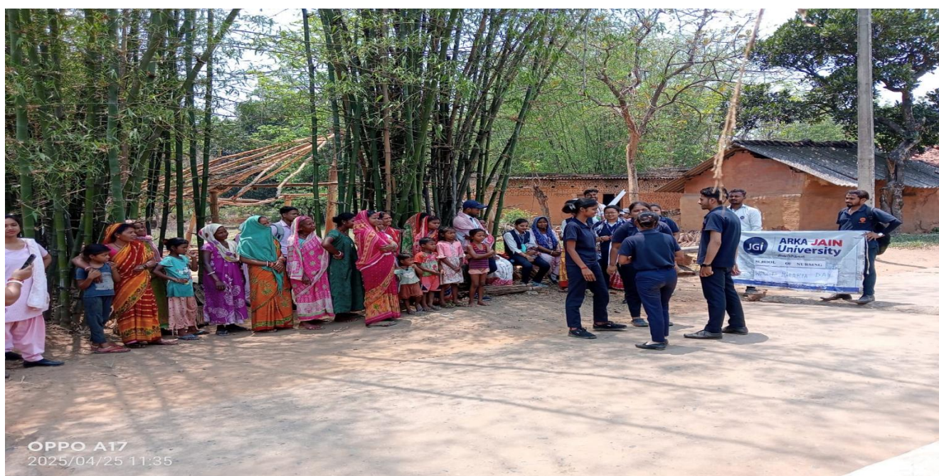
Fig. 3- Nukkad Natak (Drama) played by the B.Sc. Nursing 5 th semester students on Malaria.