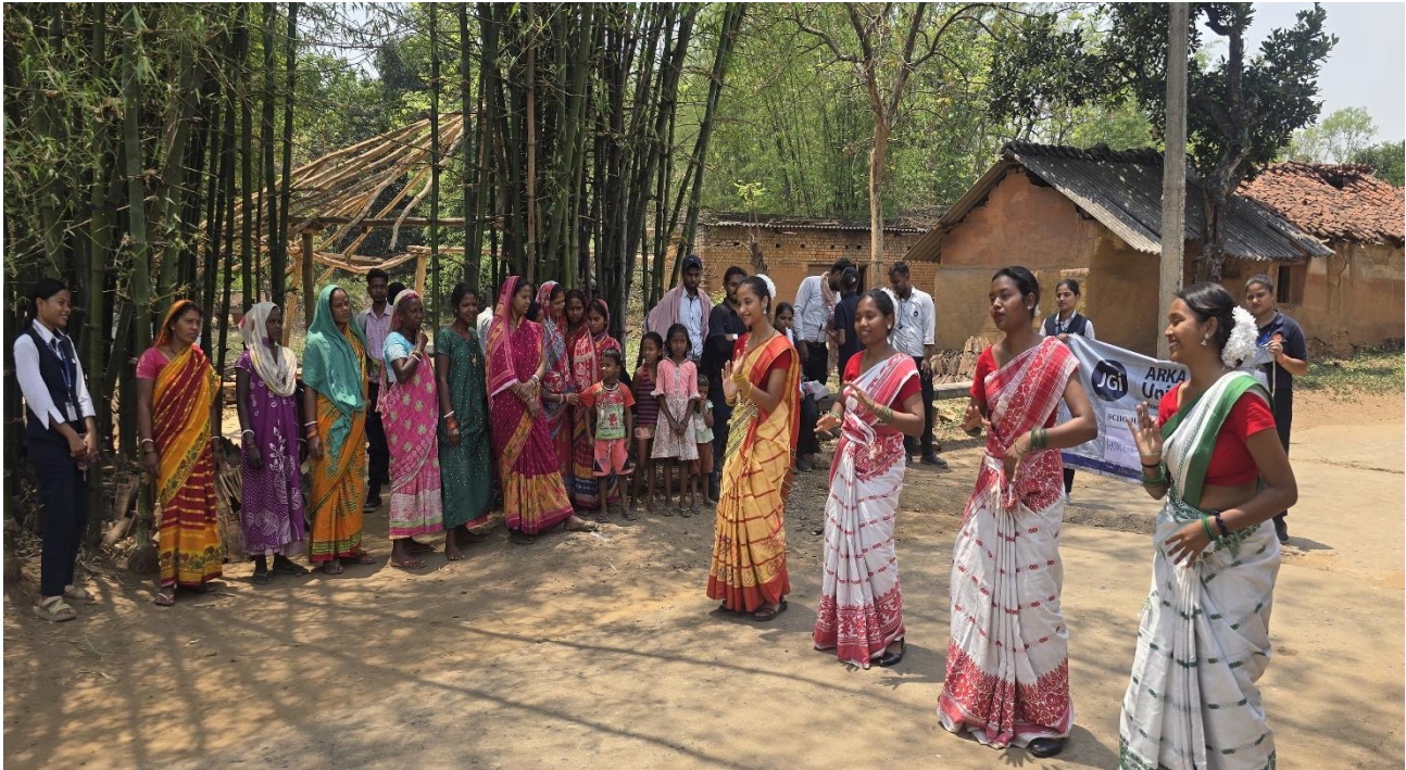
Fig. 1- Jan jatiya Gaurav varsh –dance by 5 th semester students.