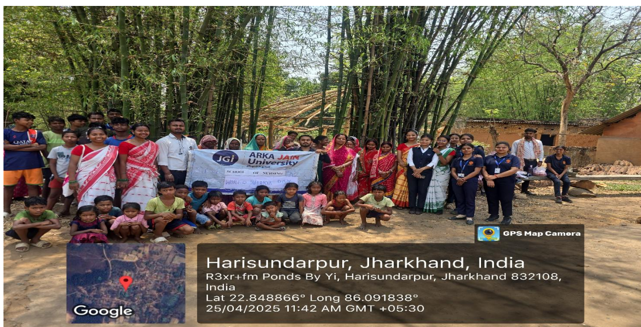
Fig. 6- Group photo with the community people of Harisundarpur and 5 th semester B.Sc. nursing students after program.