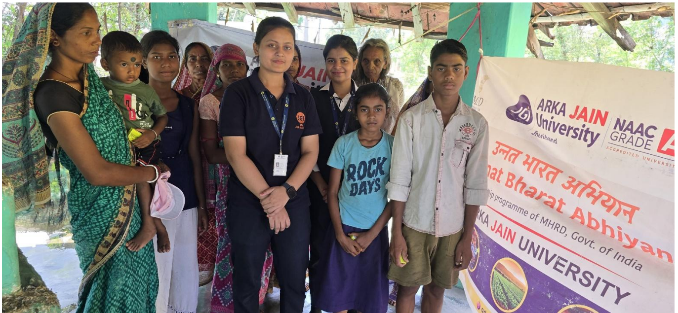
Fig. 7- Group photo with the community people.