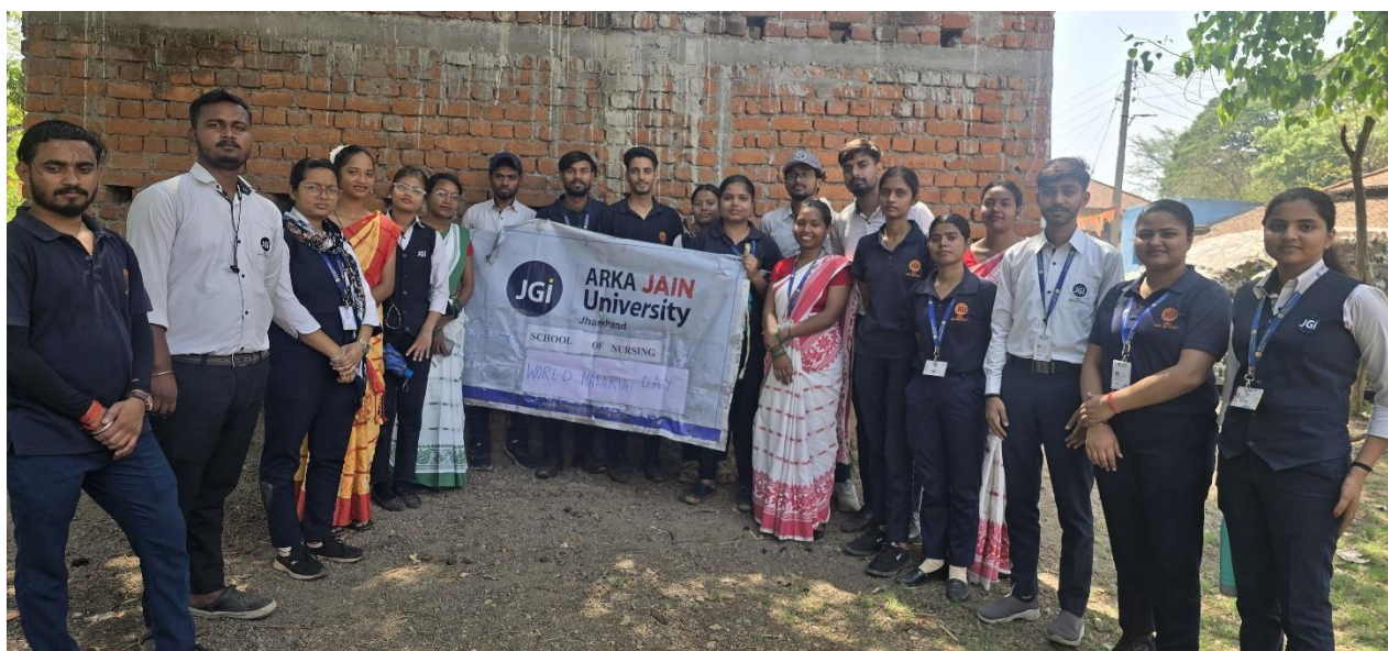
Fig. 5- Group photo of the 5 th semester B.Sc. nursing students on World Malaria Day