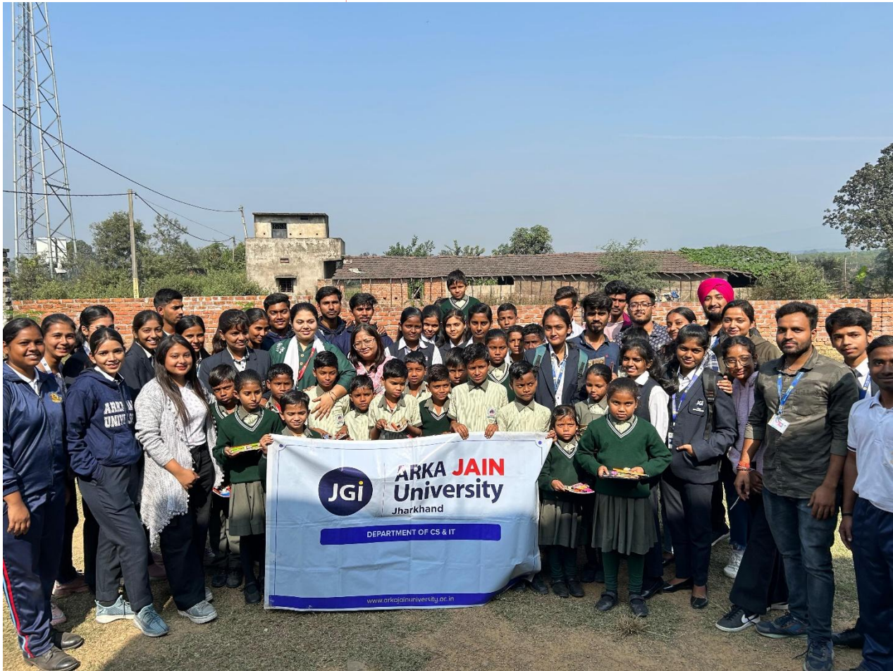
Photo of the Event: Extension activity on Education Awareness among