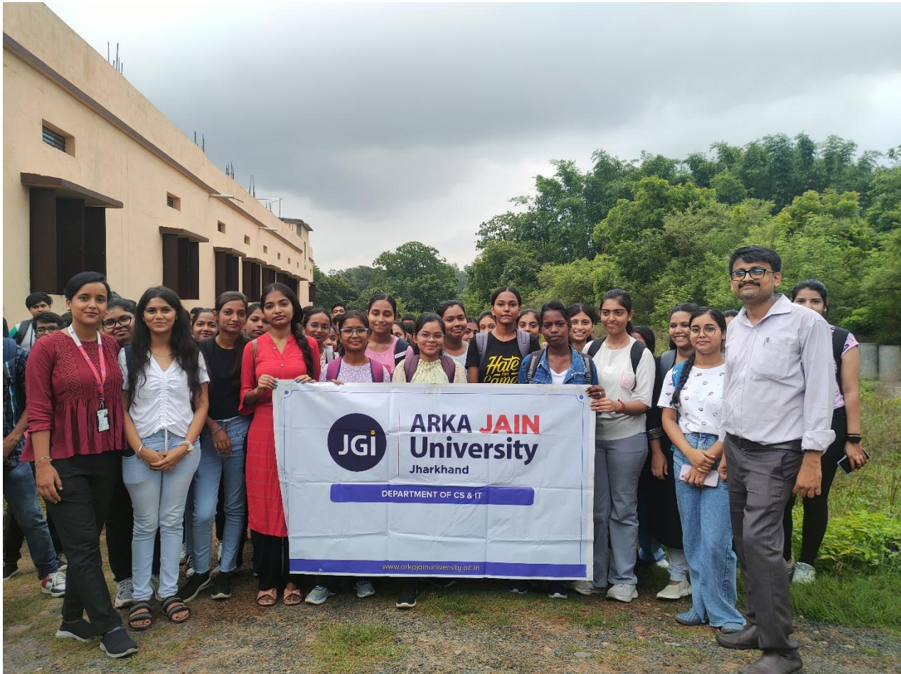
Photo of the Event: Extension activity on Education Awareness among