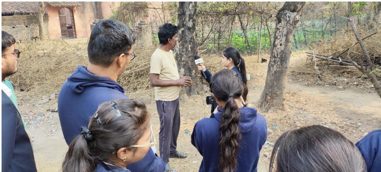
Fig. 4- Students taking interview of villagers regarding sanitation awareness