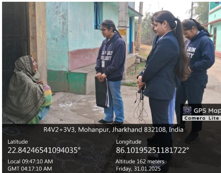
Fig.1- Students making villagers aware about sanitation during sanitation awareness program