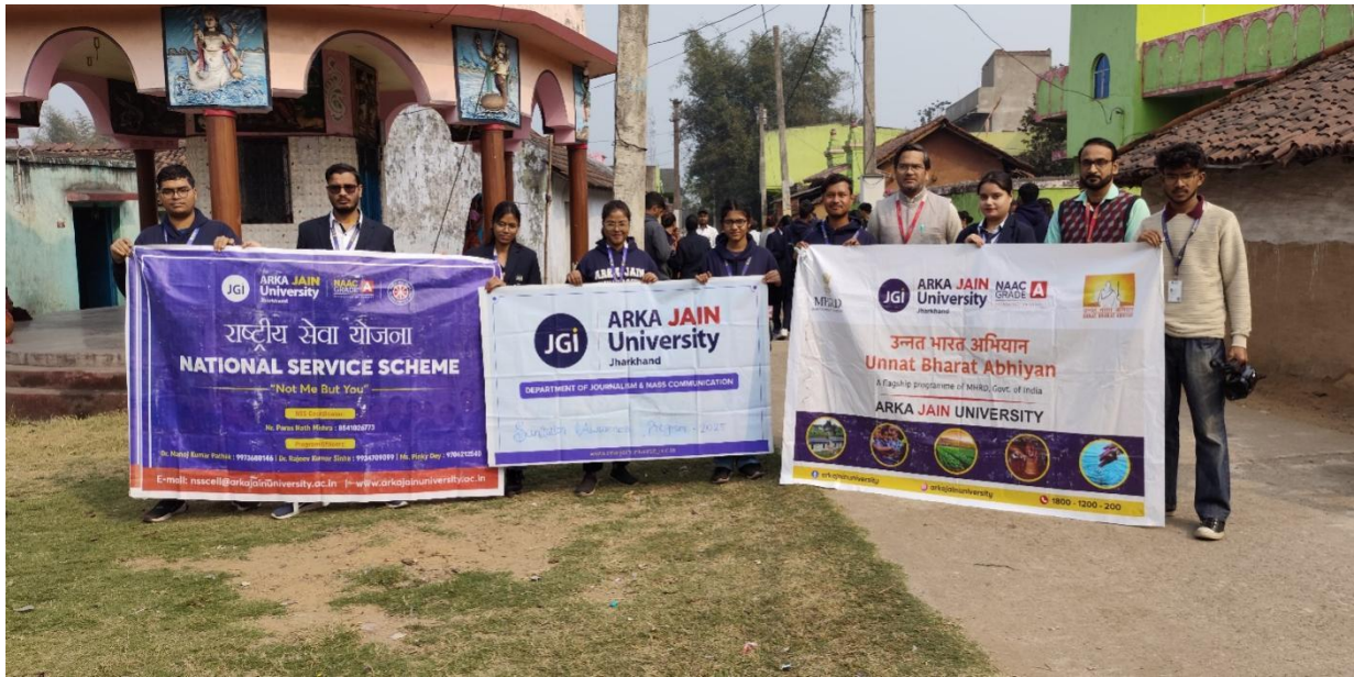
Fig. 3- Participants with faculty members during sanitation awareness Program