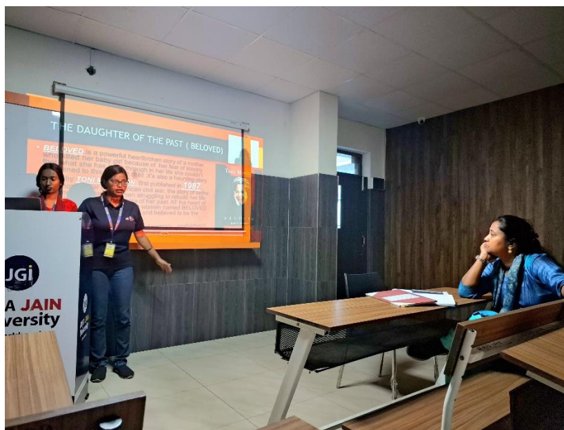
Fig.2 Students with their elaborative view