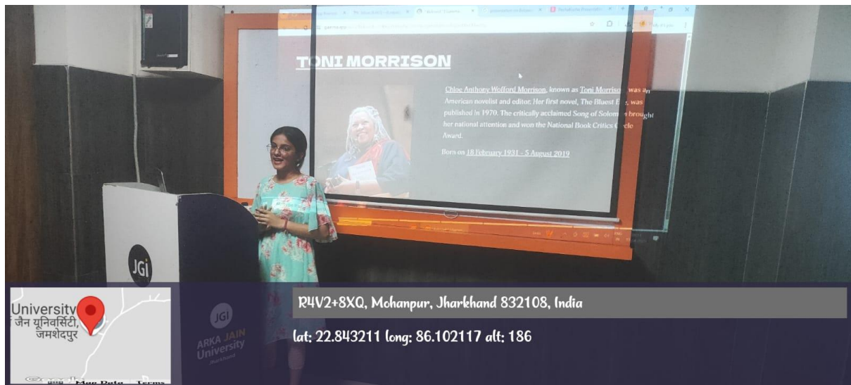
Fig.5- About the author