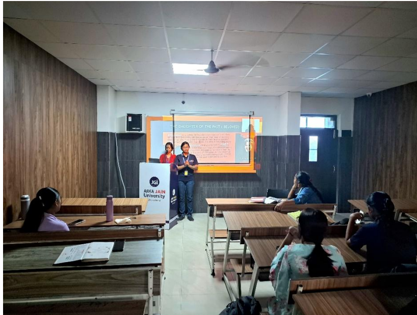
Fig.3- Audience with their attention