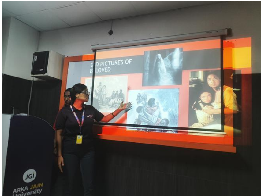
Fig.7 Pictorial presentation