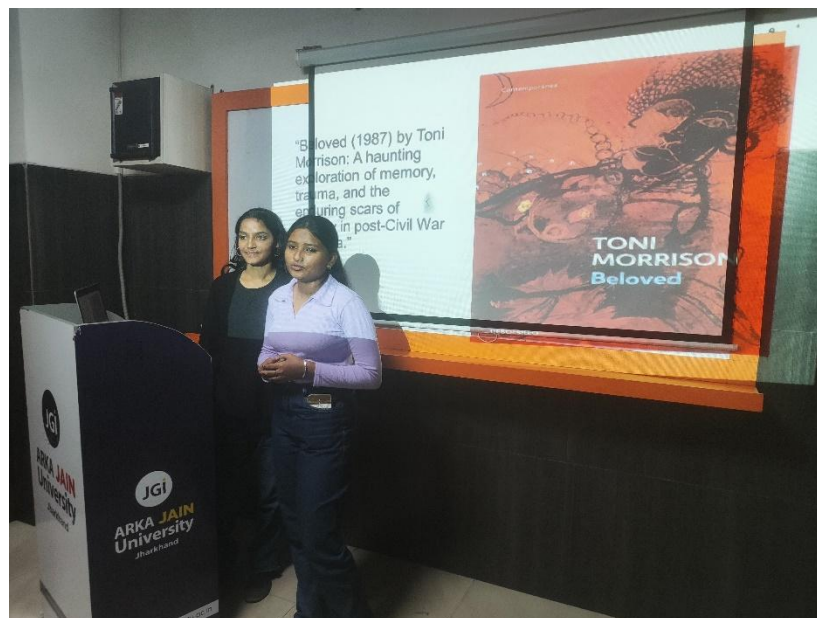
Fig.6 Introducing the author