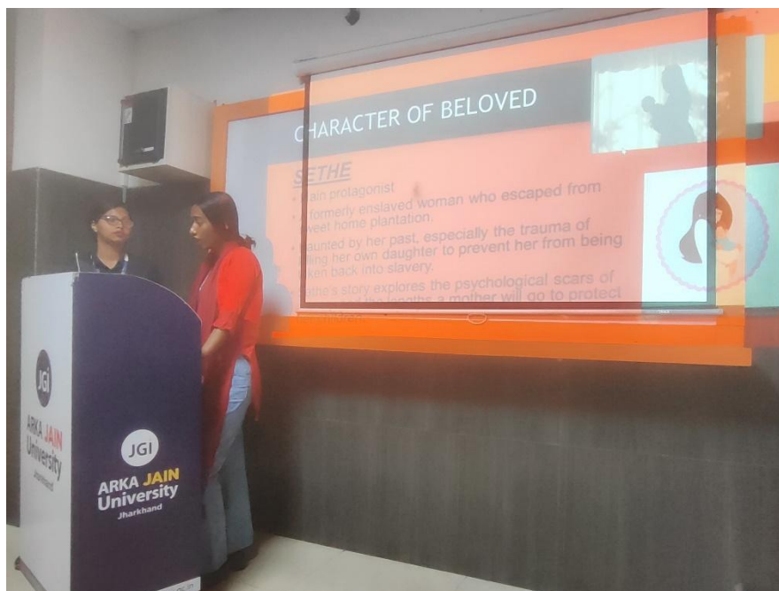
Fig.8- Character presentation