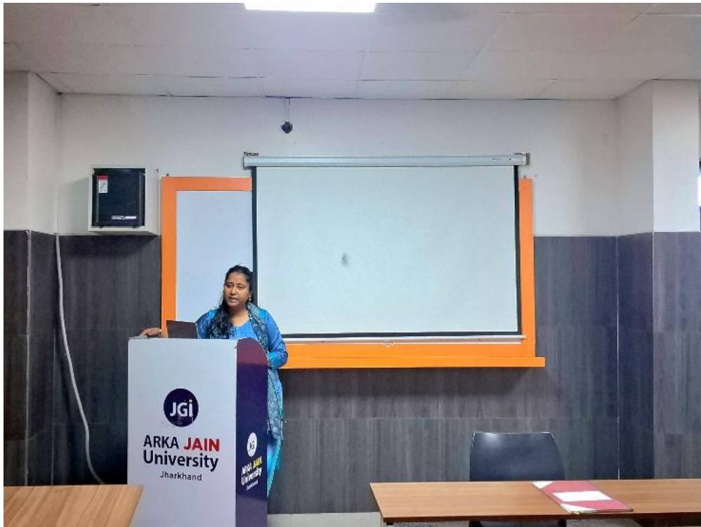
Fig.9- Closing Remarks