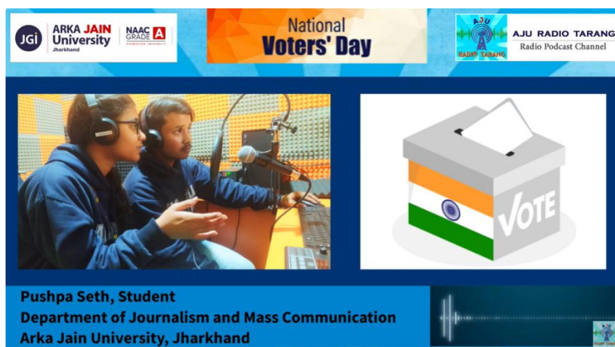
Fig. 5- A glimpse of the radio show on voting rights recorded by the students for Arka Jain University's own radio channel 'AJU Radio Tarang'.