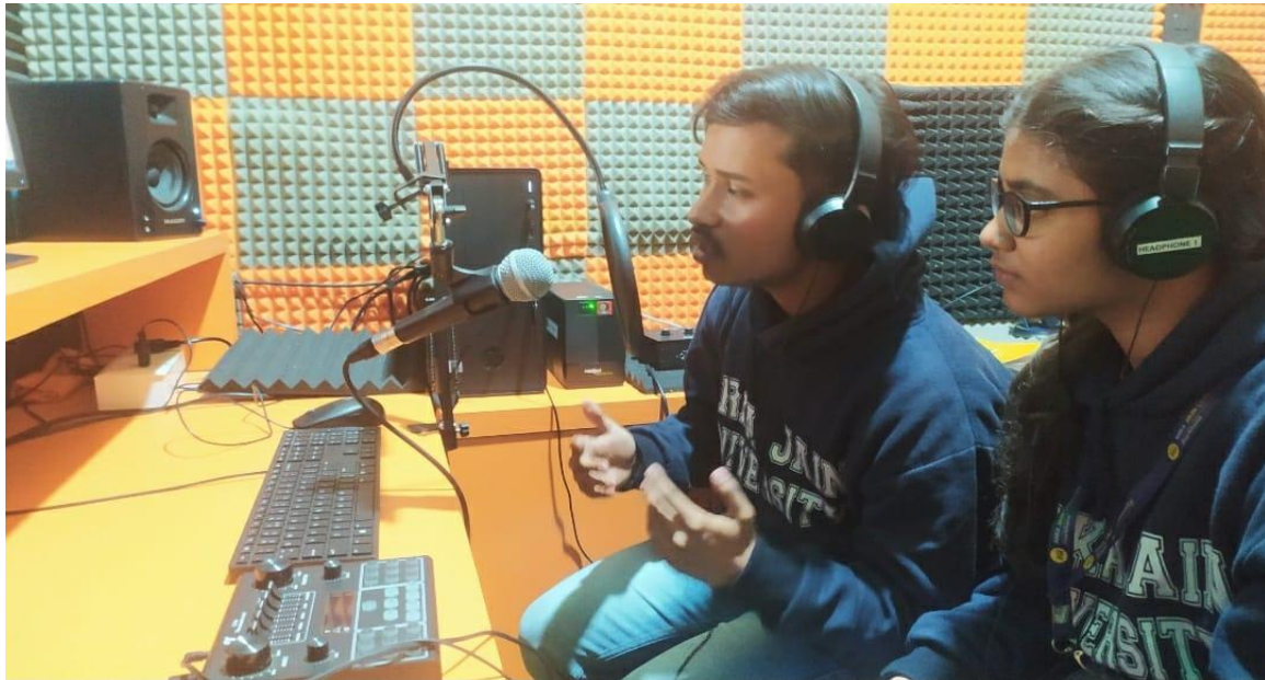
Fig.1- Students recording a radio show to spread awareness on voting rights