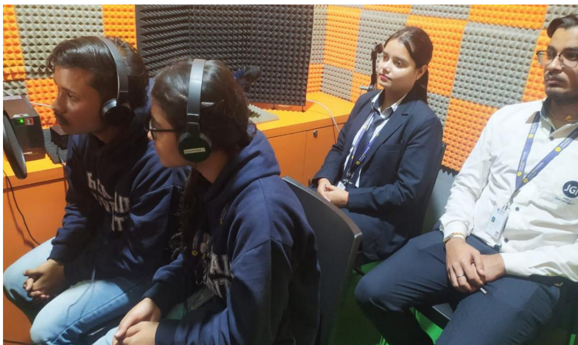
Fig. 2-Students getting guidance for recording a radio show on National Voters Day.