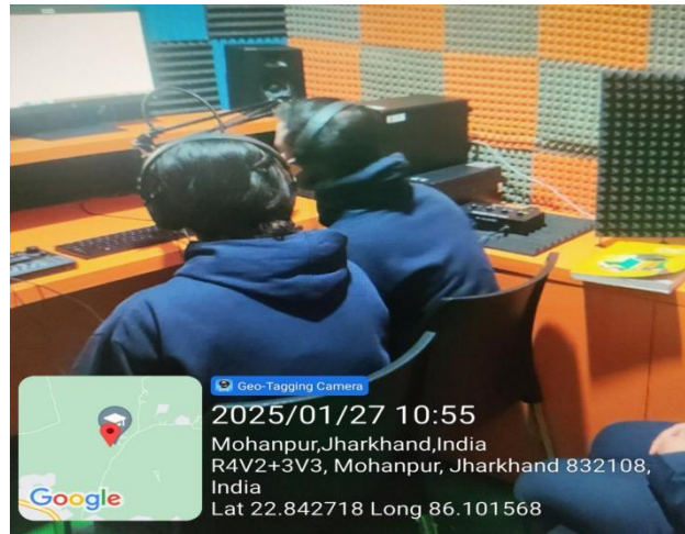
Fig. 3- Students preparing for content for radio programme production