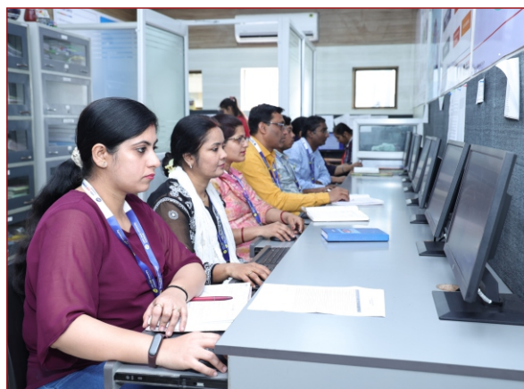
Ph.D SCHOLARS WORKING IN RESEARCH LAB