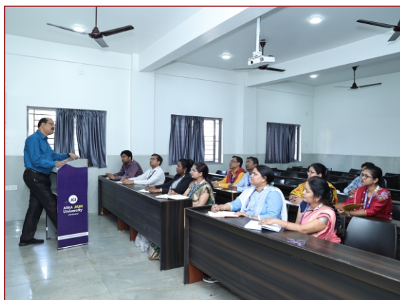
COURSE WORK SESSION IN PROGRESS