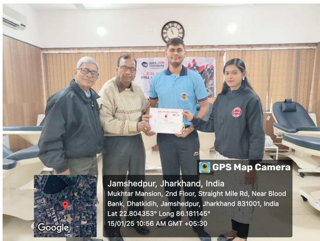
Fig. 4- Certificate Distributed