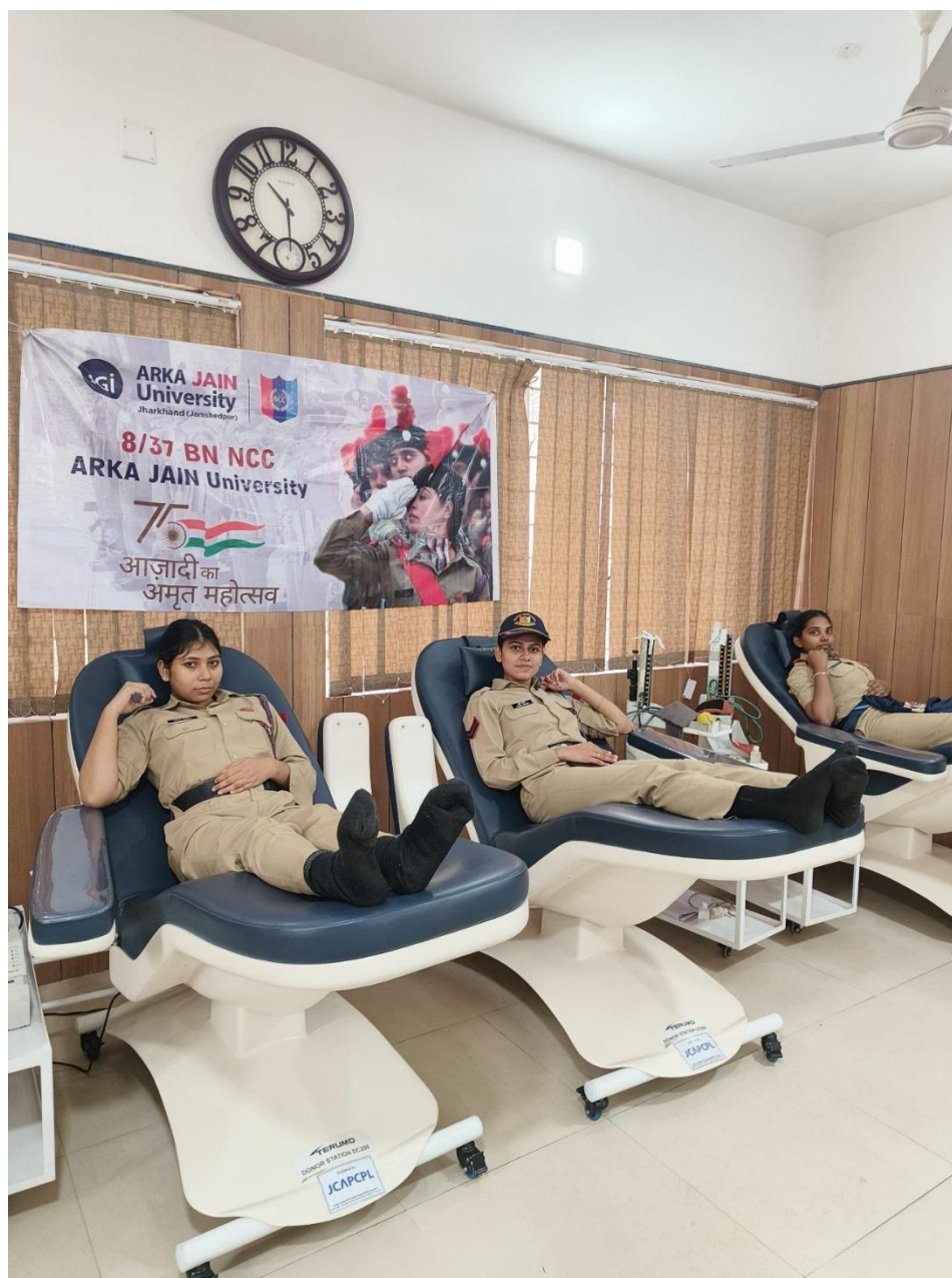
Fig.1- Haemoglobin Check-up