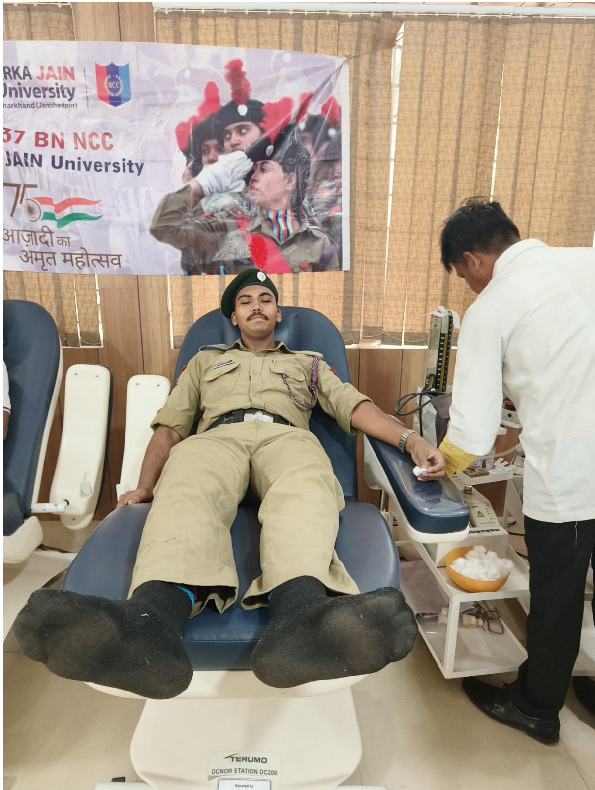
Fig. 2- During Pressure Check-up