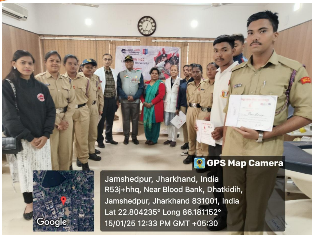
Fig. 3- Certificate Distributed