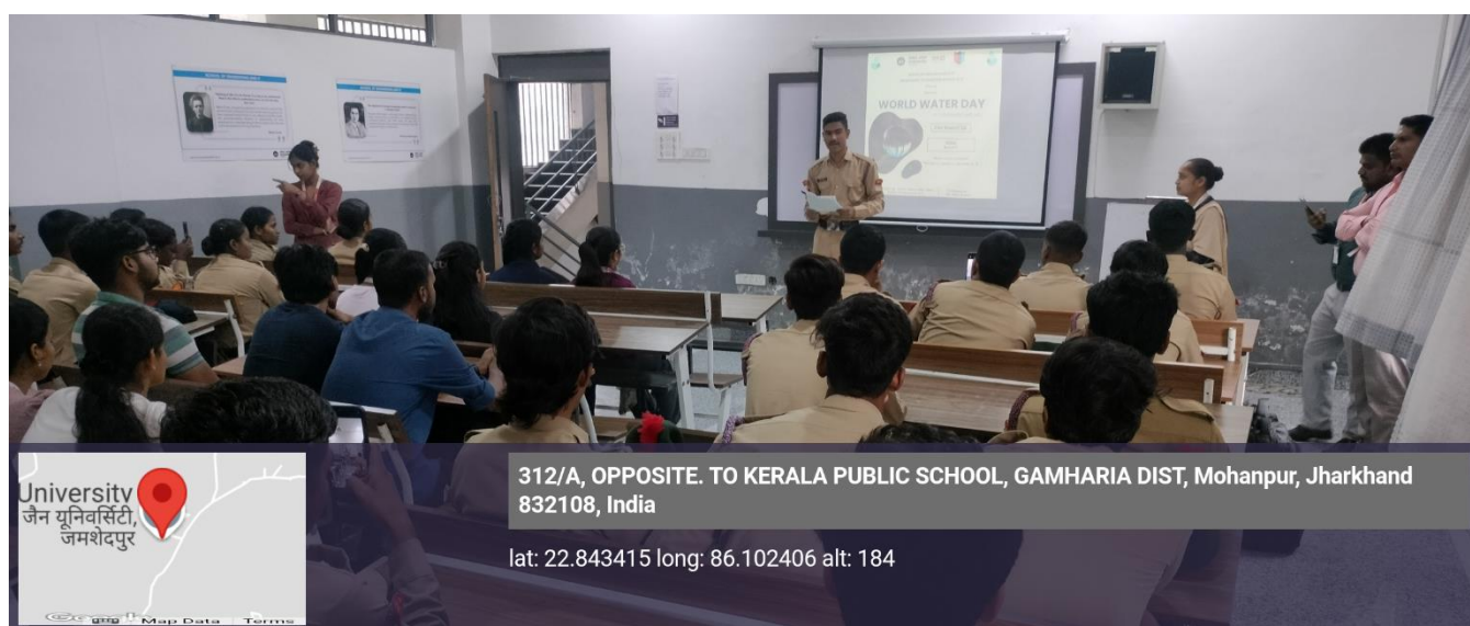
Figure 3: The Speech Delivered by NCC cadet to the students