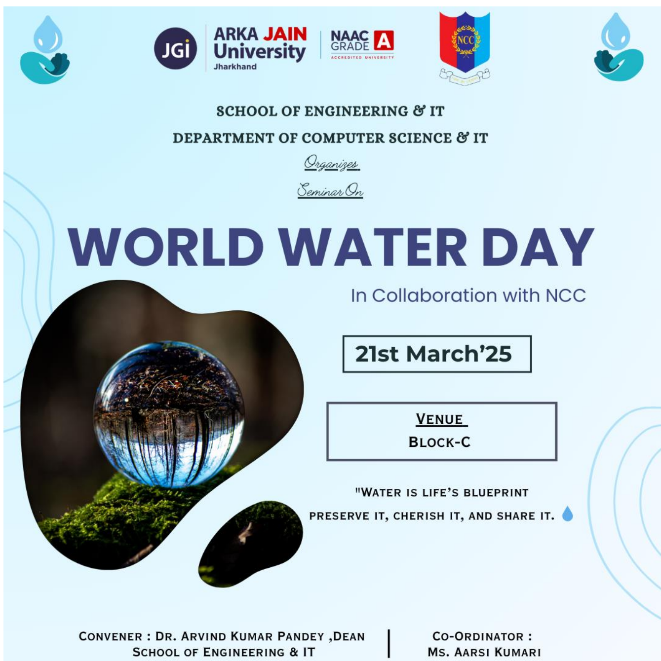
Figure 1: Poster of the Seminar on world water day in collaboration with NCC