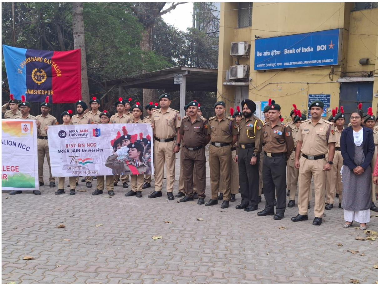
Fig. 4- Group Photo