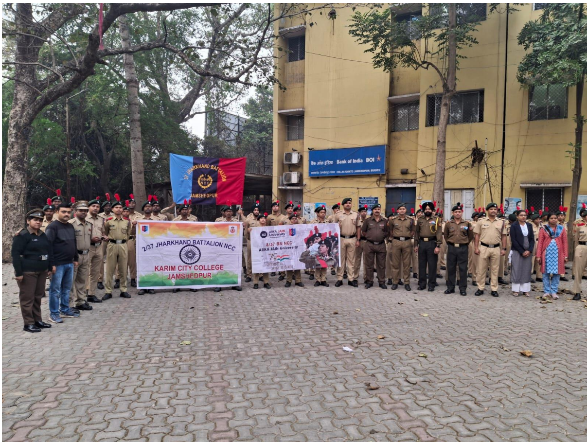
Fig.1- During Group Photo