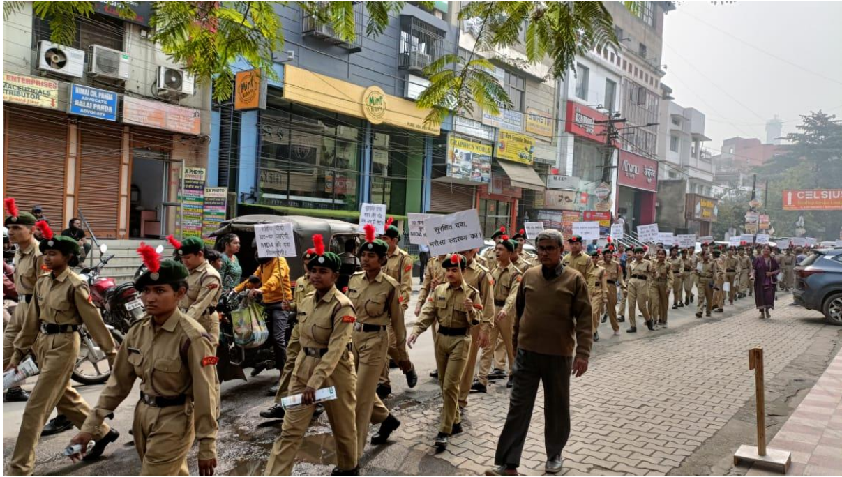
Fig. 5- During Awareness Rally