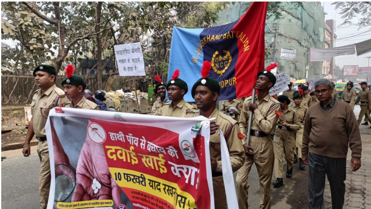
Fig. 2- During Rally