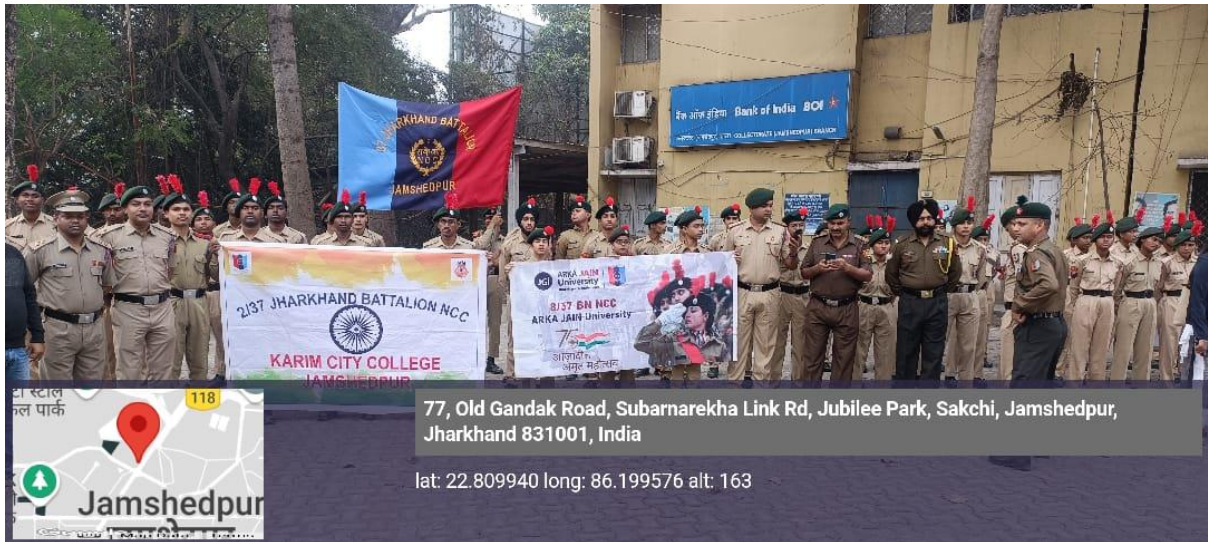
Fig. 3- Group Photo