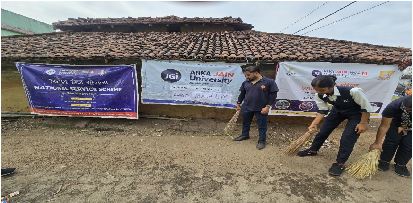
Fig 3: Students' active participation