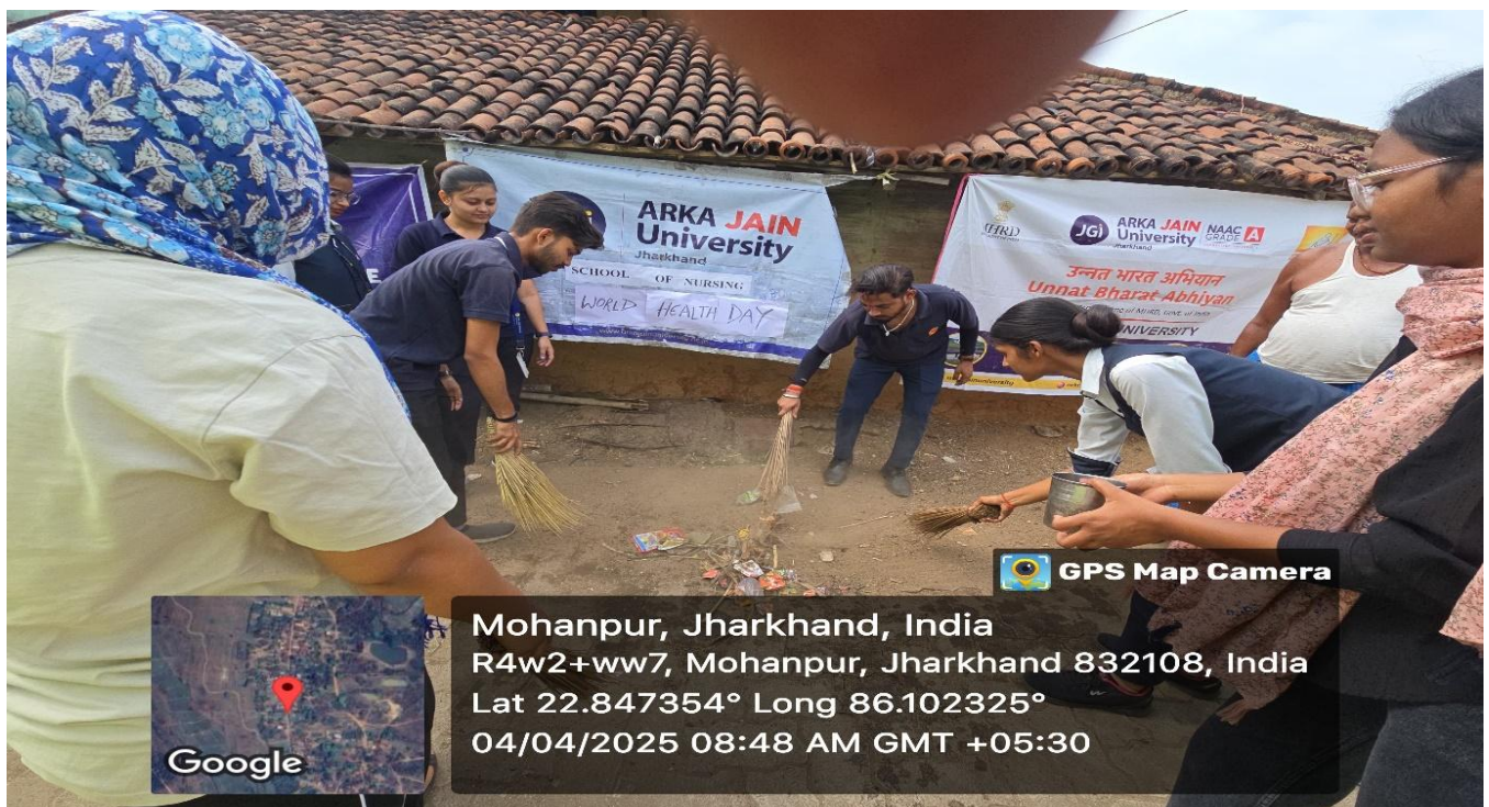
Fig 2: Students cleaning the areas of Musarikudar