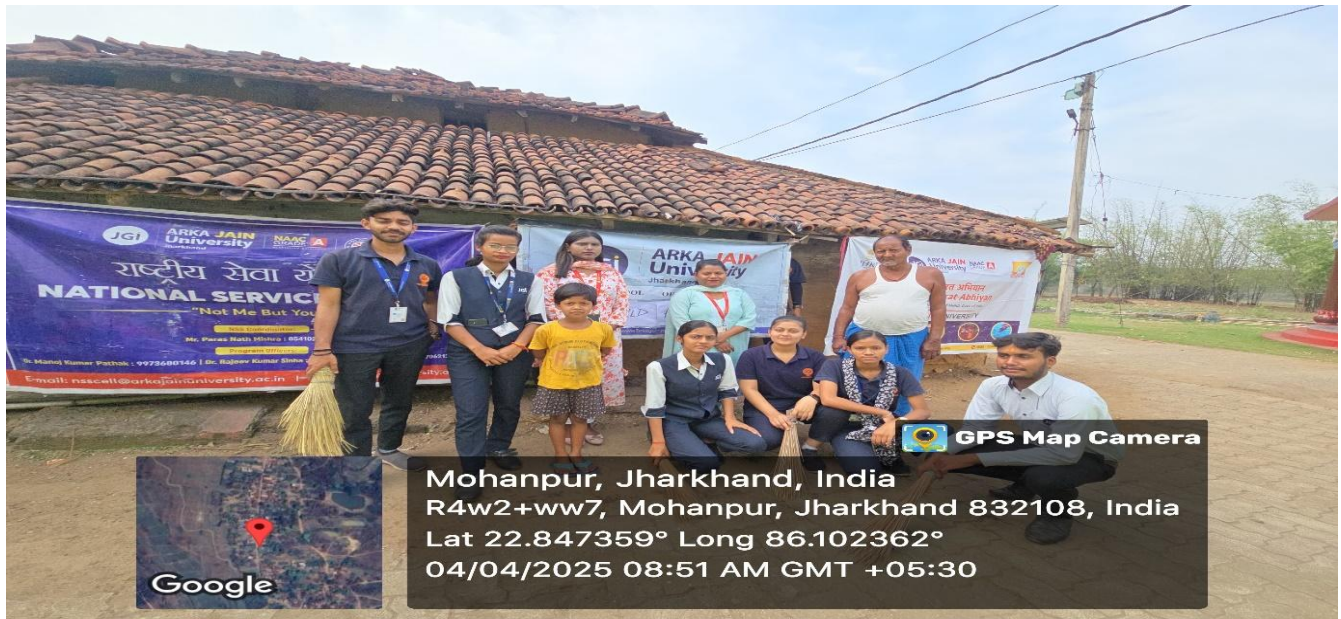
Fig 1: Cleaning of the Village area on World Health Day