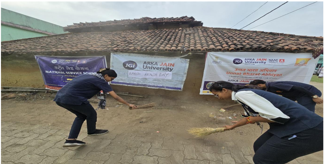
Fig 4: Cleanliness at the lawn of people's house