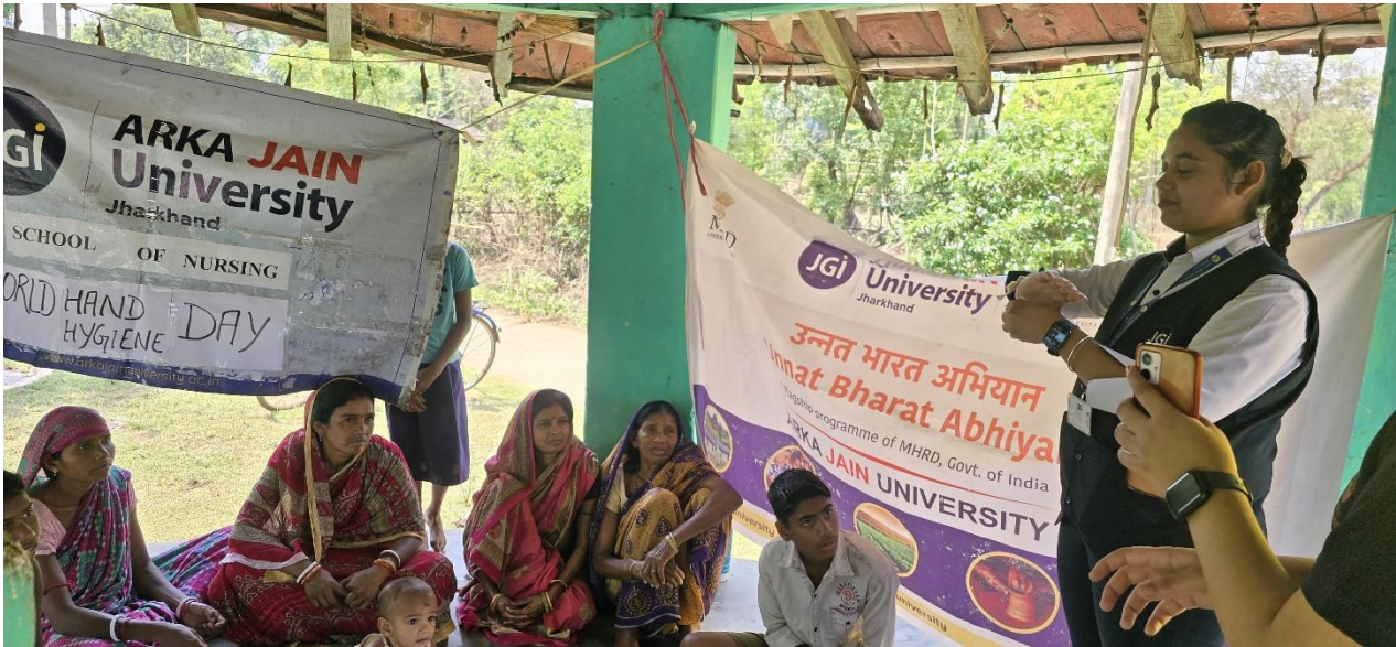
Fig.1: Showing the steps of Hand Hygiene