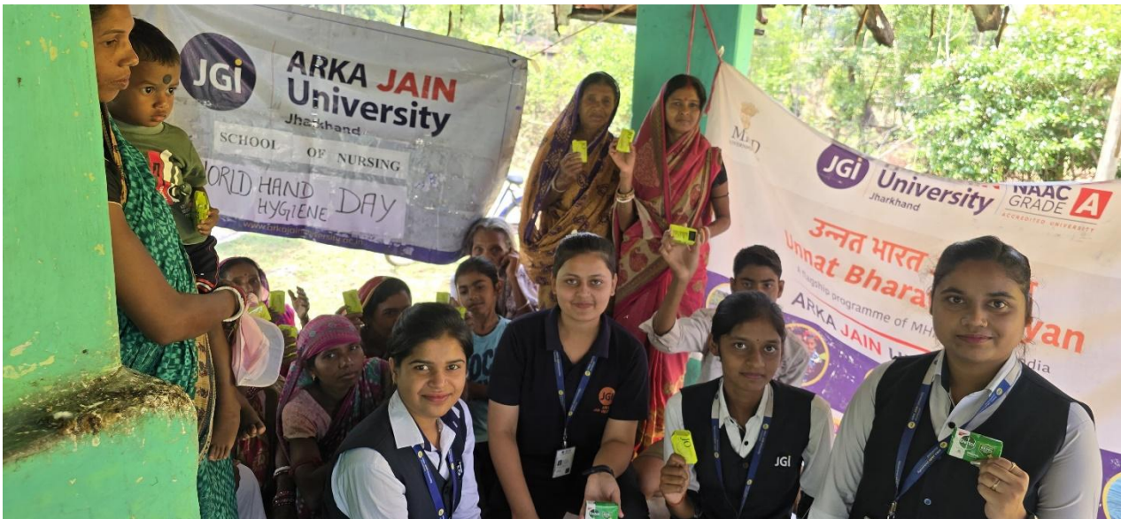
Fig.2: Explaining about the use of soap while doing Handwashing