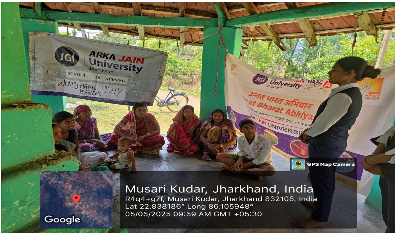
Fig.3: Giving brief about benefits of Hand Hygiene