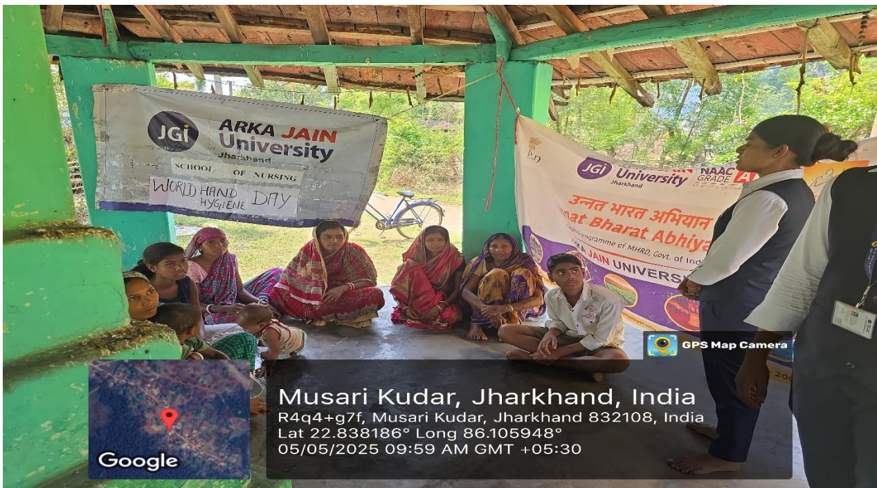
Fig.4: students explaining about consequences of not doing Hand Hygiene