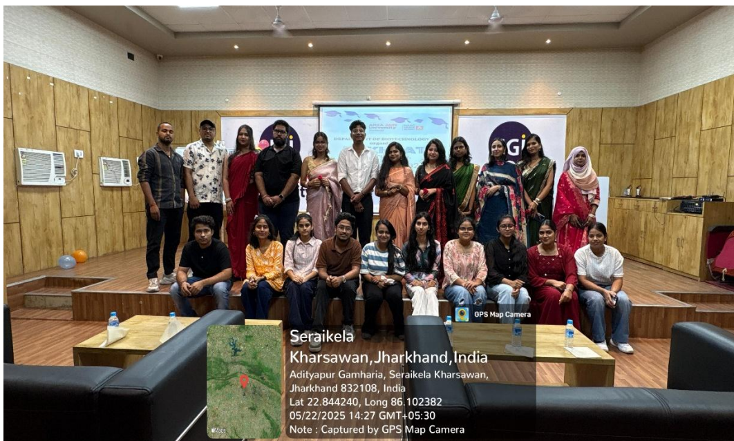
Fig 2. Students of Batch 2022-25 along with batch 2023-26