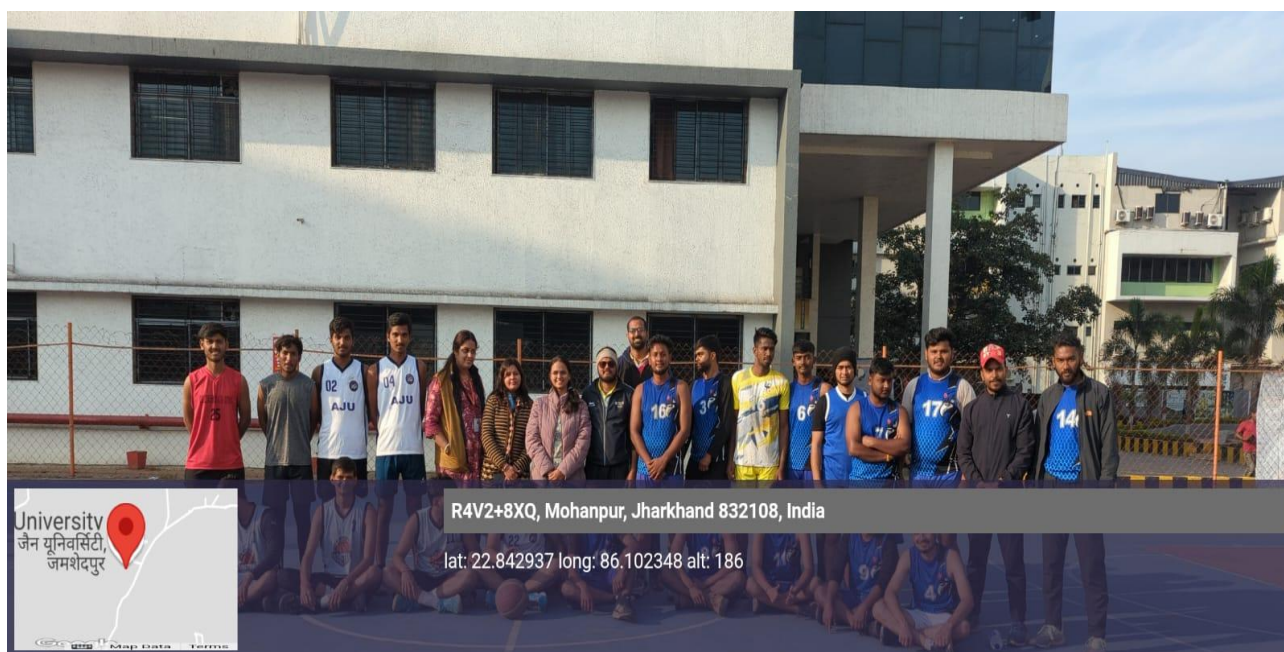
Fig 4. Faculty & Student Coordinators Of The Event