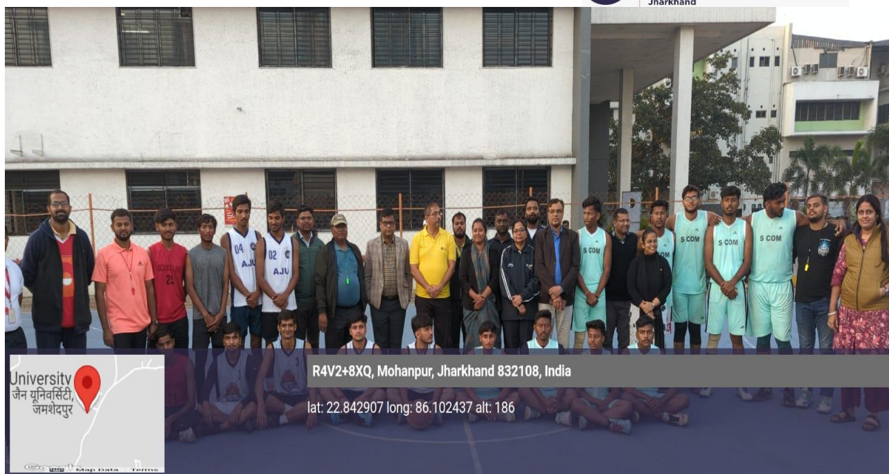
Fig 3. Faculty & Student Coordinators Of The Event