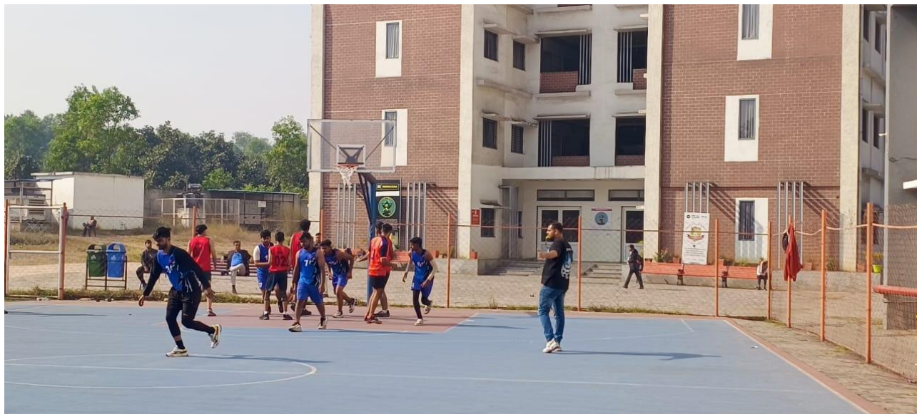
Fig 1. 1st Match