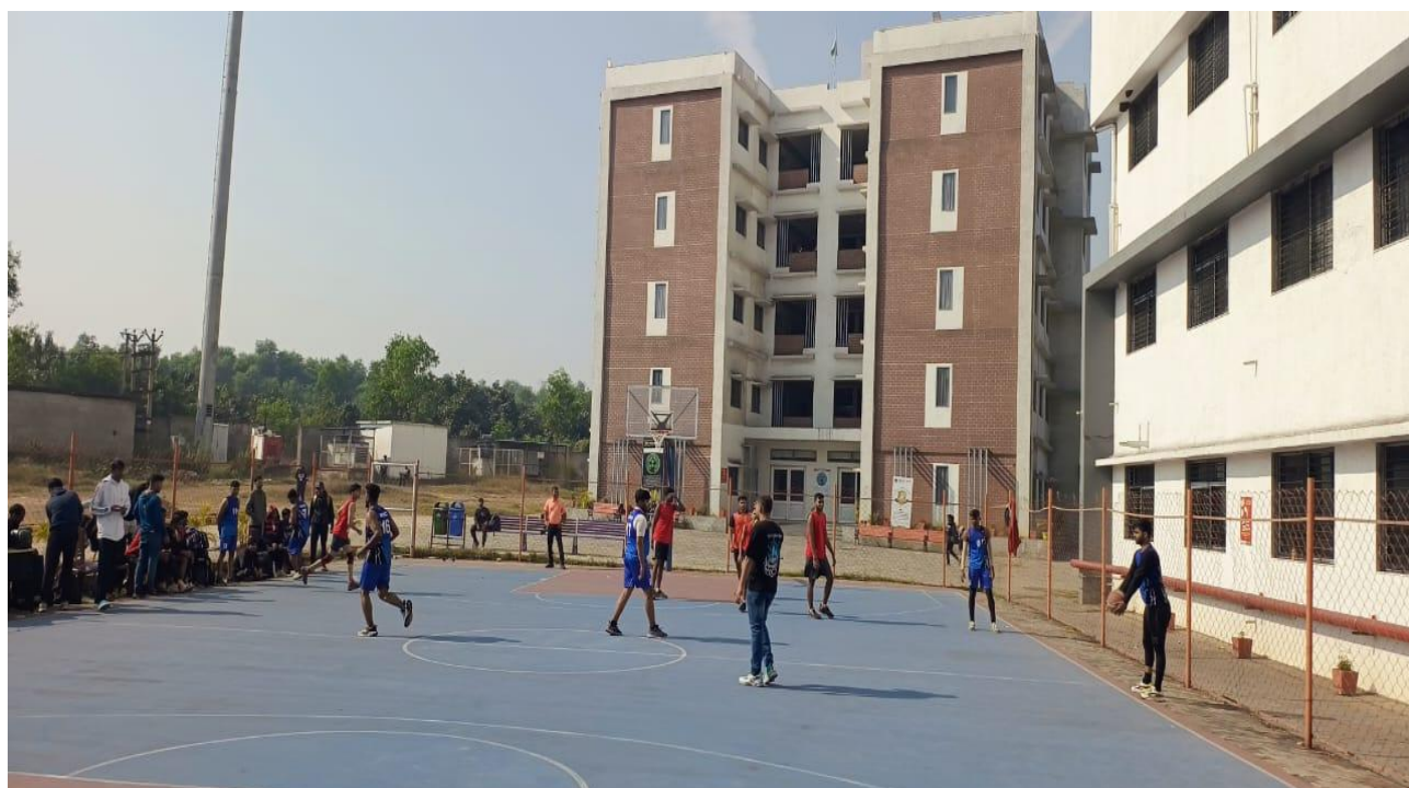
Fig 2. 2nd Match