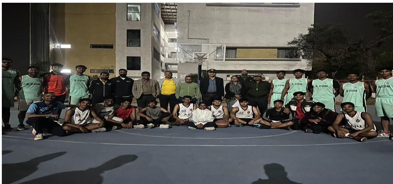
Fig 6. FINALIST OF THE EVENT