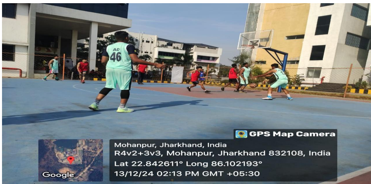
Fig 5. SEMI-FINALIST-1 TEAM OF SCOM & SCHOOL OF ENGINEERING & IT