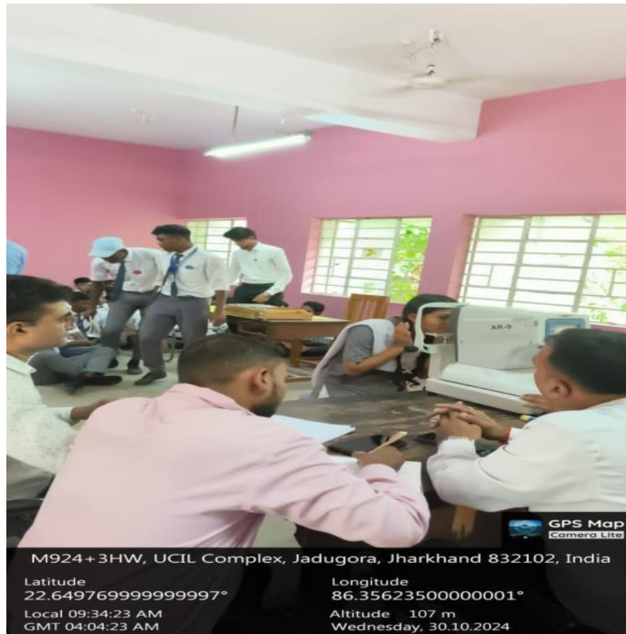
Fig 3. Eye Checkup Camp by the MoU partner- ASG Eye Hospital