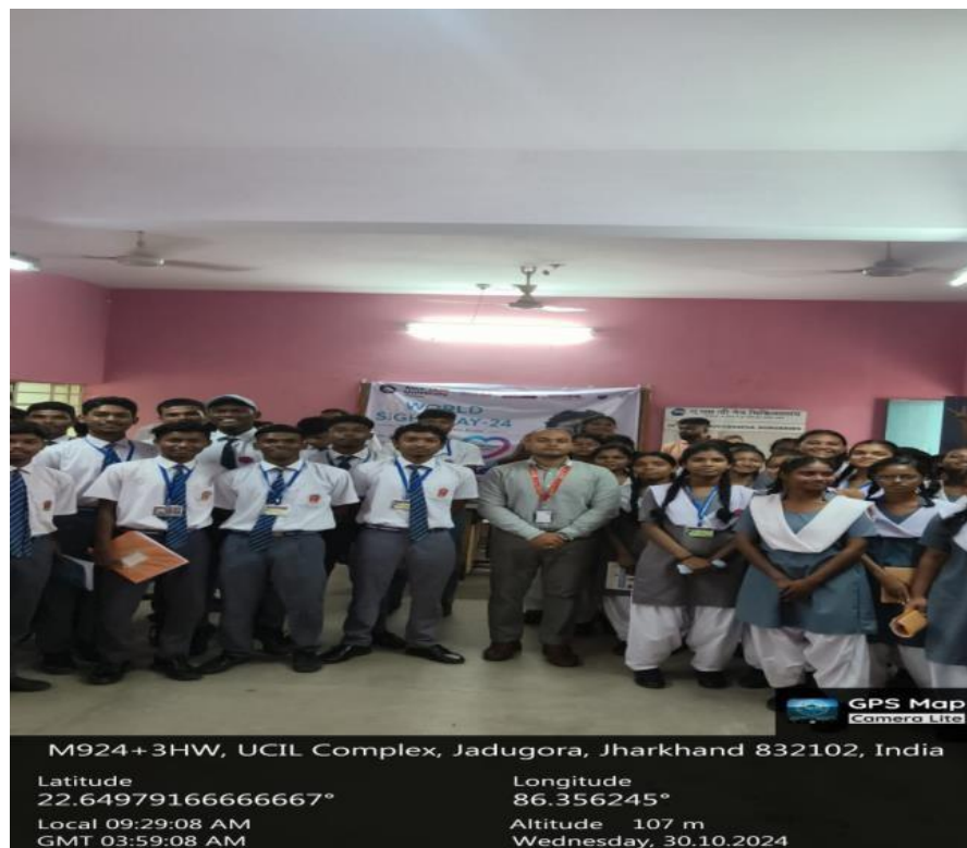
Fig 4. Group Picture with the presenter and the participants of the school