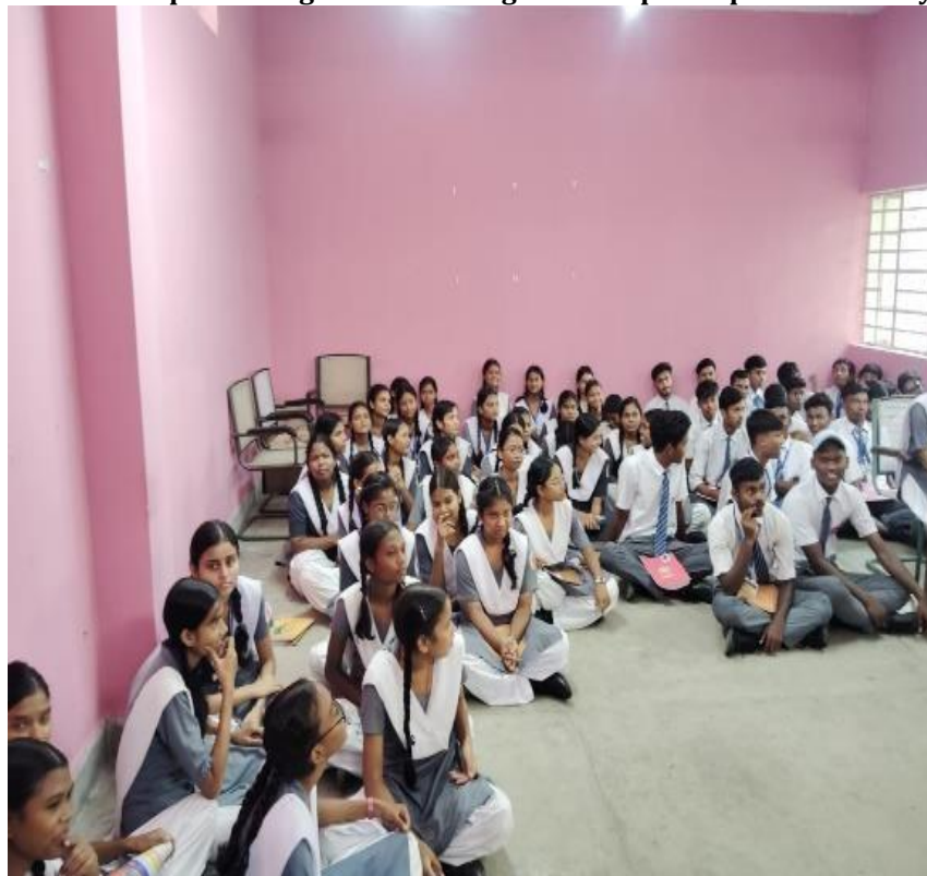
Fig 2. Participants for the awareness session