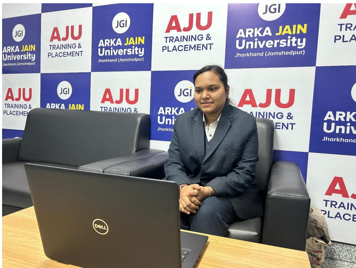
Fig. 3- A Student from ARKA JAIN University appearing Interview