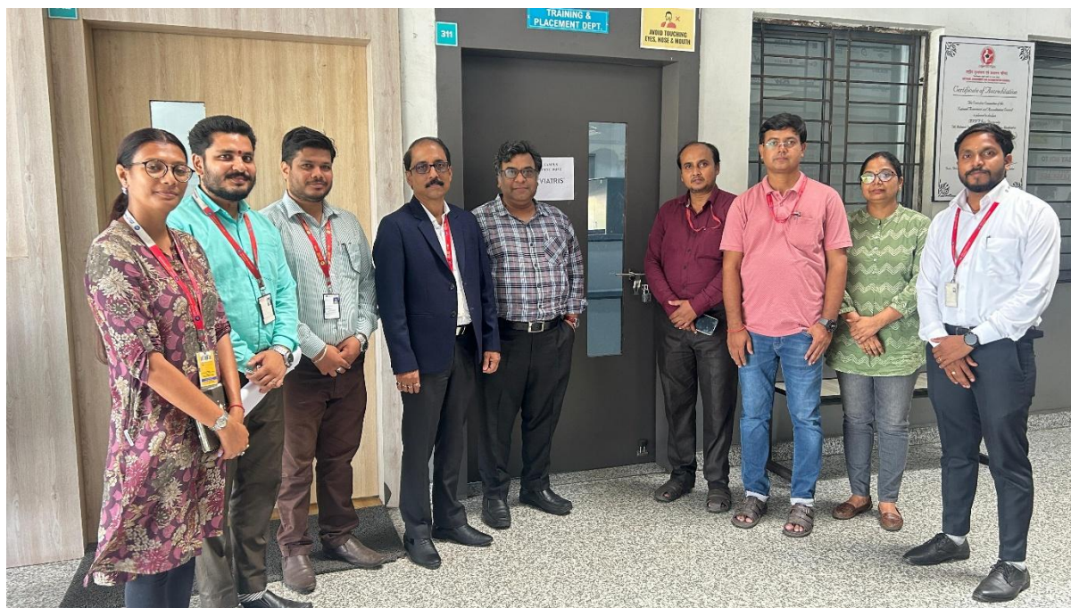
Fig.1- Officers during conduction of Placement drive by VITARIS