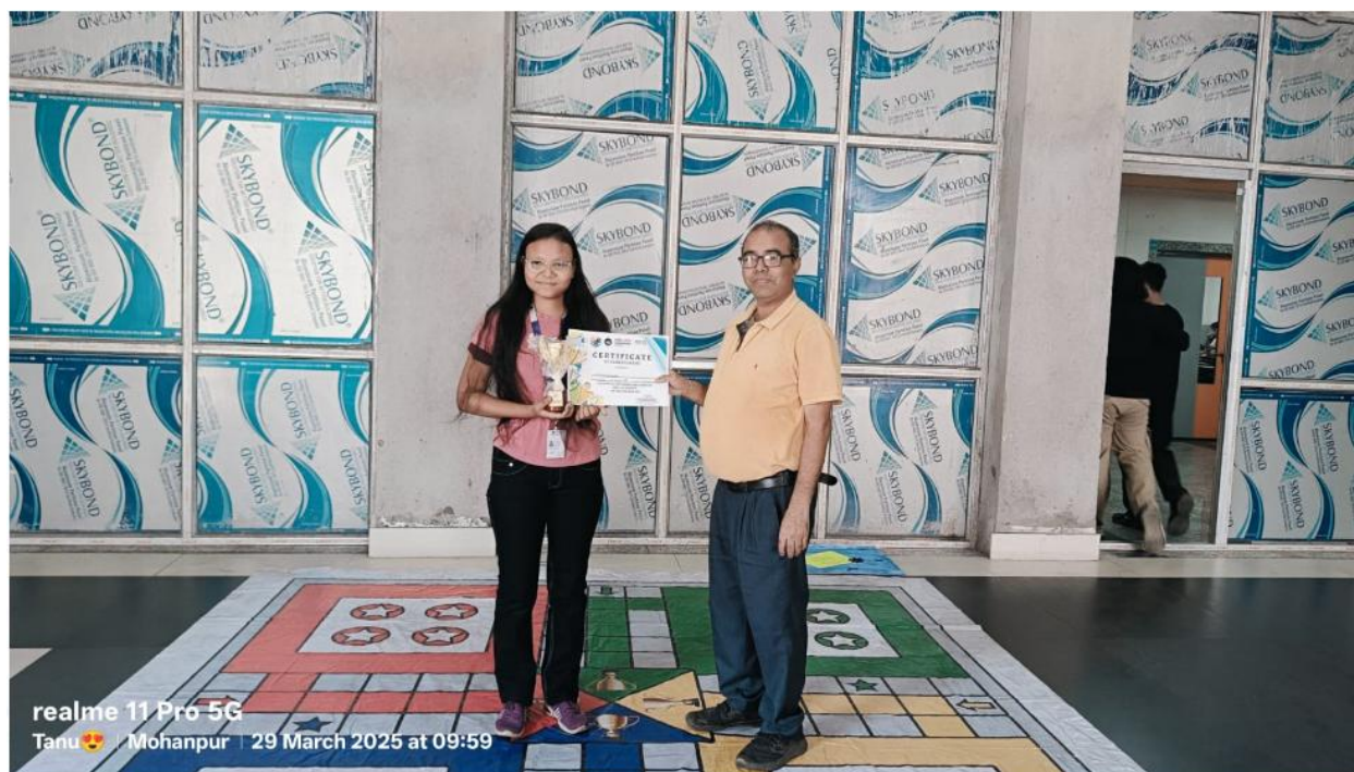
Figure 3: WINNERS WITH THE JUDGES