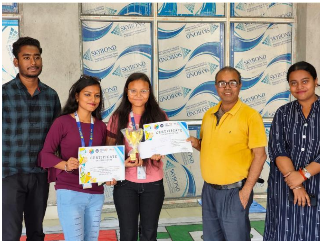
Figure 1: JUDGES OF THE EVENT