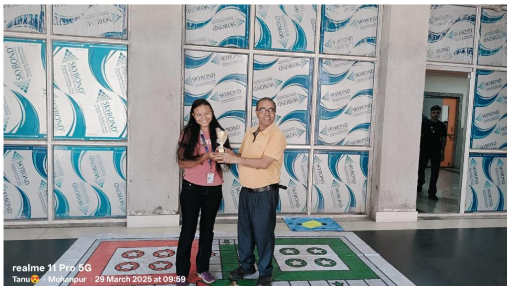
Figure 2: STUDENTS PARTICIPATED