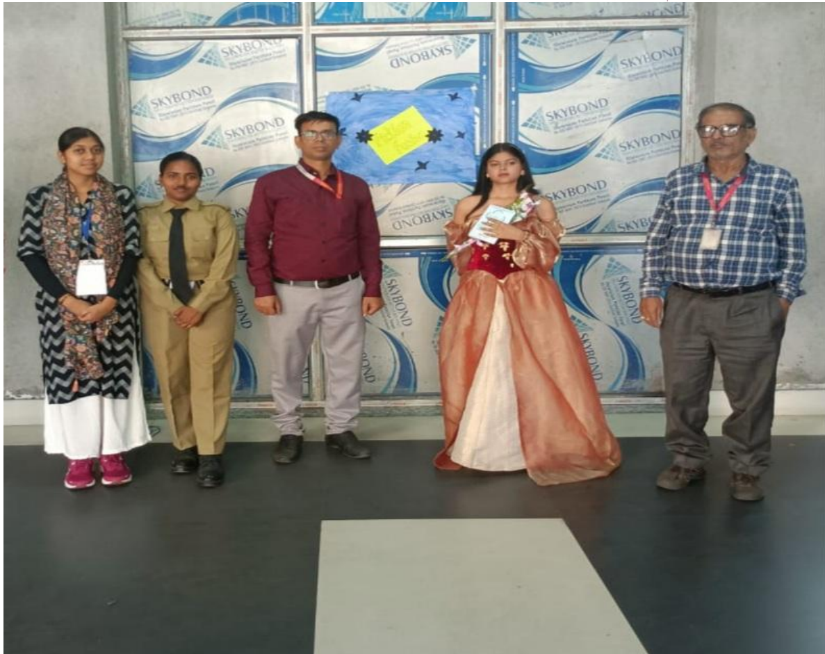
Figure 4: A group photo was taken during the certificate and prize distribution ceremony, capturing the joyful moments of celebration and achievement.