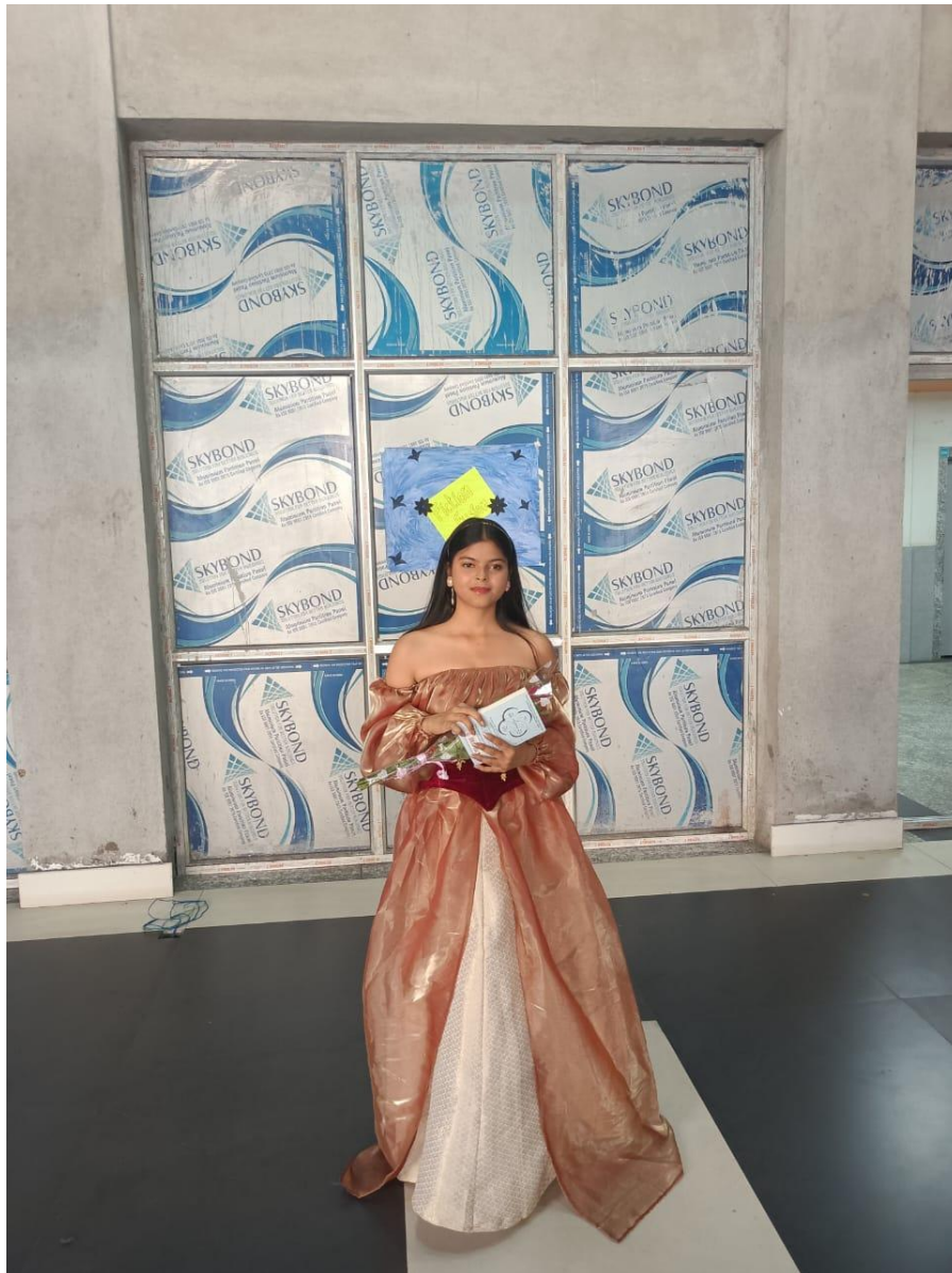
Figure 2: Students showcased their acting skills through engaging performances in a public space, captivating the audience with their creativity and stage presence.