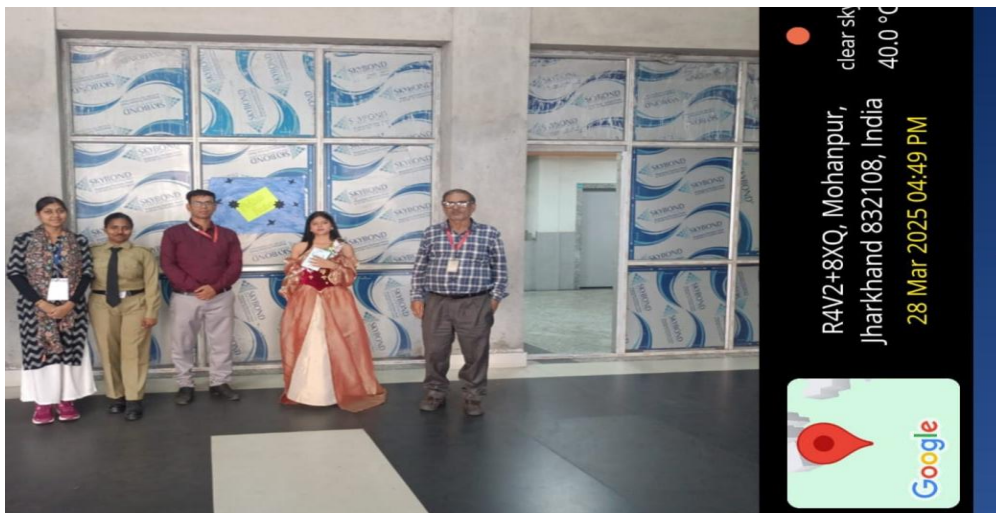
Figure 5: A group photo was taken during the certificate and prize distribution ceremony, capturing the joyful moments of celebration and achievement.