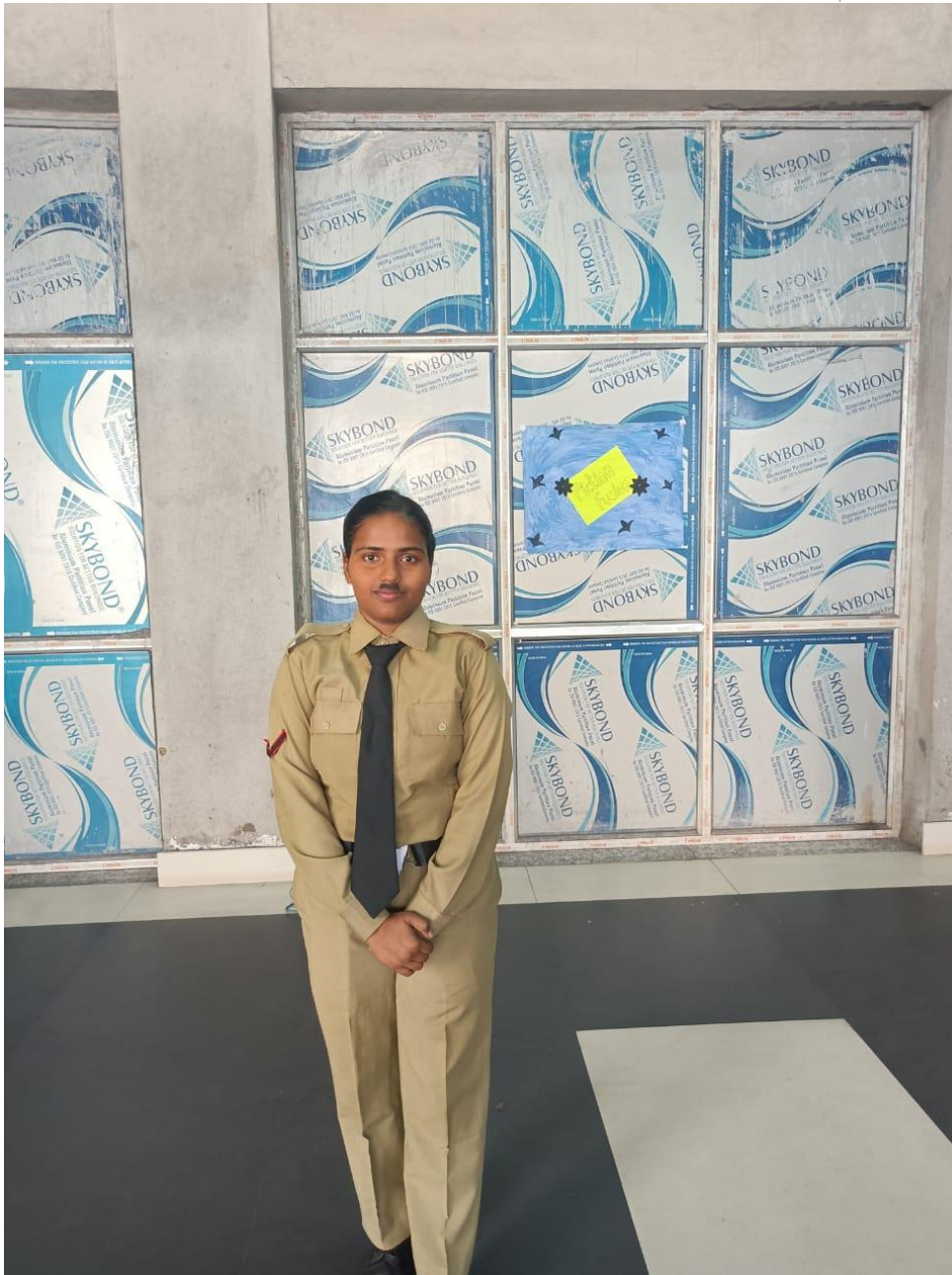
Figure 3: Students demonstrated their acting talents through dynamic performances in a public setting, captivating the audience with their creativity, expression, and confident stage presence.