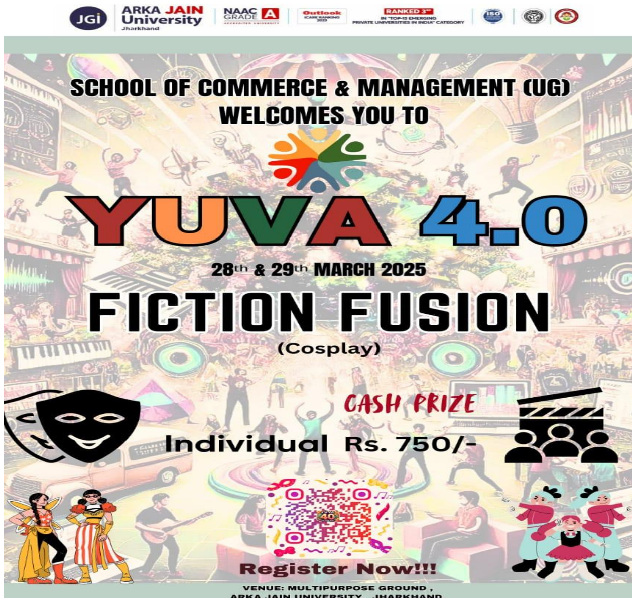
Figure 1: Poster of Fiction Fusion organized by Department of BBA & B.Com(H)