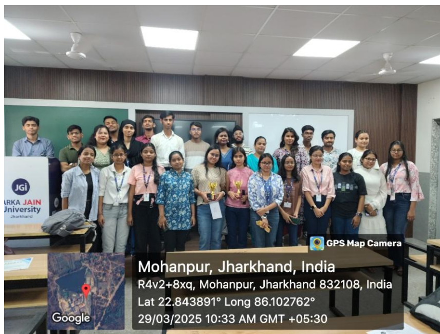
Fig 2: Group Photo