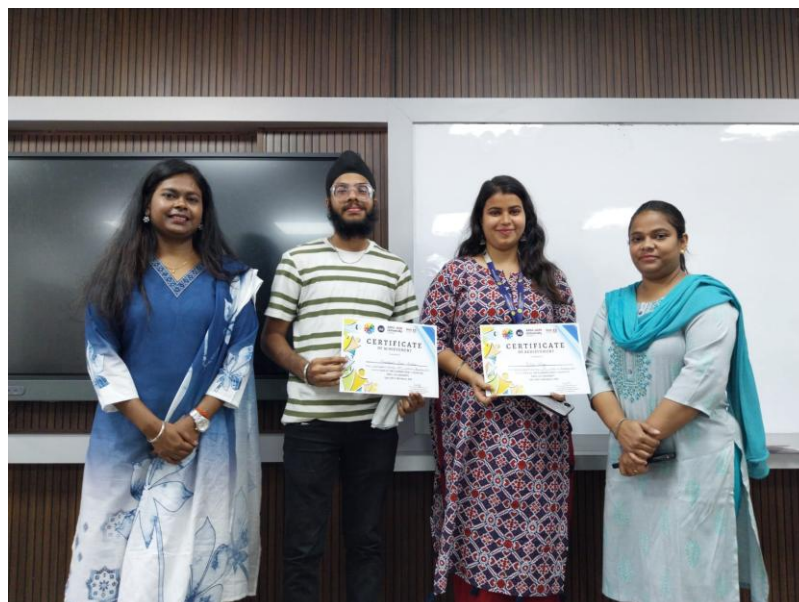
Fig 4: Winner & Runner-up of the Event