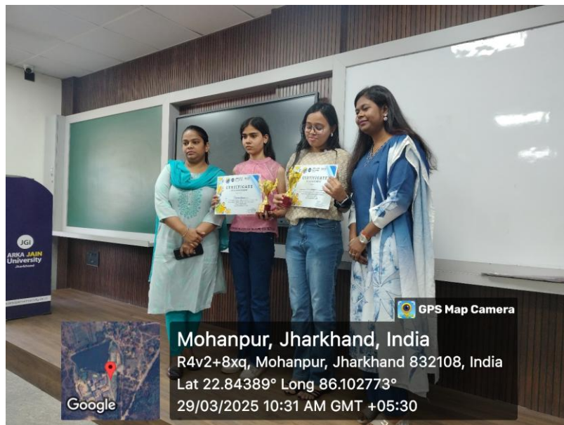
Fig 3: Winner & Runner-up of the Event