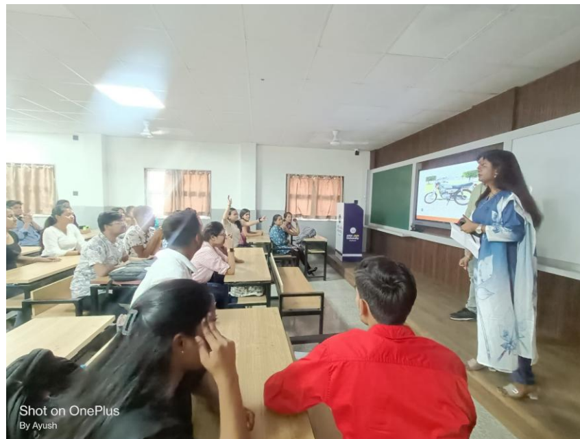
Fig 1: During Competition