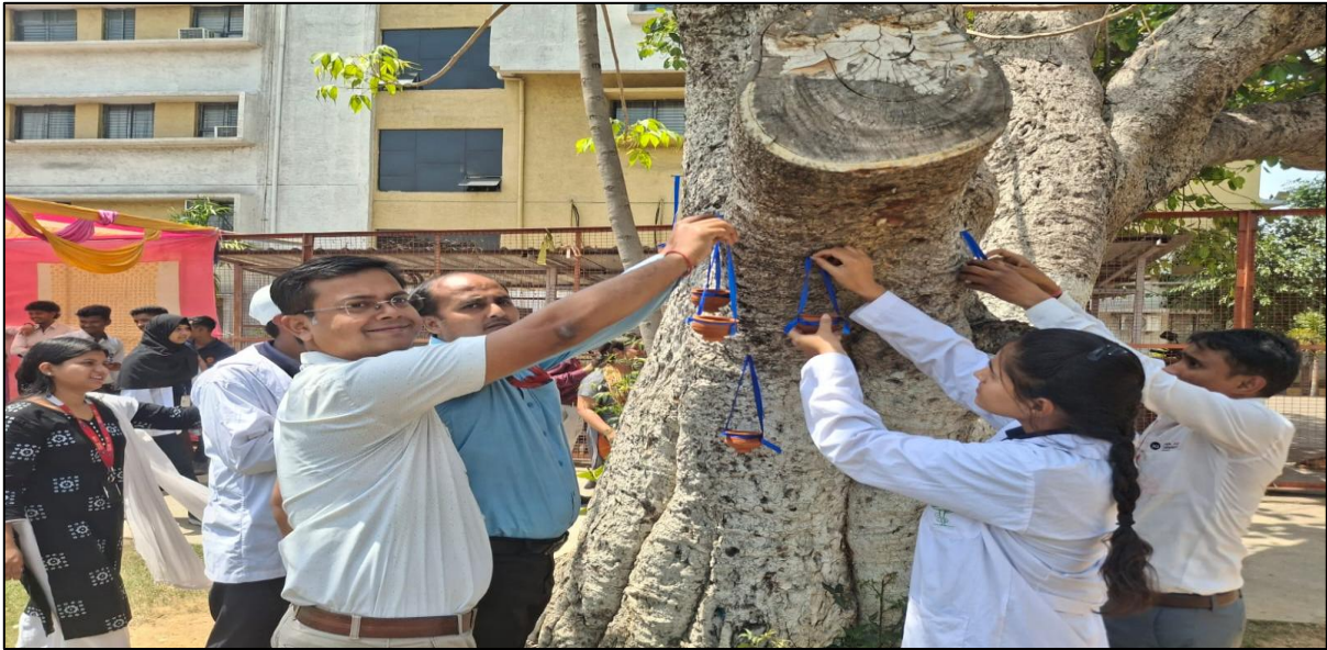
Figure 4: A Day for Birds – IV: Celebrating World Sparrow Day and Jan Jatiya Gourav Varsh with action and awareness