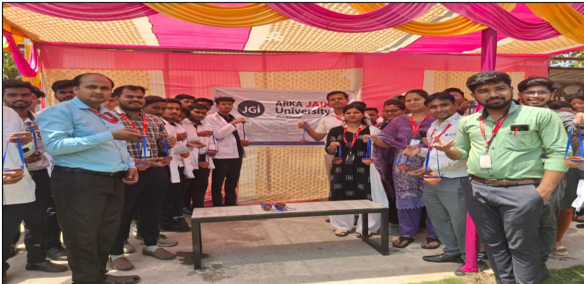
Figure 3: Compassion in motion — hands-on activity promoting bird welfare on campus