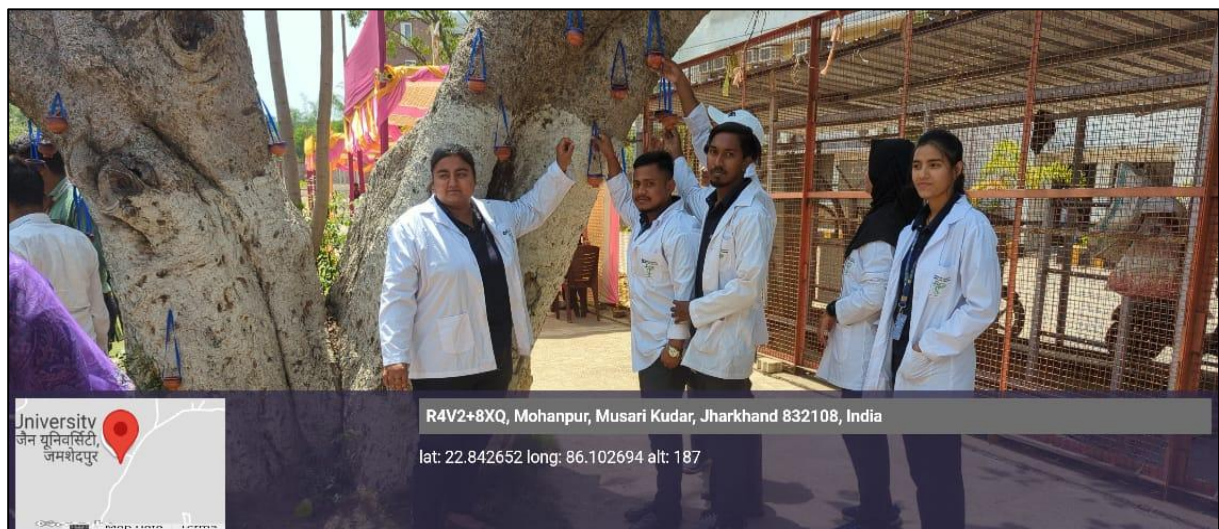
Figure 2: Student volunteers are contributing to bird conservation by hanging water-filled earthen pots across campus