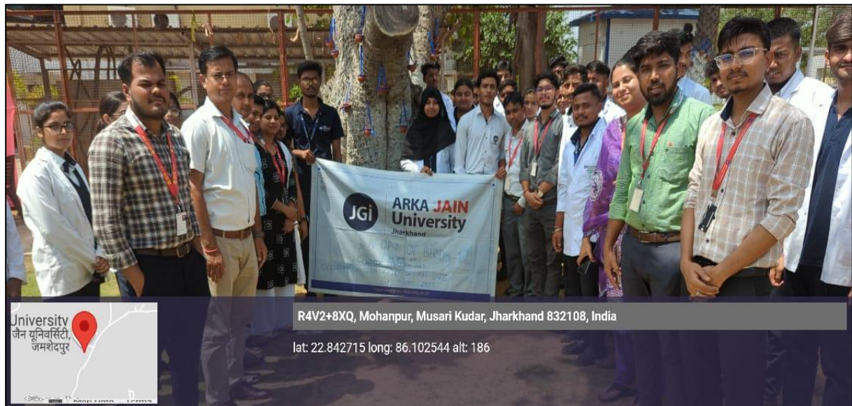
Figure 1: Honouring World Bird Day, pharmacy students and faculty come together to hang earthen pots—small steps toward a compassionate and sustainable environment