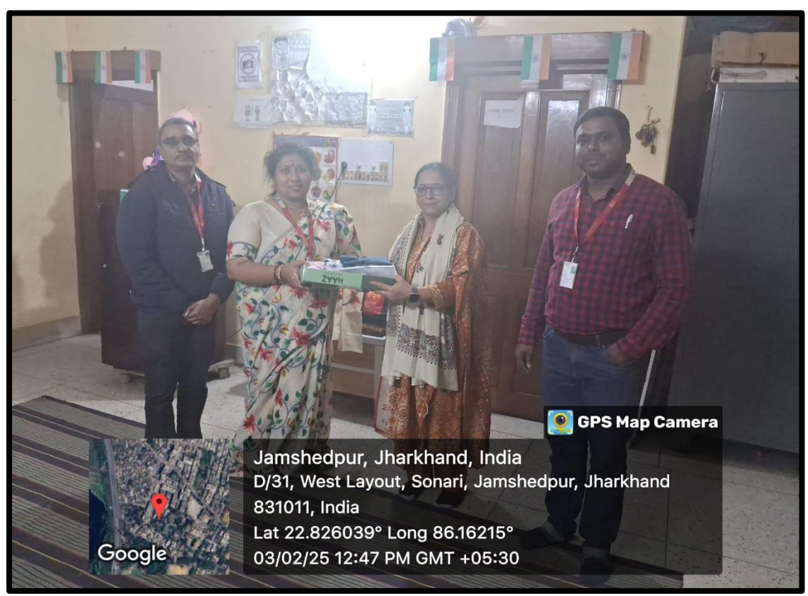
Fig. 2- Felicitating coordinator of orphanage sahyog