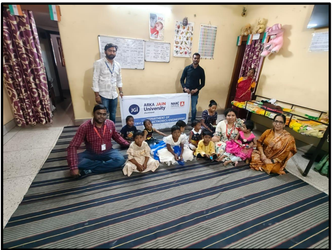
Fig.1- Orphanage kids with us