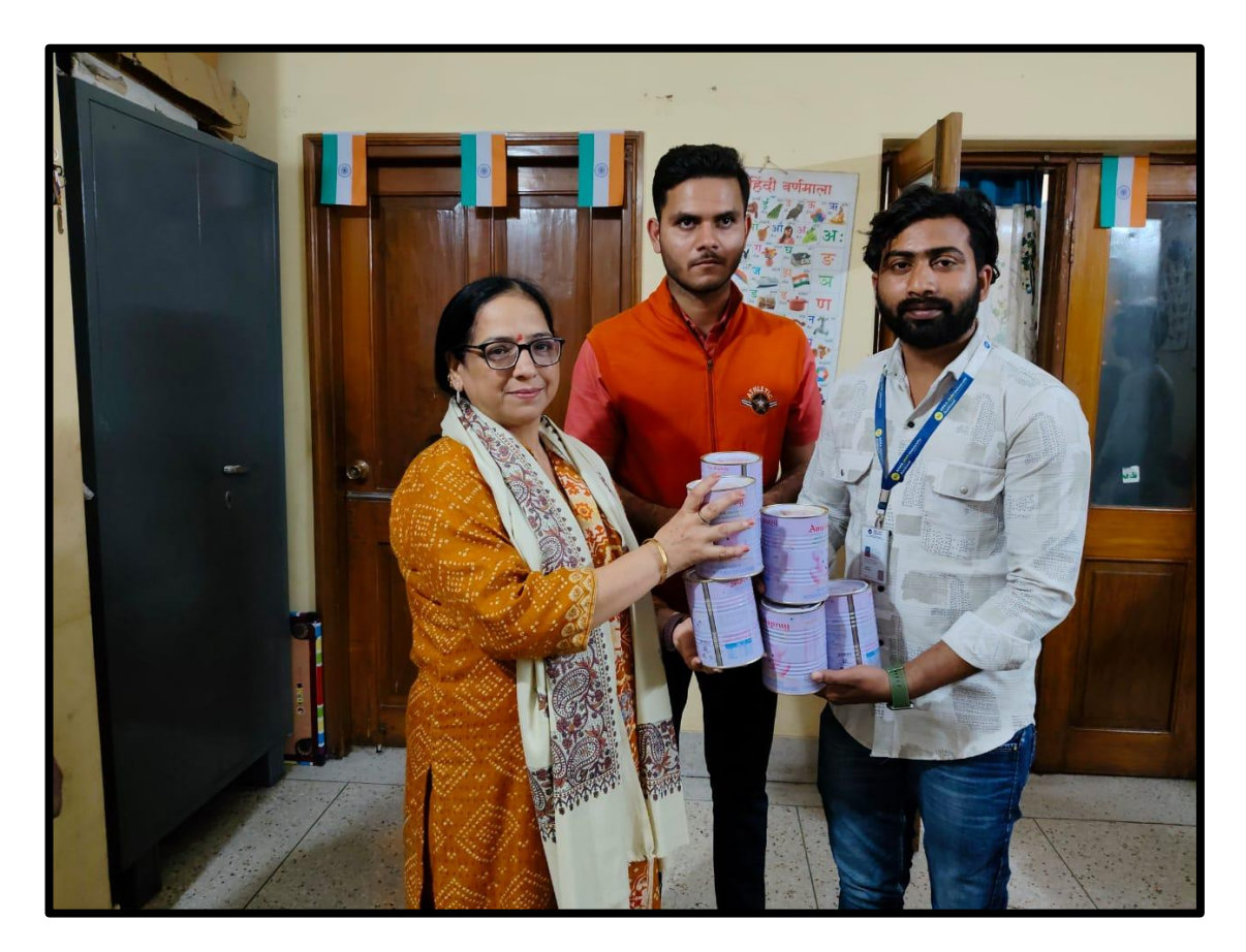
Fig. 3- Students donating Milk powder