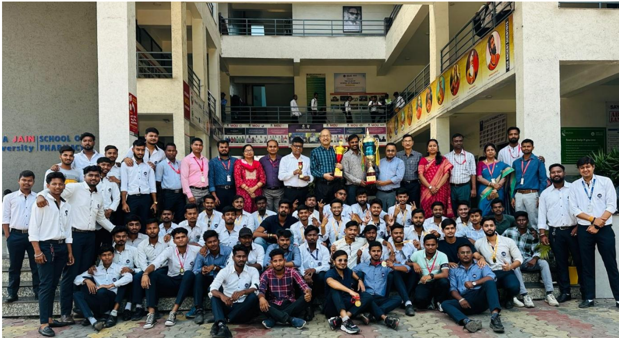
Fig.1- Team AJU acknowledged by University