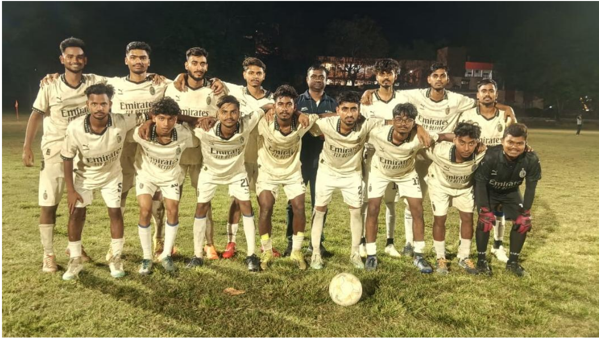
Fig.5- Football team reached to semi-final