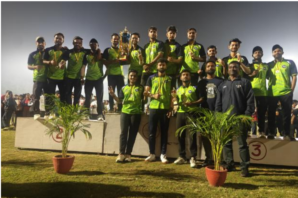
Fig.2- Winner in Cricket