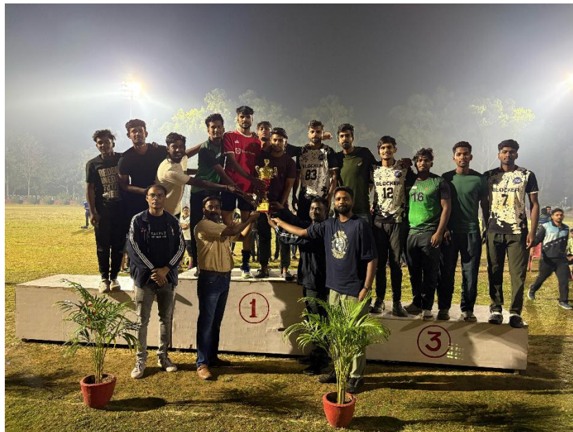
Fig.3- Winner in Volley Ball