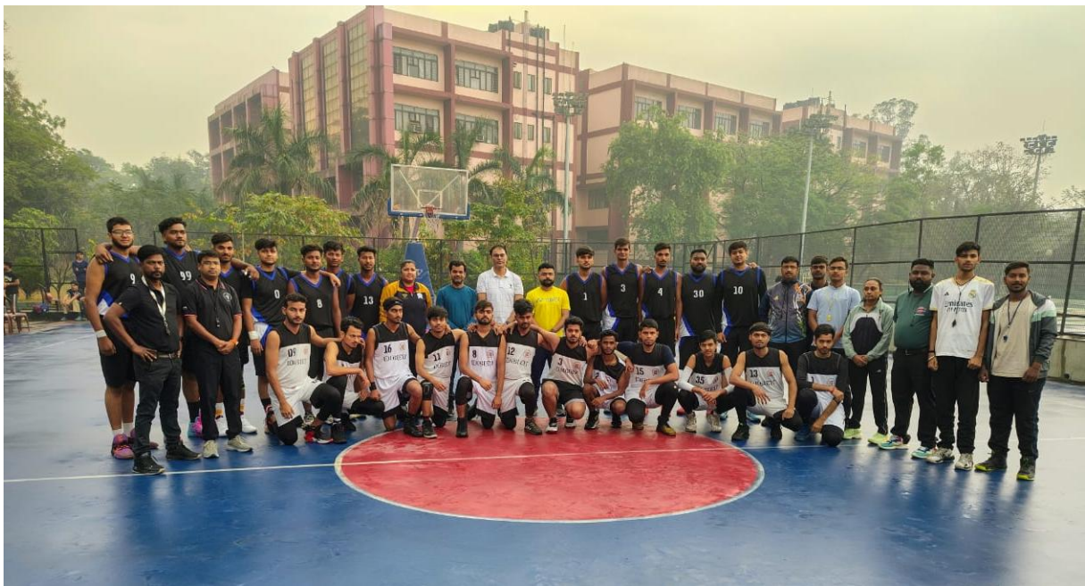
Fig.5- Basketball team reached to semi-final