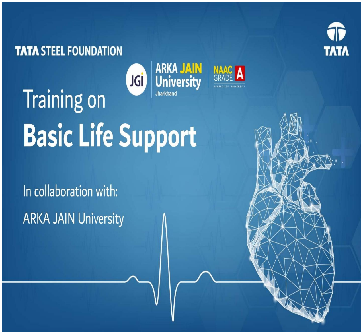
Poster of the Event: Training Session on BLS/ BCLS