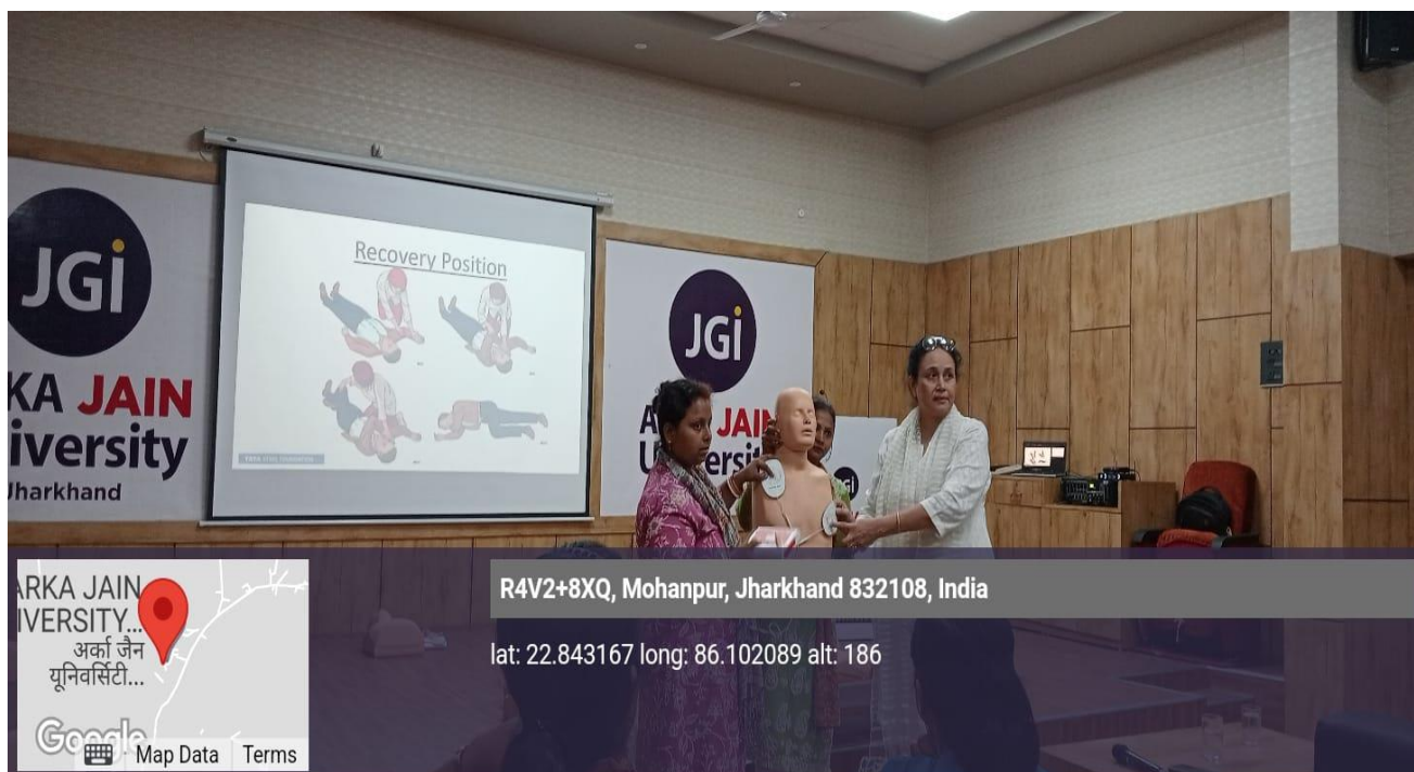
Photo of the Event: Live demonstration on placement of AED (AUTOMATED EXTERNAL DEFIBRILATOR)