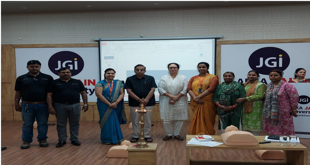
Photo of the Event: Inaugural of the Training Session on BCLS/ BLS