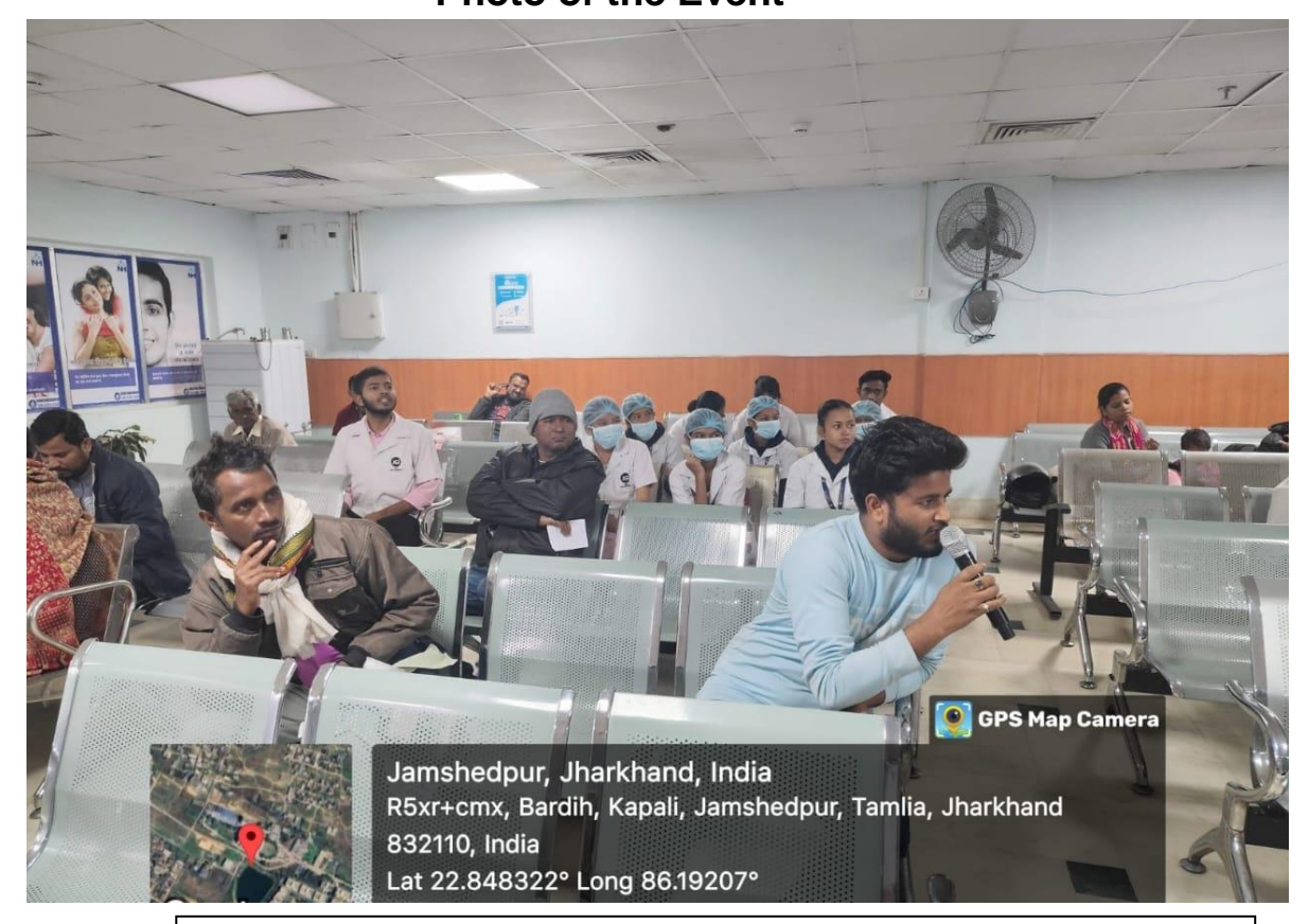
Photo of the Event: An interactive session between Students & OPD patients