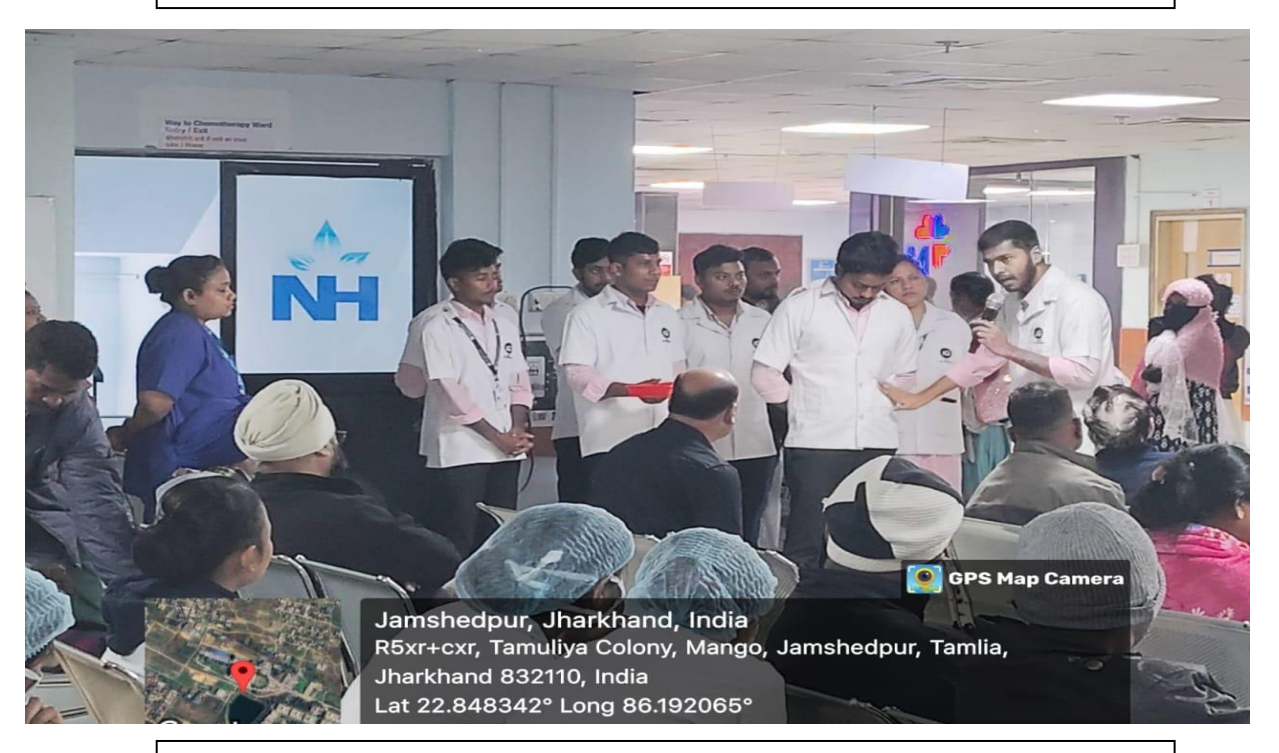
Photo of the Event: Students demonstrating the site of Insulin Administration