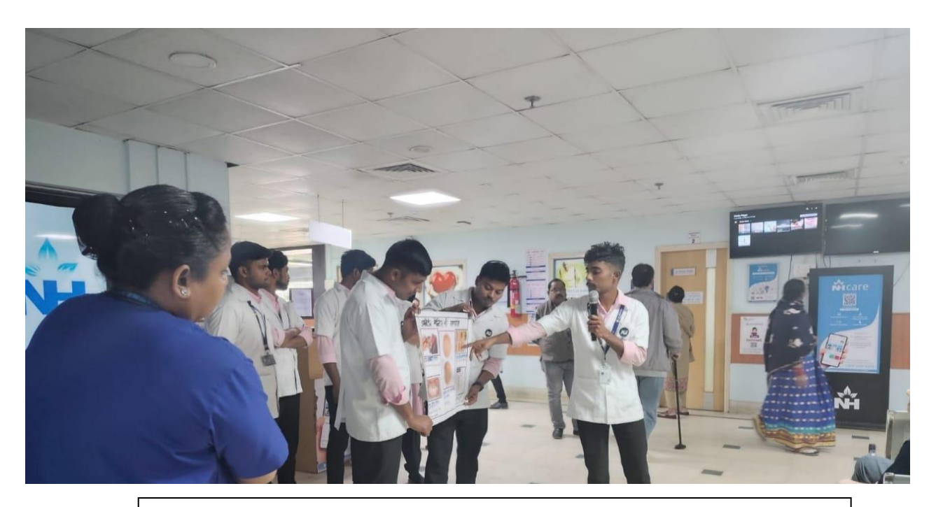
Photo of the Event: A snap of the students giving health talk regarding diabetes