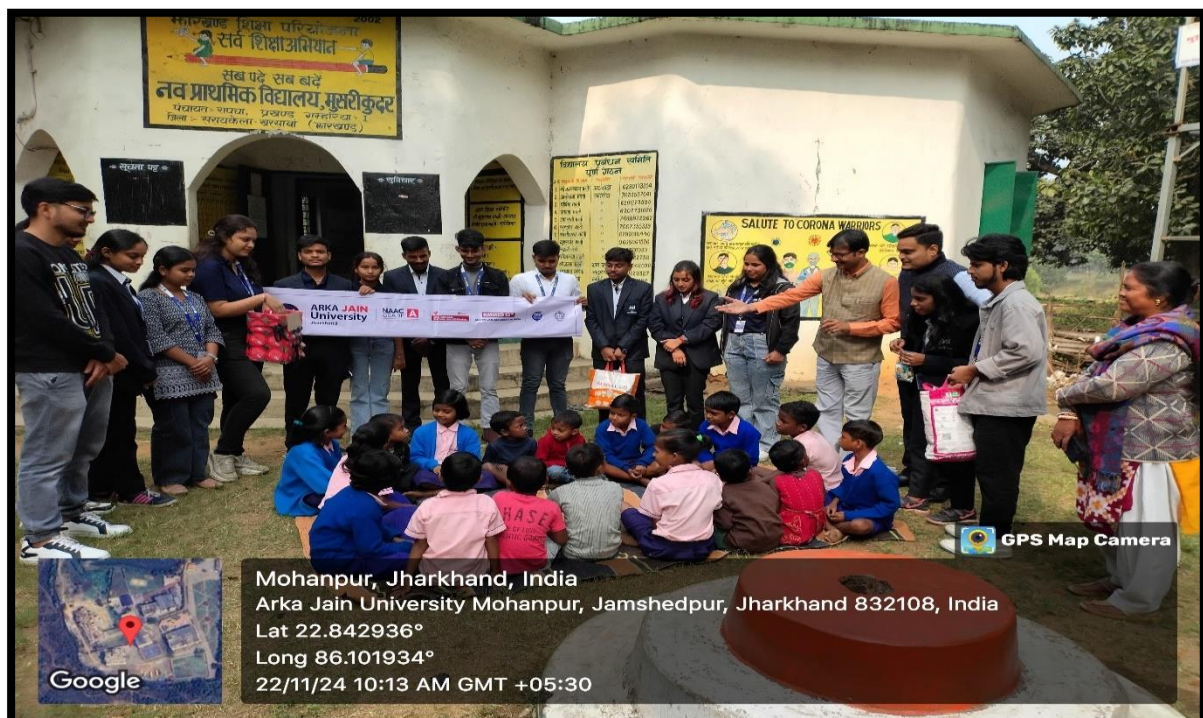
Engaging session between children and participants