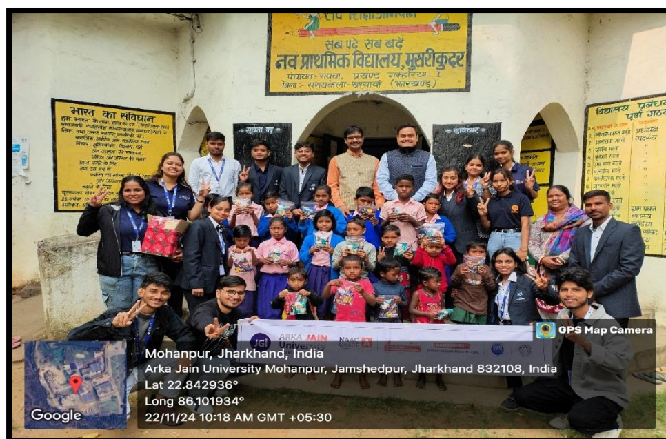
Smiling faces of children after receiving small kits from participants at Primary School near Musarikudar village