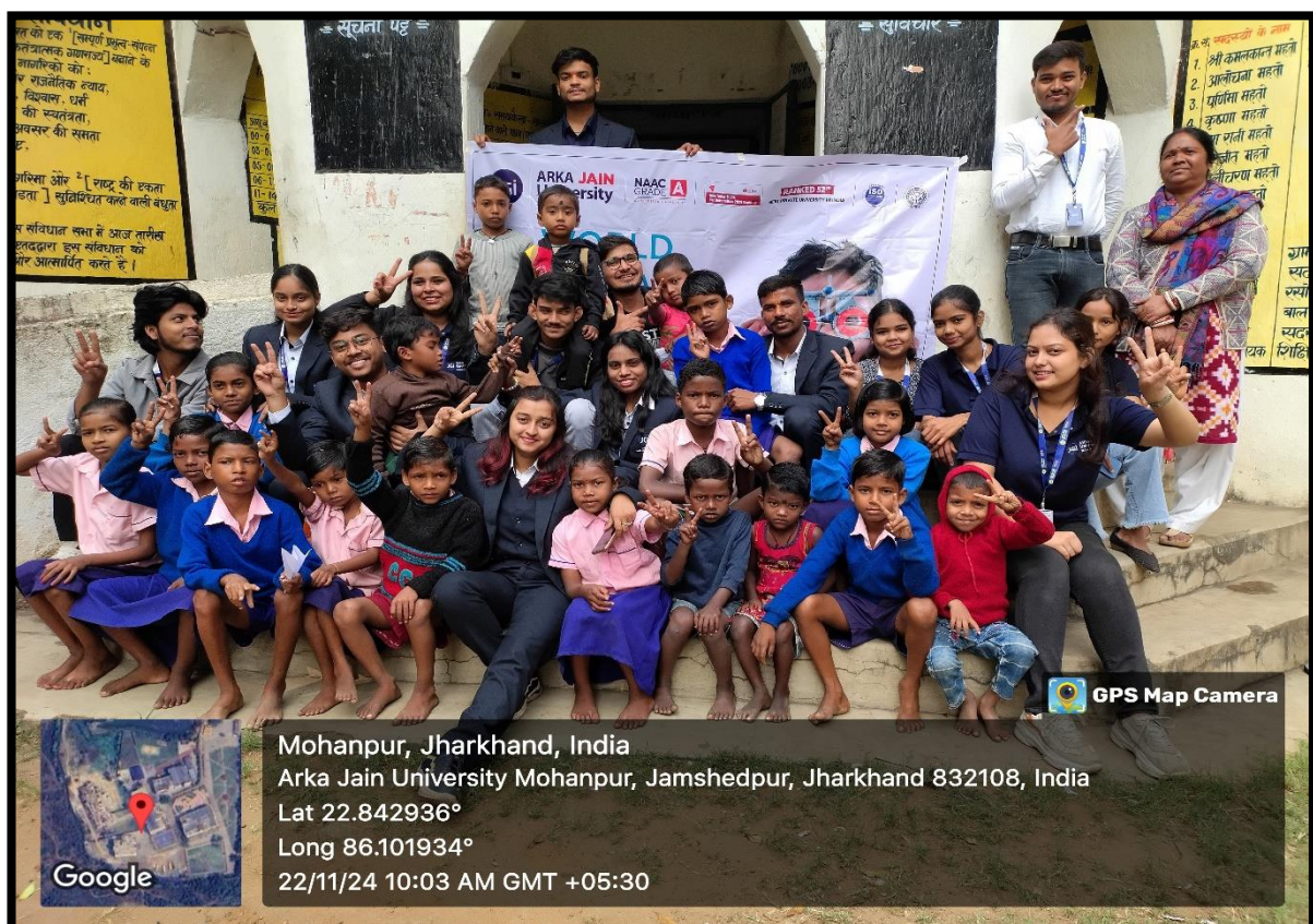
WORLD KINDNESS DAY-2024 Celebration