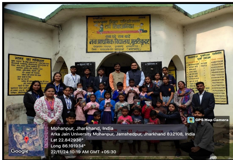
"WORLD KINDNESS DAY"- celebration at Primary School near Musarikudar Village.