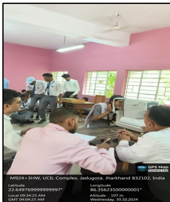
Eye Checkup Camp by the MoU partner- ASG Eye Hospital