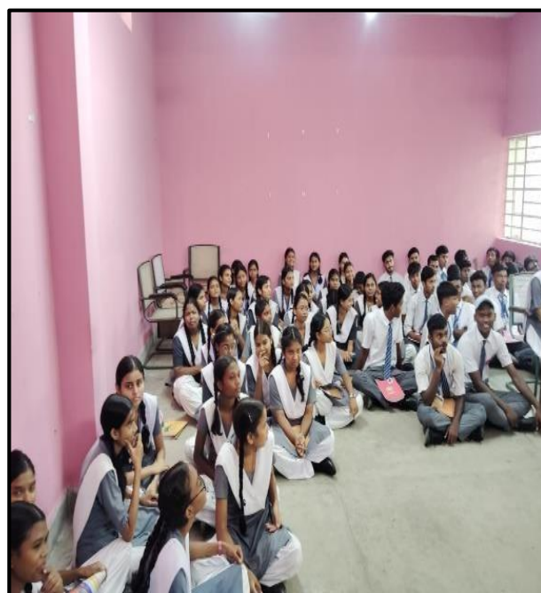
Participants for the awareness session