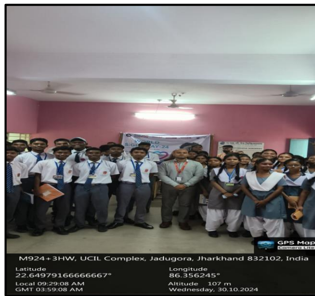
Group Picture with the presenter and the participants of the school