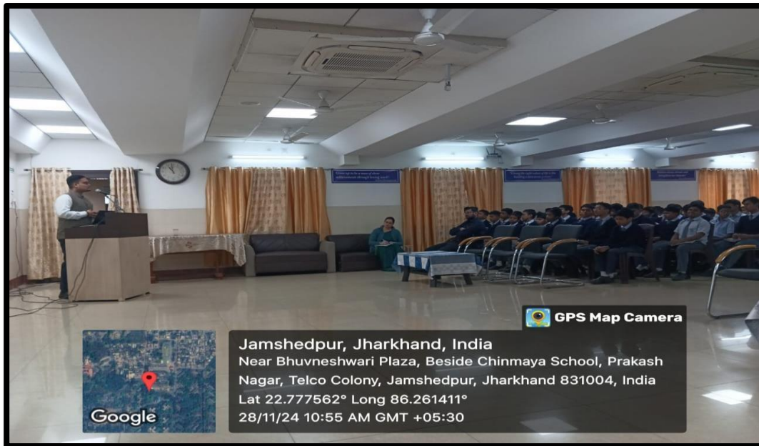
Participants attending the session