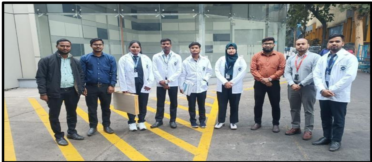
Group pic of the Team