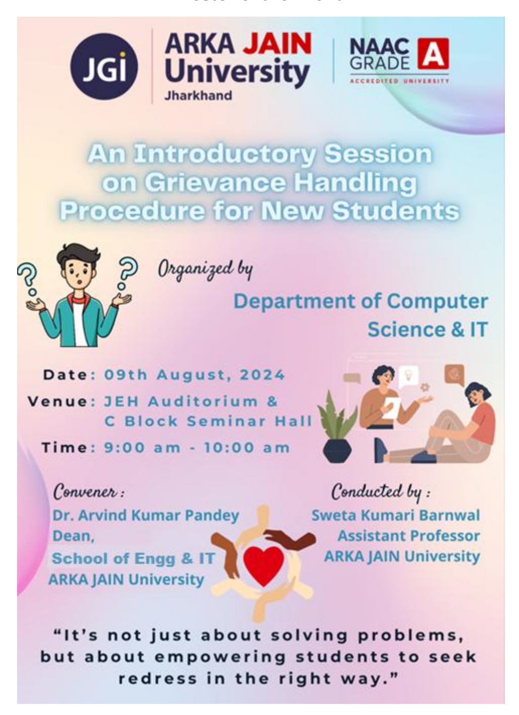
Figure 1: Poster of the Event: An Introductory Session on Grievance Handling Procedure for New Students