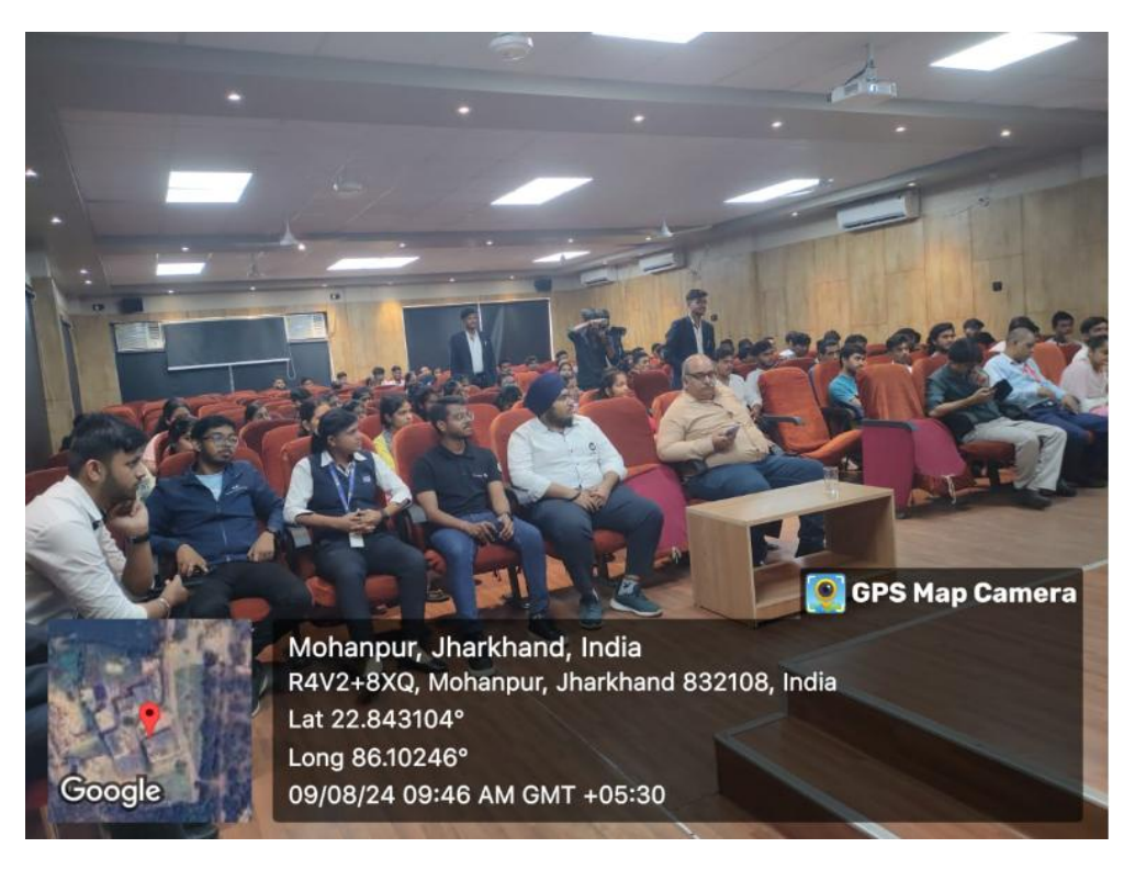
Figure 2. Event: Students Concentrating on Speaker's Talk