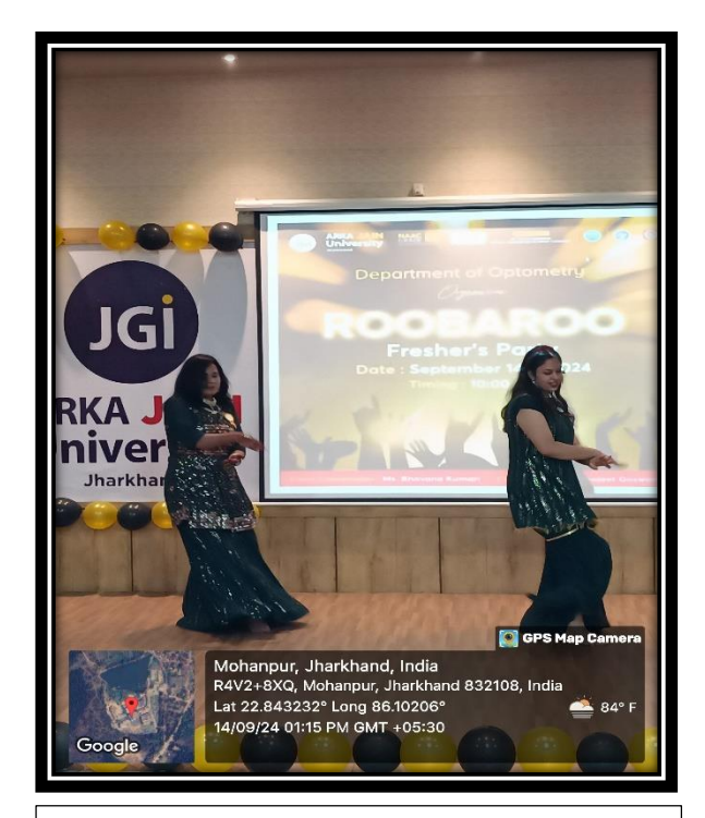
Fig 8: Cultural program by 1st year student in Talent Hunt Round