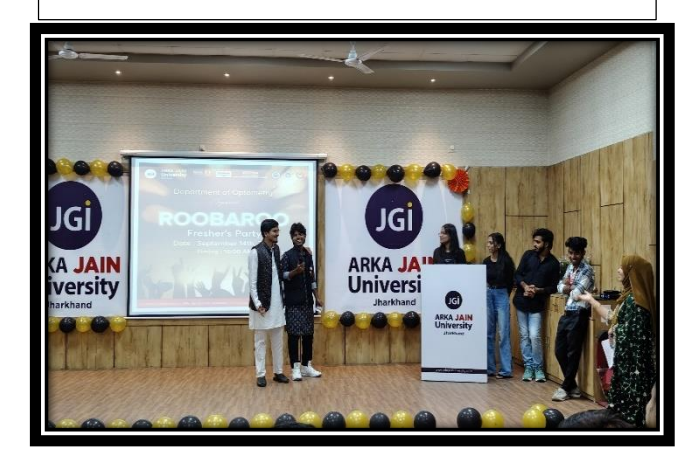
Fig 13: Glimpse of Chit game during The Fresher's Party.