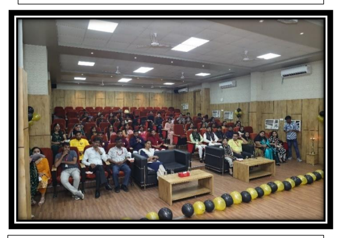
<u>Fig 5: Participants and faculties member</u> <u>present in the event.</u>