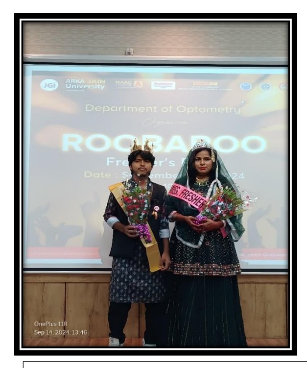
Fig 9: Mr & Ms. Fresher 2024 of Department of Optometry.