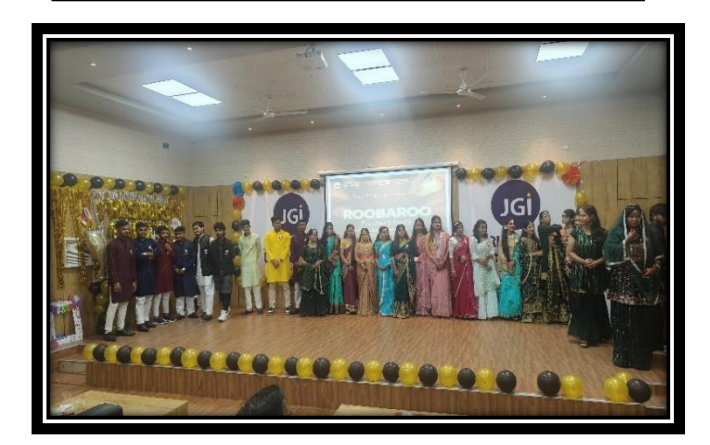
Fig 10: Participants assembled together for Ramp walk session.