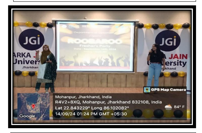
Fig 12: Duo singing by 2<sup>nd</sup> year students.