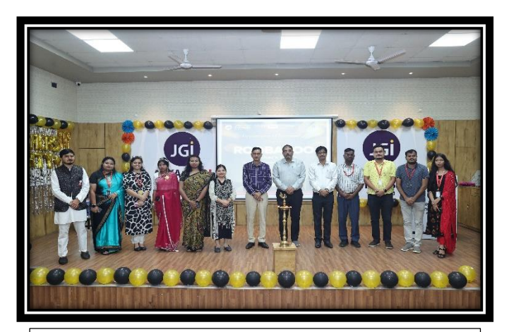
Fig 2: Dignitaries with all the faculties of the department assembled for the lamp lightening