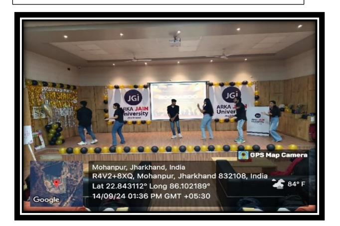
Fig 11: Group dance by 2<sup>nd</sup> year students.