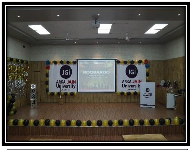
Fig 7: Stage decoration and all set for the welcoming fresher's.