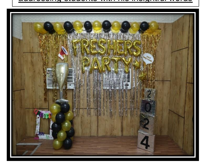
Fig 6: Decoration for the Event