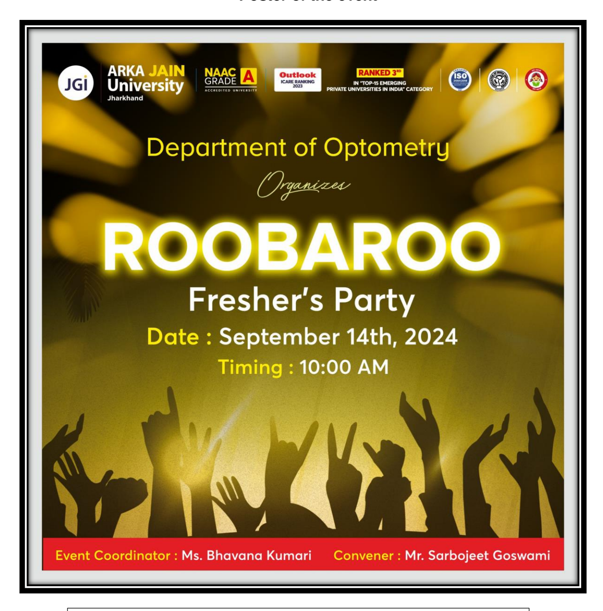
Fig 1: Poster of the event