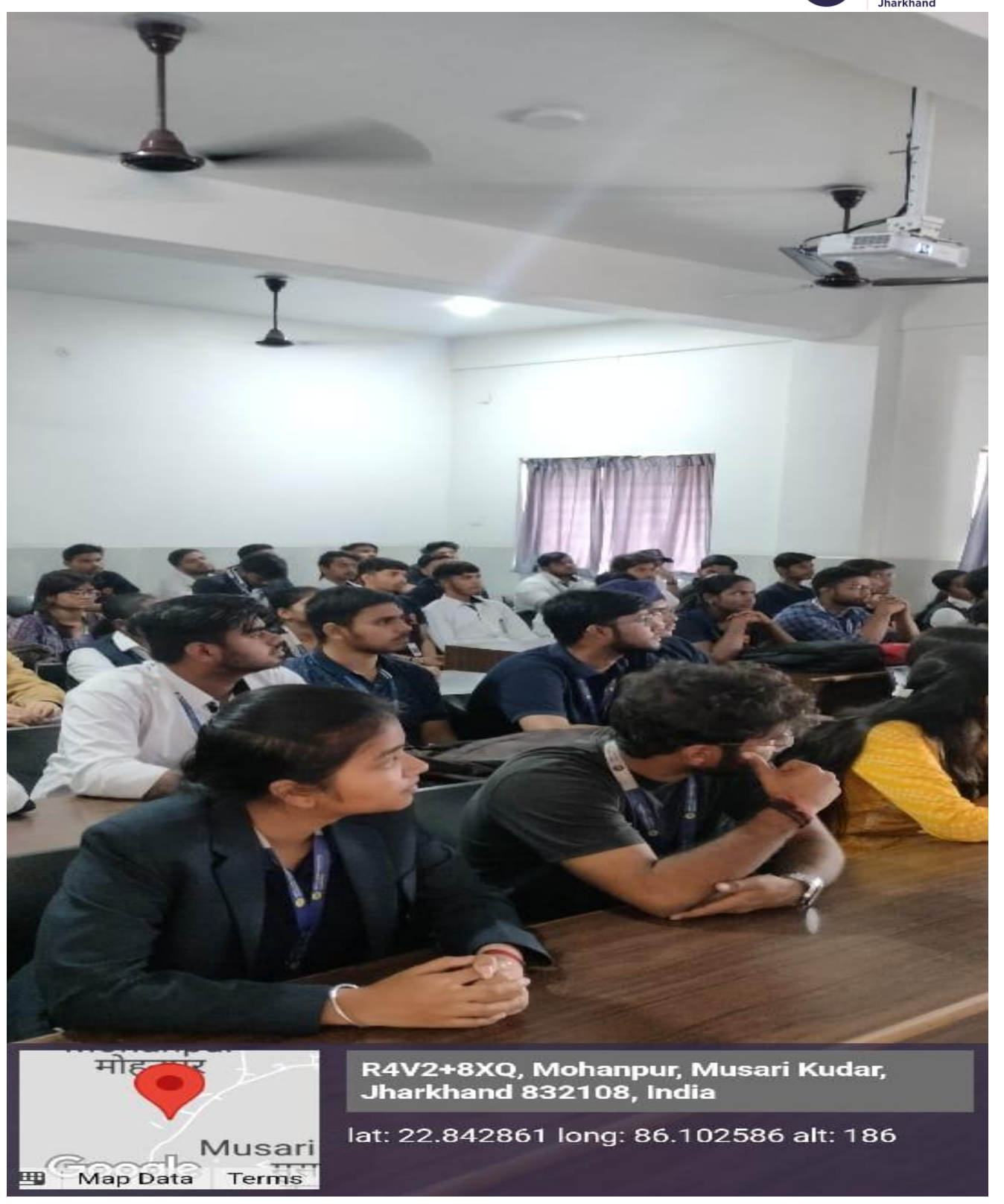
Fig 2. Workshop on Cyber security