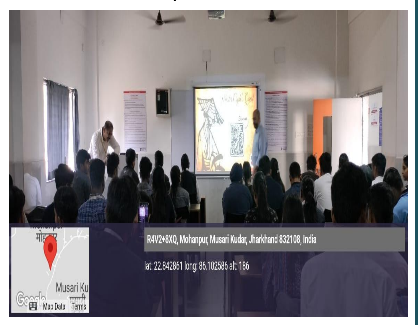
Fig 1. Workshop on Cyber security