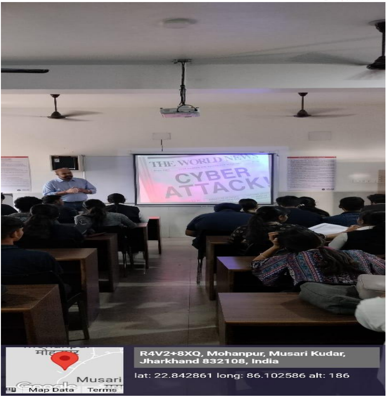
Fig 3. Workshop on Cyber security