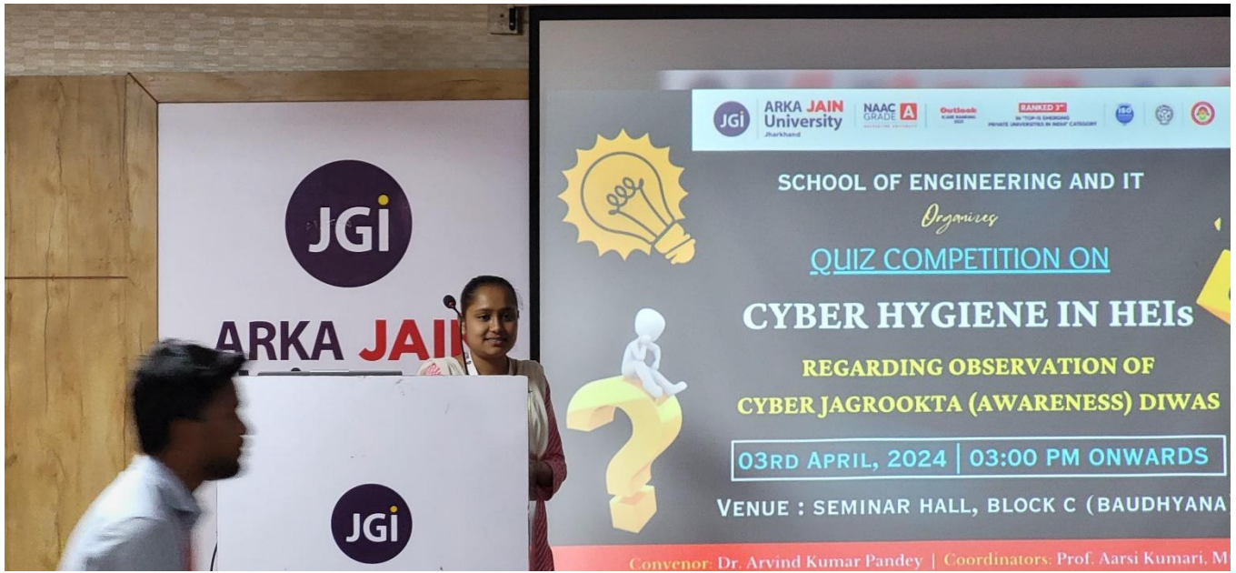
Figure 4: Photos of the event