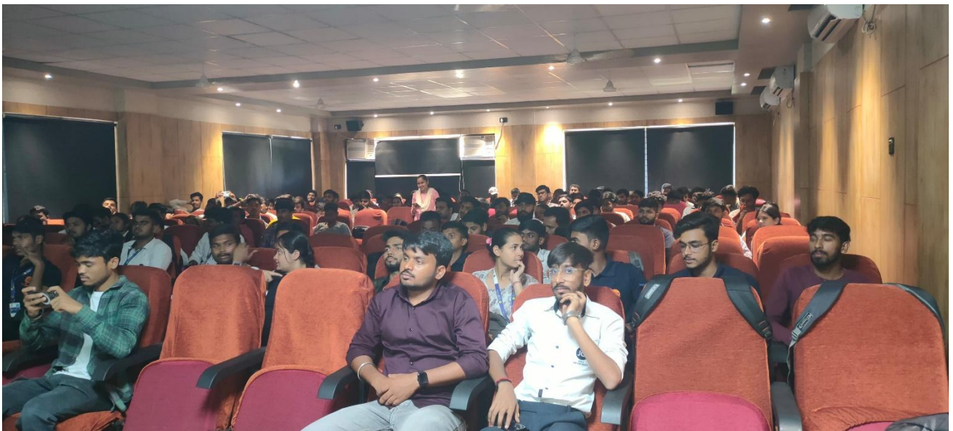
Figure 3: Photos of the event