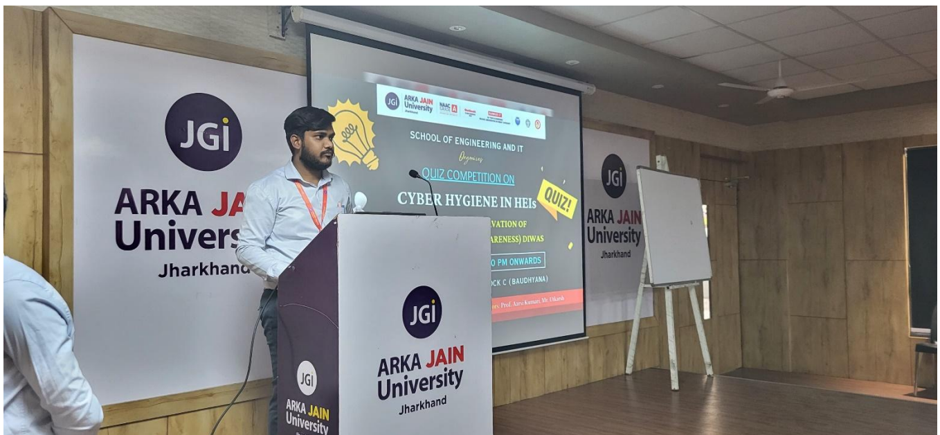
Figure 5: Photos of the event