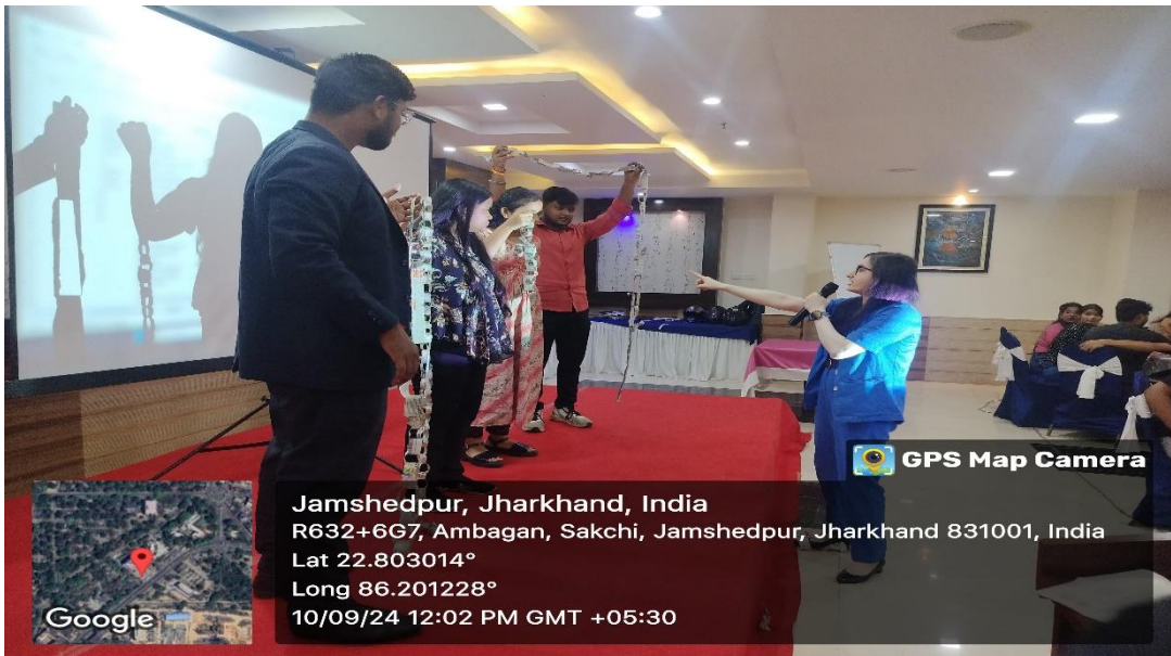
Figure 6: ONE-DAY OUTBOUND TRAINING PROGRAM REDISCOVERING SELF - EXPLORING PERSONA FOR MCA ON 10 TH SEPT,2024