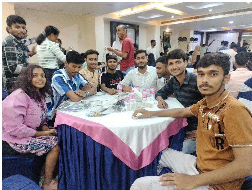
Figure 4: ONE-DAY OUTBOUND TRAINING PROGRAM REDISCOVERING SELF - EXPLORING PERSONA FOR MCA ON 10 TH SEPT,2024