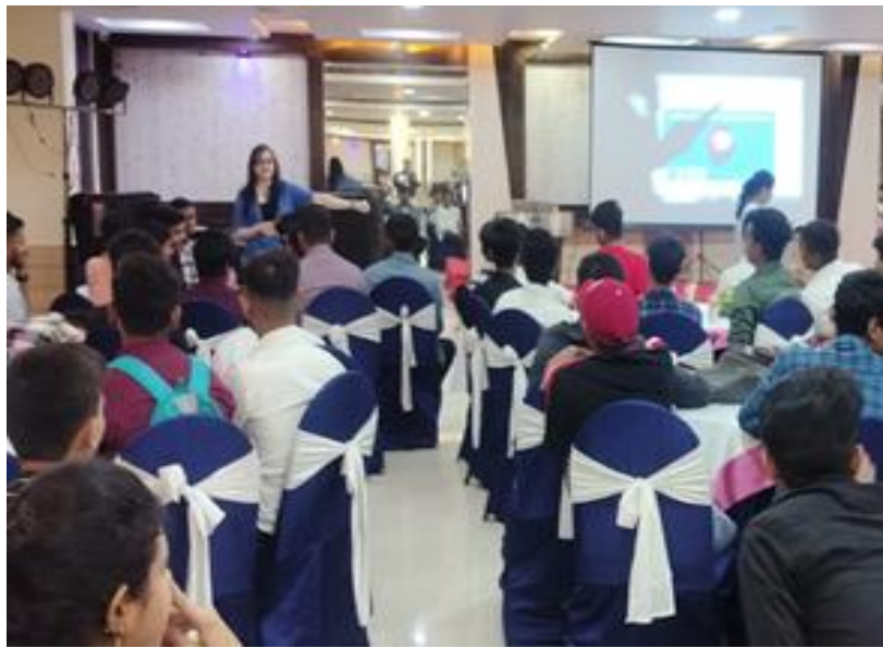
Figure 3: ONE-DAY OUTBOUND TRAINING PROGRAM REDISCOVERING SELF - EXPLORING PERSONA FOR MCA ON 10 TH SEPT,2024