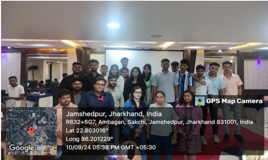
Figure 5: ONE-DAY OUTBOUND TRAINING PROGRAM REDISCOVERING SELF - EXPLORING PERSONA FOR MCA ON 10 TH SEPT,2024