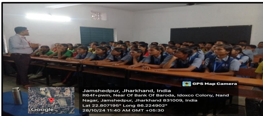
Participants attending the session and getting aware about the Myopia