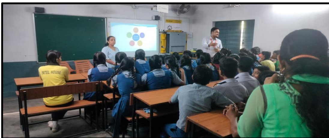
Glimpse of the presentation and participants attending the session