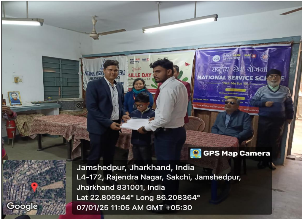
FIG.3- CELEBRATION AT NATIONAL ASSOCIATION OF BLIND SECONDARY SCHOOL