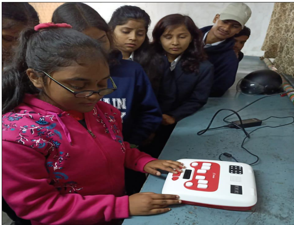
FIG.2- NABSS STUDENT SHOWING ANNIE GAME USEFUL LEARNING PROCESS.