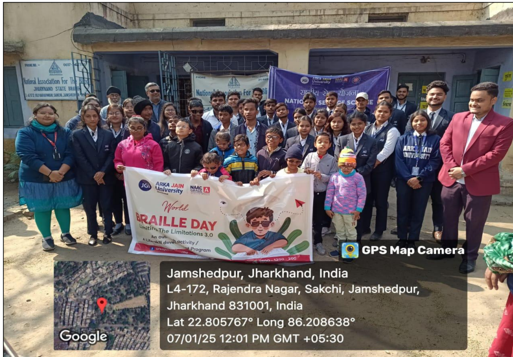
FIG.1- CELEBRATION AT NATIONAL ASSOCIATION OF BLIND SECONDARY SCHOOL