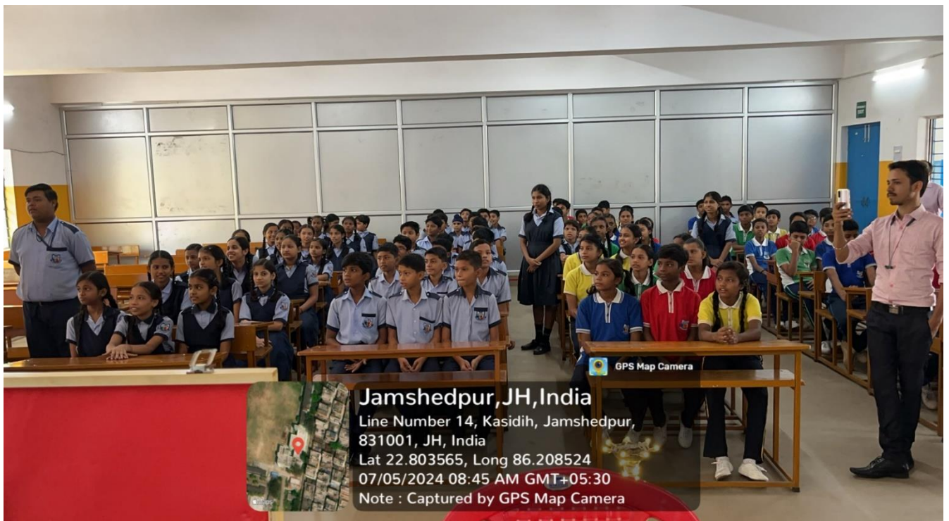
Fig 6: Group picture of the students participants of visual eye screening camp.