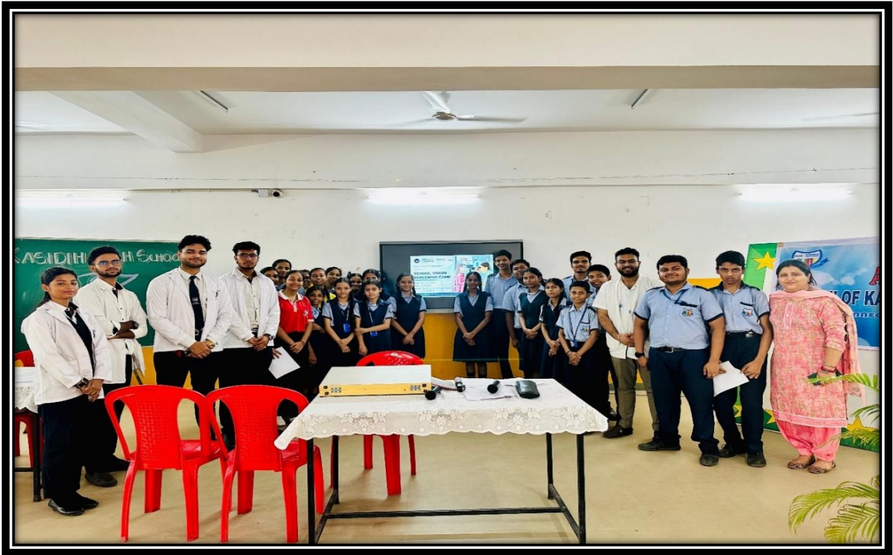
Fig 2: Group picture with faculty members & camp participants of Kasidih High School