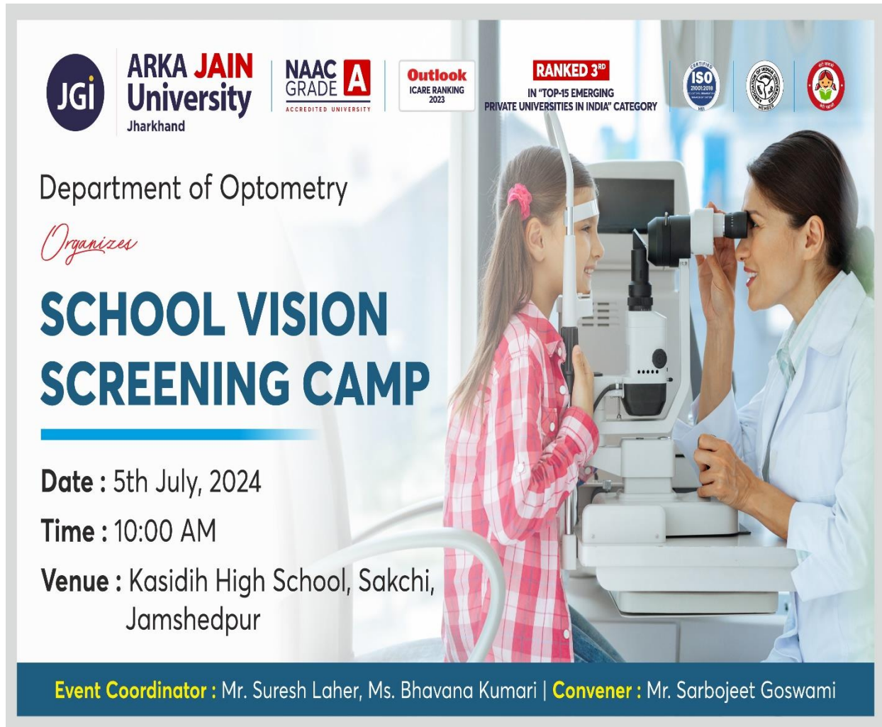
Fig1: Poster of the event