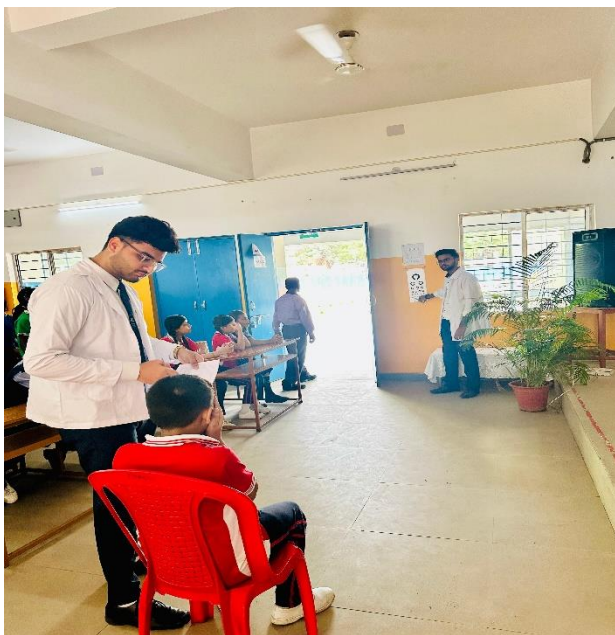
Fig 3: Examiner taking visual Acuity