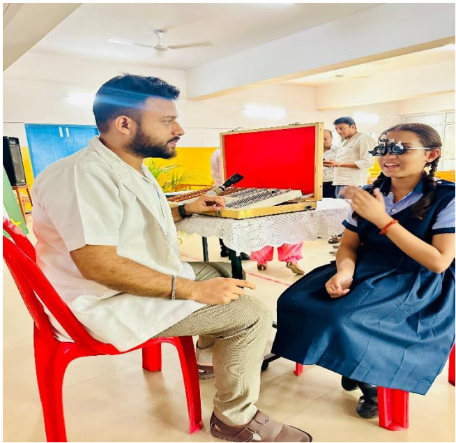
Fig 4: Examiner performing subjective refraction