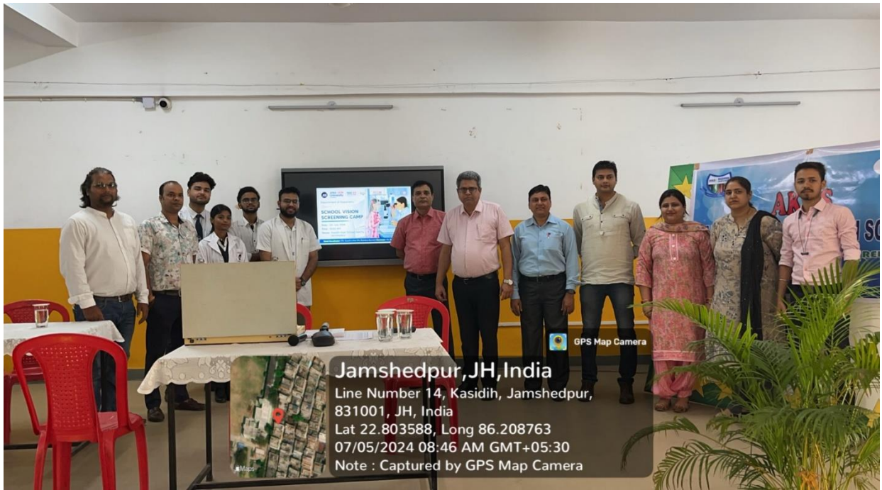
Fig 5: Group picture with faculty members of Kasidih High School & Students volunteers of Arka Jain University