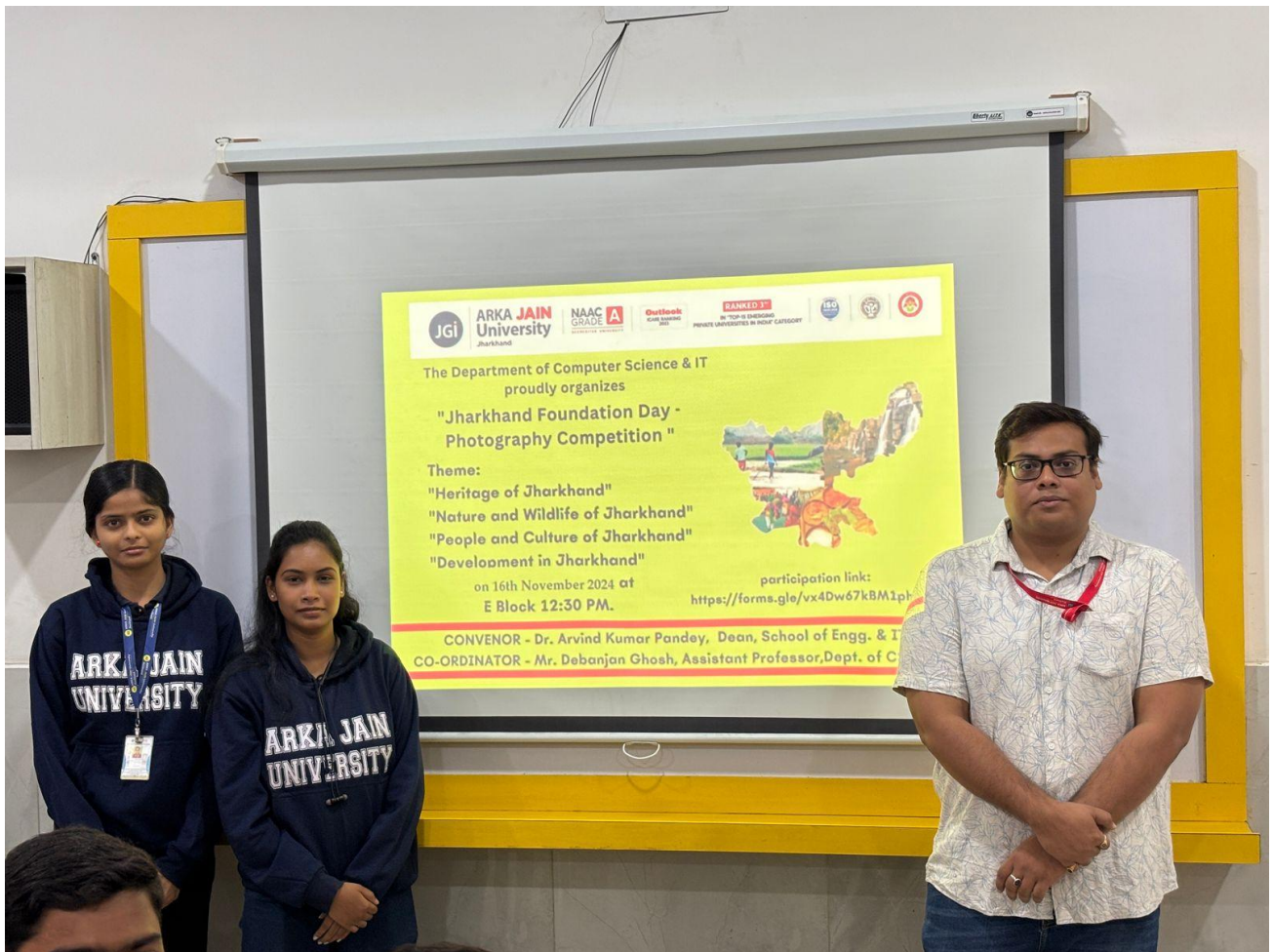
Figure 4: Photo of the event "Jharkhand Foundation Day - Photography Competition" On November 16 th , 2024