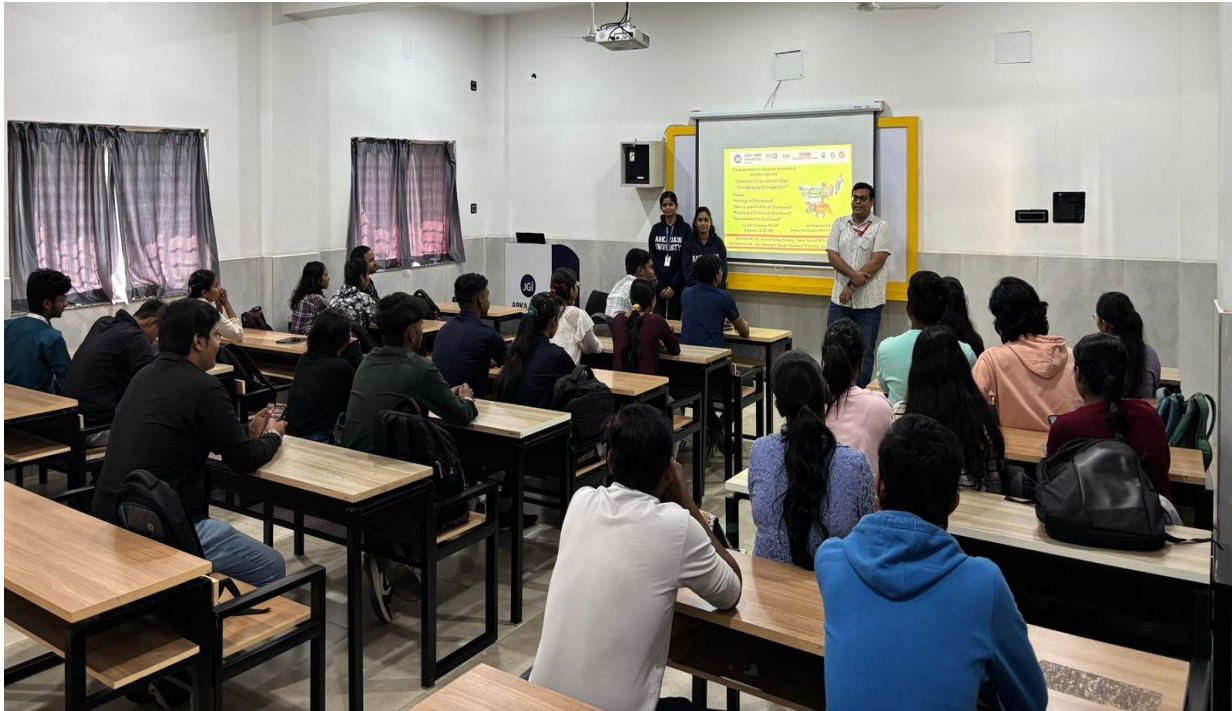
Figure 3: Photo of the event "Jharkhand Foundation Day - Photography Competition" On November 16 th , 2024