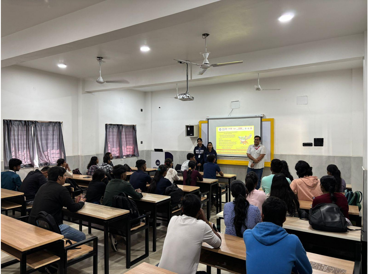
Figure 2: Photo of the event "Jharkhand Foundation Day - Photography Competition" On November 16 th , 2024