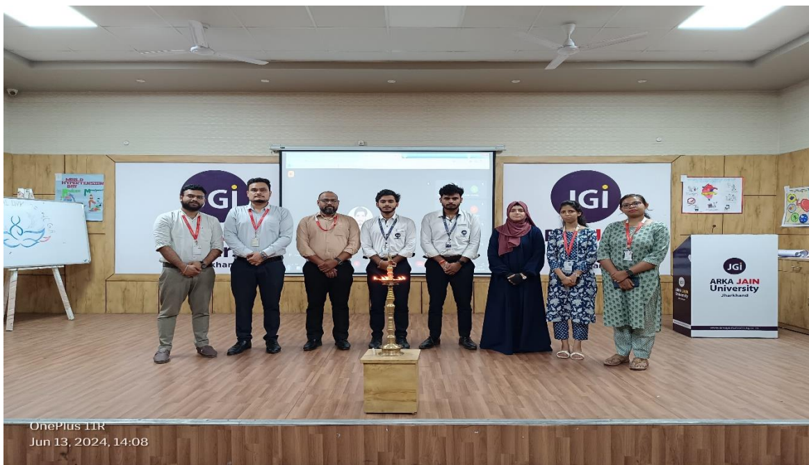
Fig 3: Faculties and students assembled for lamp lightening