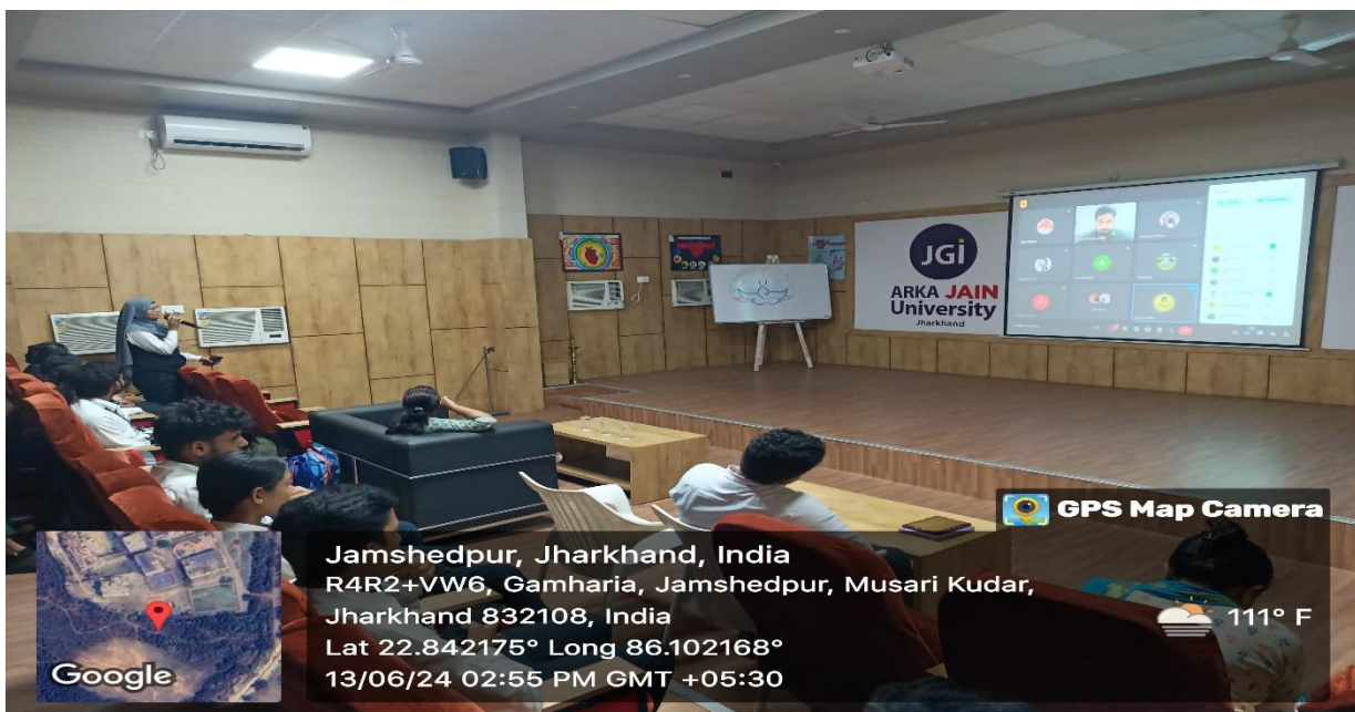
Fig 5: Questions and answers session of the event.