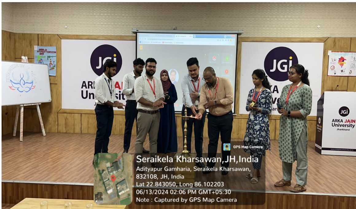
Fig 2: Glimpse of lamp lightening