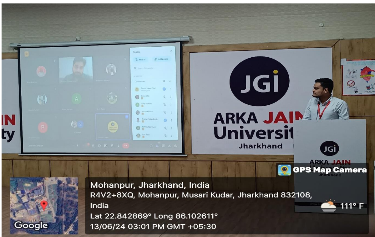
Figure 7: HOD Mr. Sarbojeet Goswami, PC, Dept. of Optometry wrapping up the session