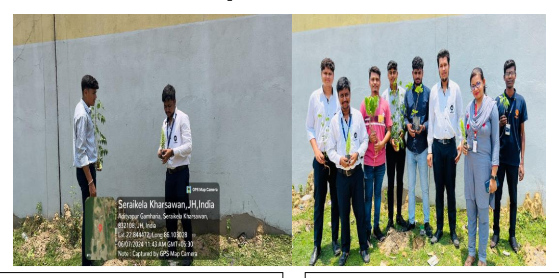
Fig 1. Planting trees in garden area