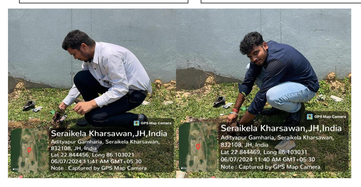
Fig 3. Planting tree by students