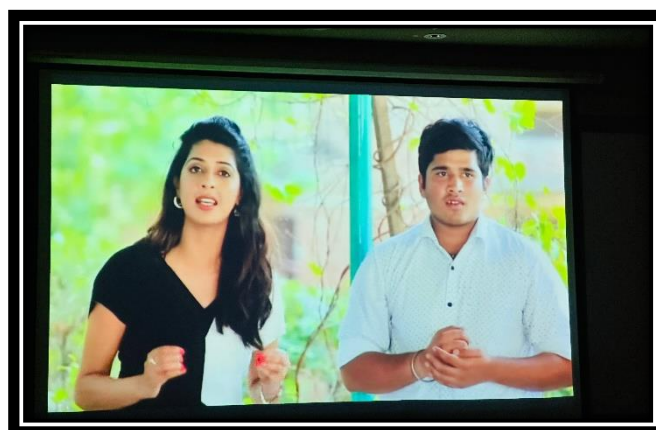
Fig 9: Glimpse of the video.