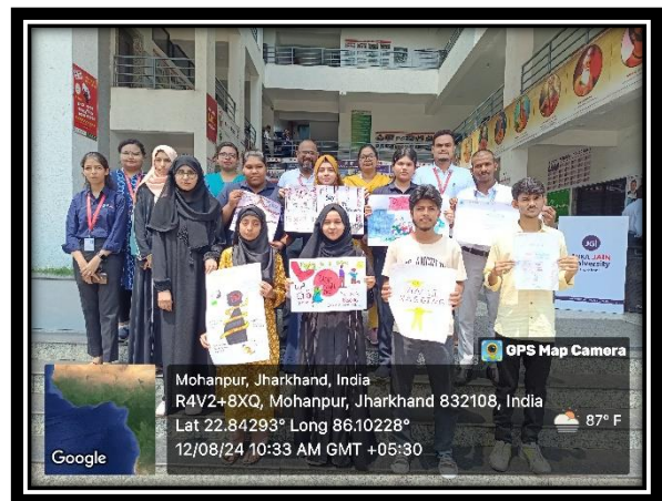
Fig 5: Group Picture included participants and faculties.