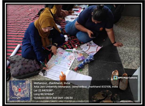
Fig 3: Participants illustrating their views on paper.