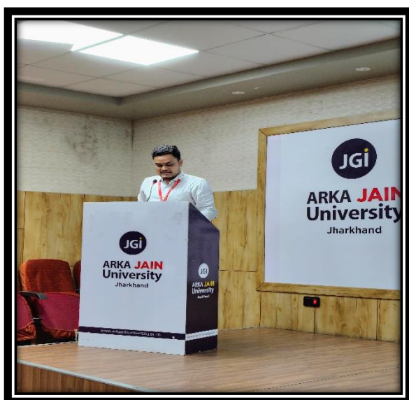
Fig 10: Talk of a Speaker on Anti- Ragging