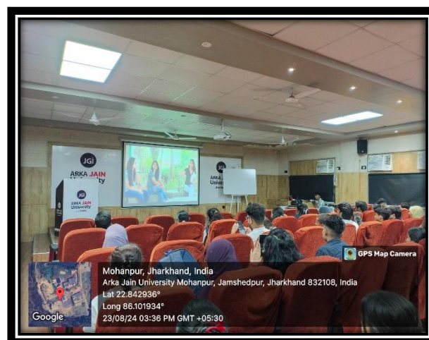
Fig 7: Glimpse of participants watching Short film