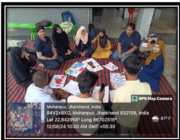
Fig 4: Participants with their poster