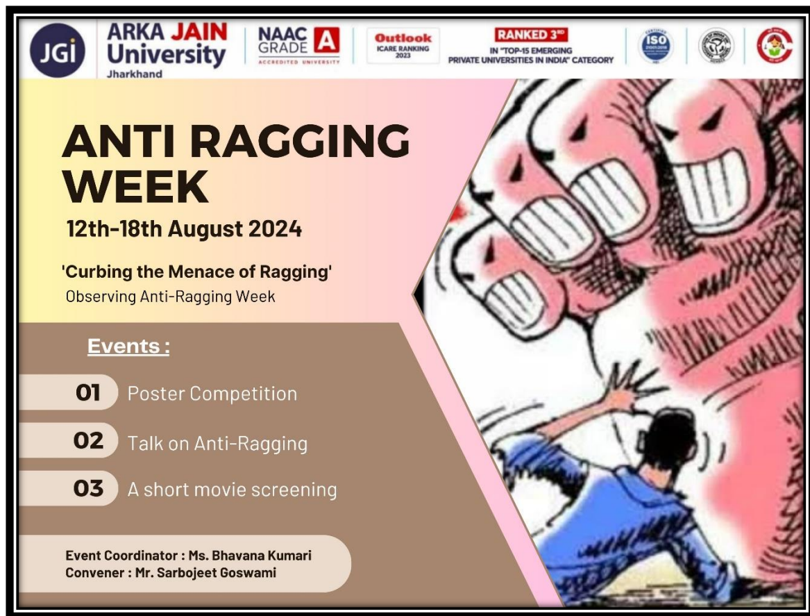
Fig 1: Poster of the event