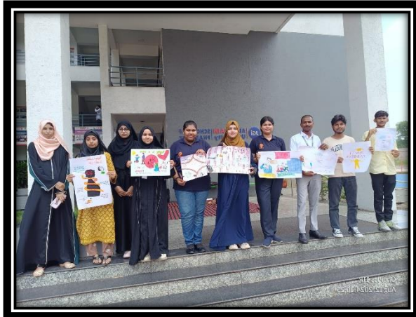
Fig 2: Participants displaying their posters