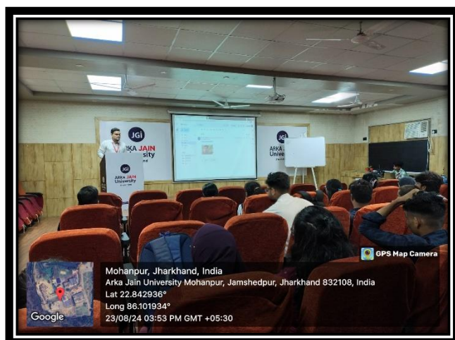
Fig 6: Speaker giving introduction to the participants about Anti Ragging.