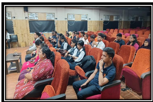
Fig 8: Participants present at the presentation of a short film on Anti-Ragging.