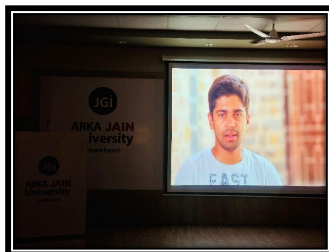
Fig 11: Another glimpse of the video.