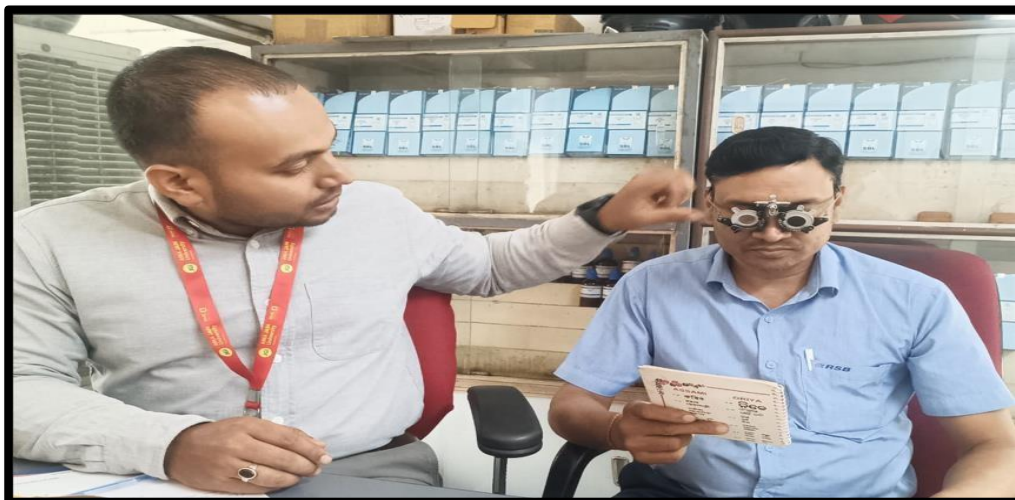
Examiner Testing the Near Vision