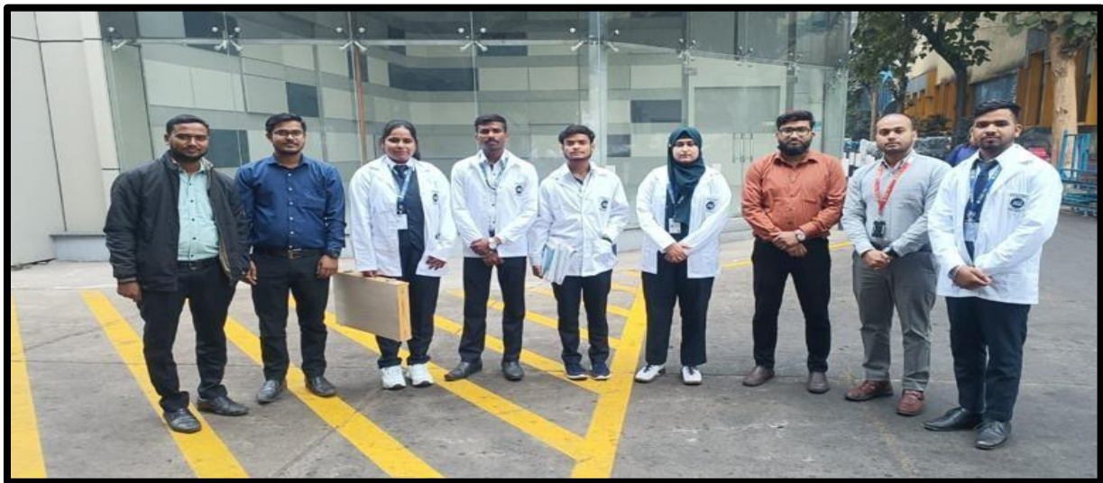
Group pic of the Team