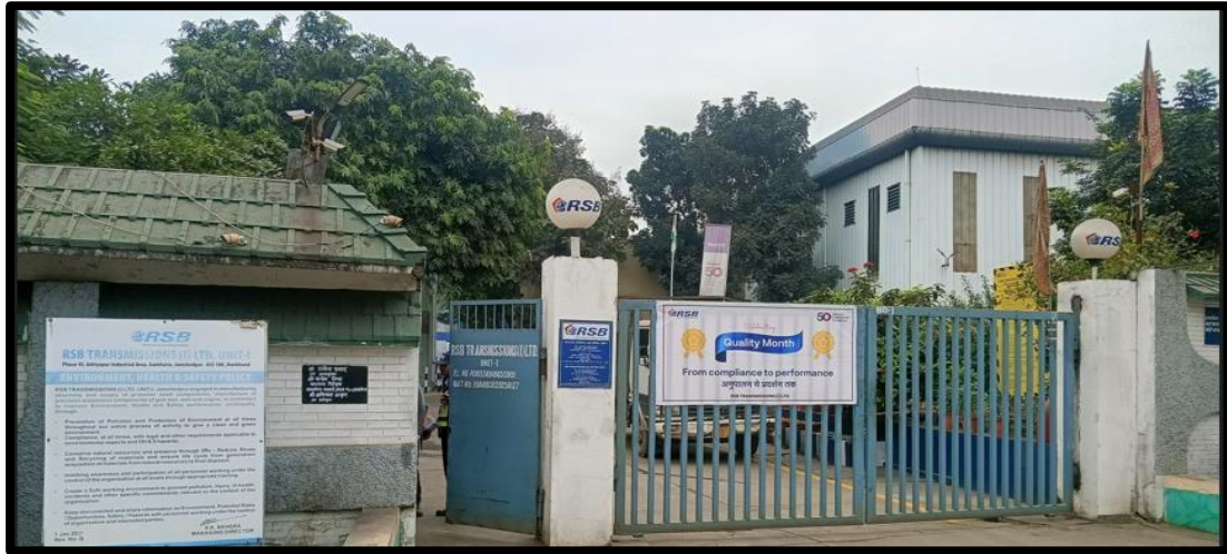
Diabetes Awareness Screening Camp Site