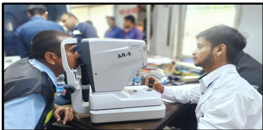
Examiner assessing the refractive error