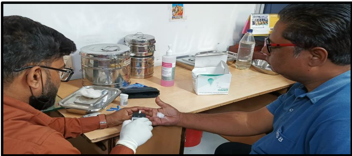
Testing Blood Sugar