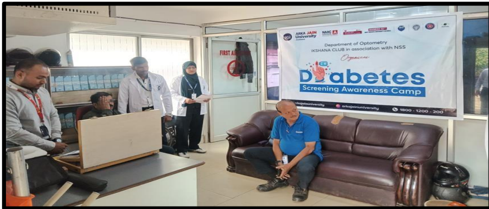
Setup for the Diabetes Screening Awareness Camp at RSB Transmission