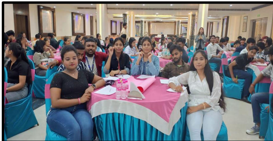
Figure 3: “students attending the activity program”