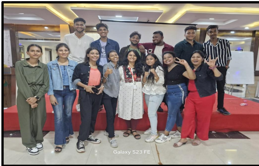
Figure 2: “students with faculty after the session”