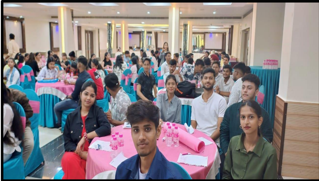
Figure 5: “students attending the activity program”