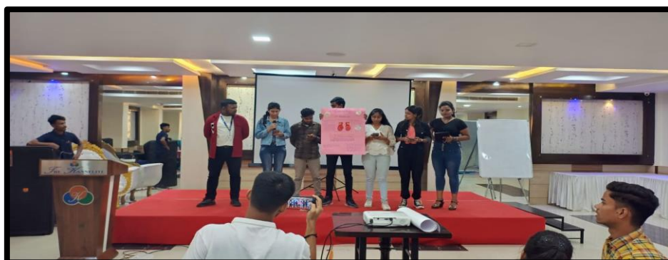
Figure 4: “Activity presentation on role model”