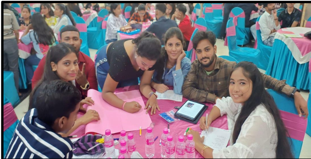
Figure 6: “students attending the activity program”