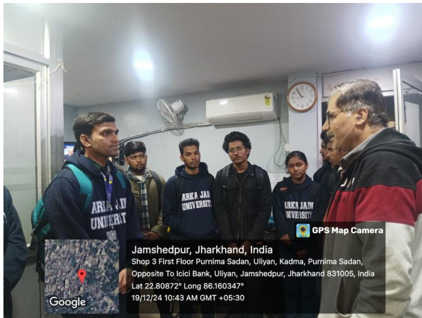
Figure 3: Photo of the Event: Instructor Explaining the Student