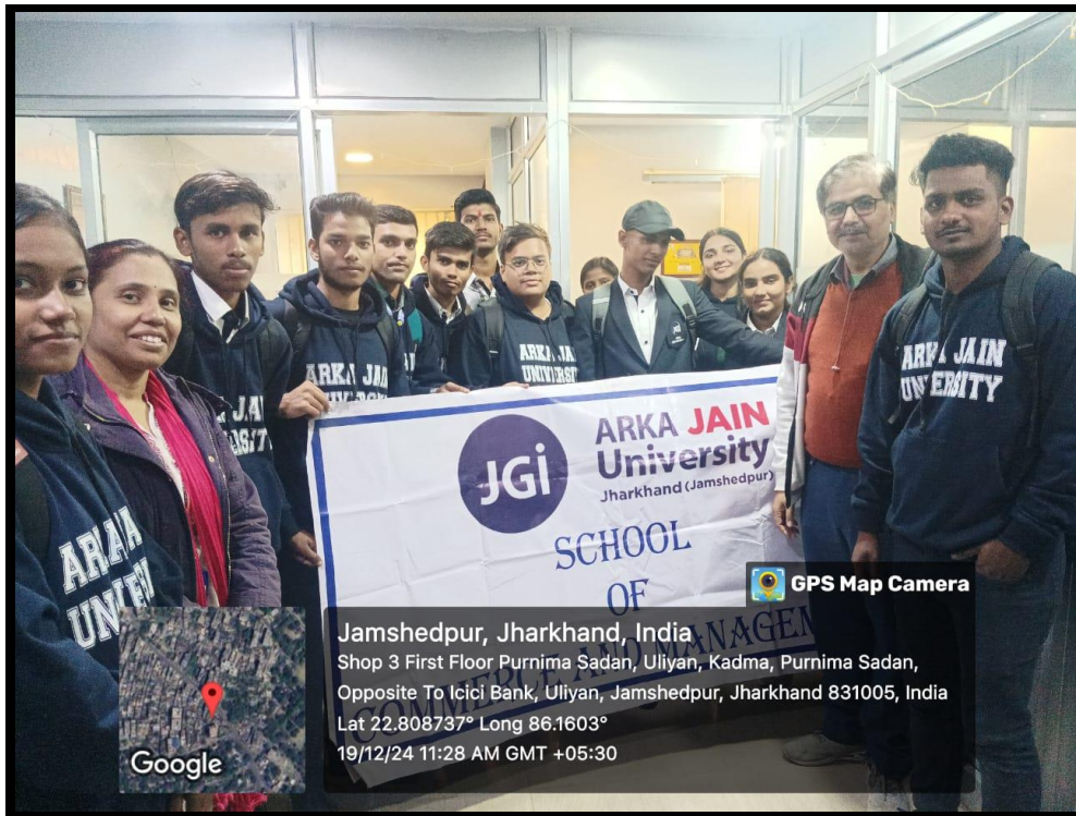
Figure 2: Photo of the Event: Group photo of the students with the Event Coordinator