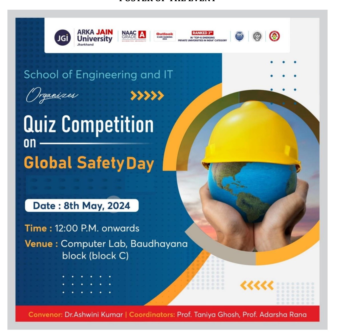
Figure 1: Poster of Quiz competition on Global Safety Day 2024