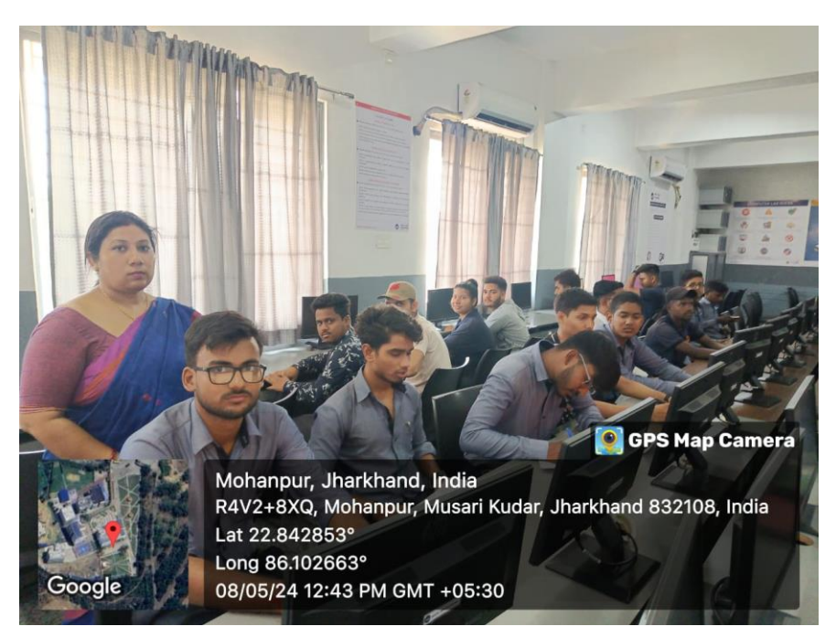
FIGURE 3: GEOTAG PHOTO OF ALL PARTICIPANTS WITH COORDINATOR