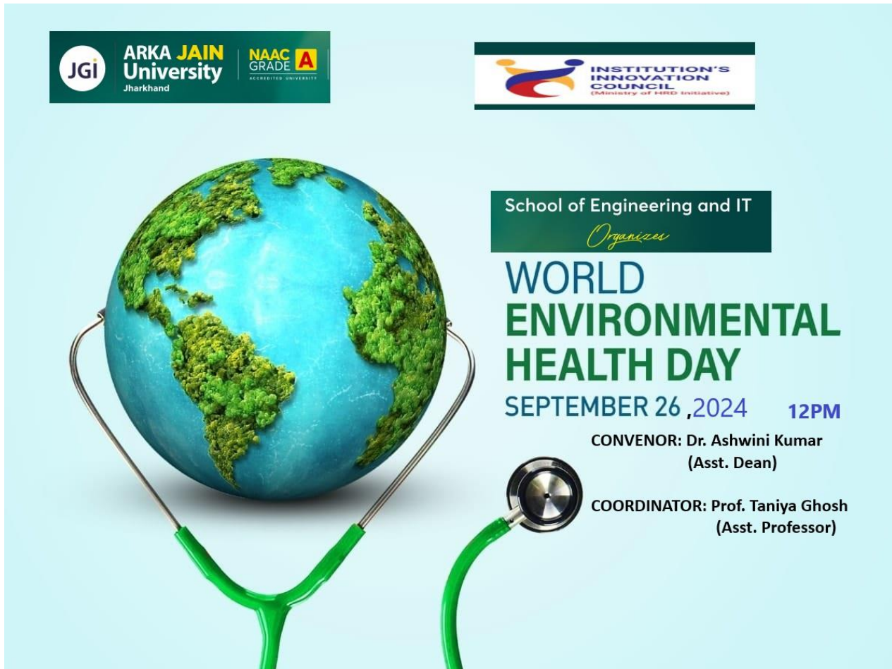
FIGURE 1: POSTER OF QUIZ COMPETITION ON WORLD HEALTH ENVIRONMENTAL DAY 2024