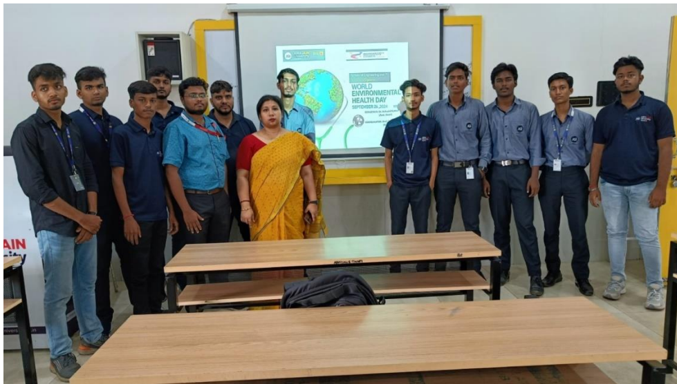
FIGURE 3: PHOTO OF QUIZ COMPETITION ON WORLD HEALTH ENVIRONMENTAL DAY 2024