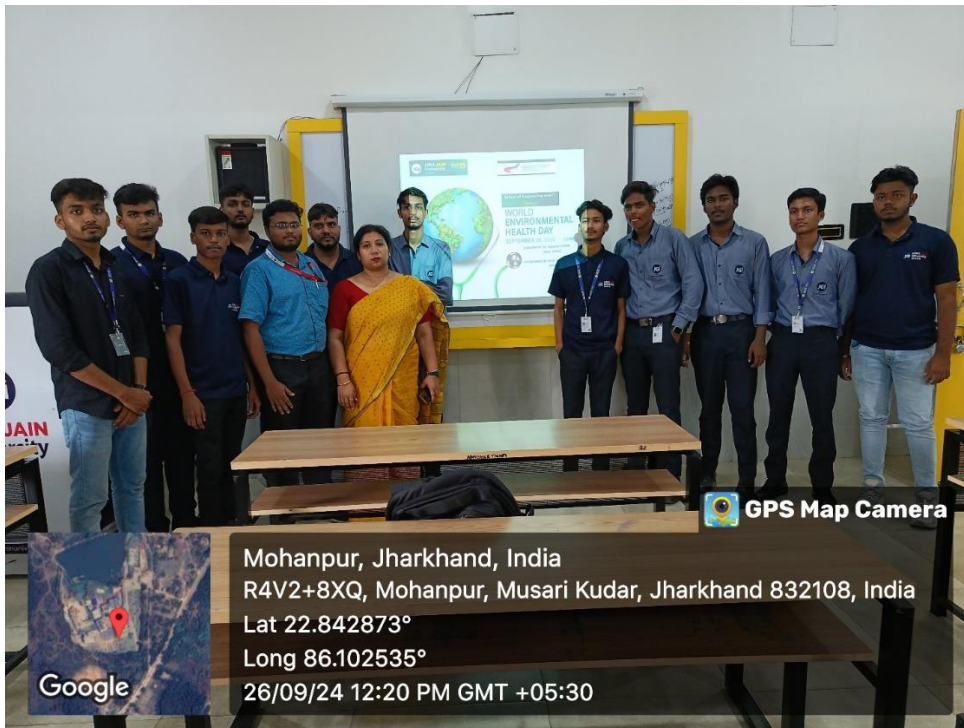
FIGURE 2: PHOTO OF QUIZ COMPETITION ON WORLD HEALTH ENVIRONMENTAL DAY 2024