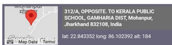
Figure 2: Class Photo of the students attending the Workshop on Financial Transaction & Interpretation of Invoice