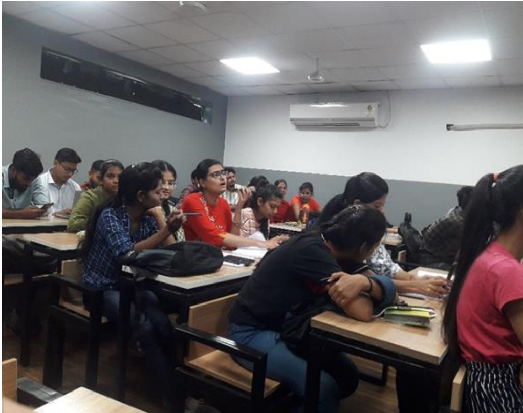
Figure 3: Students of MBA Semester- II & IV attending the session