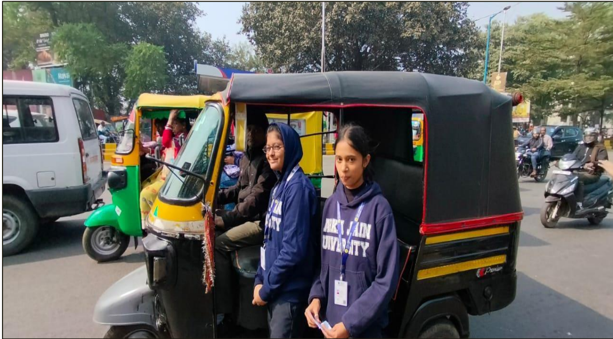
Fig.2 -Students distributing traffic rule placards to the public to raise awareness about traffic rule violations