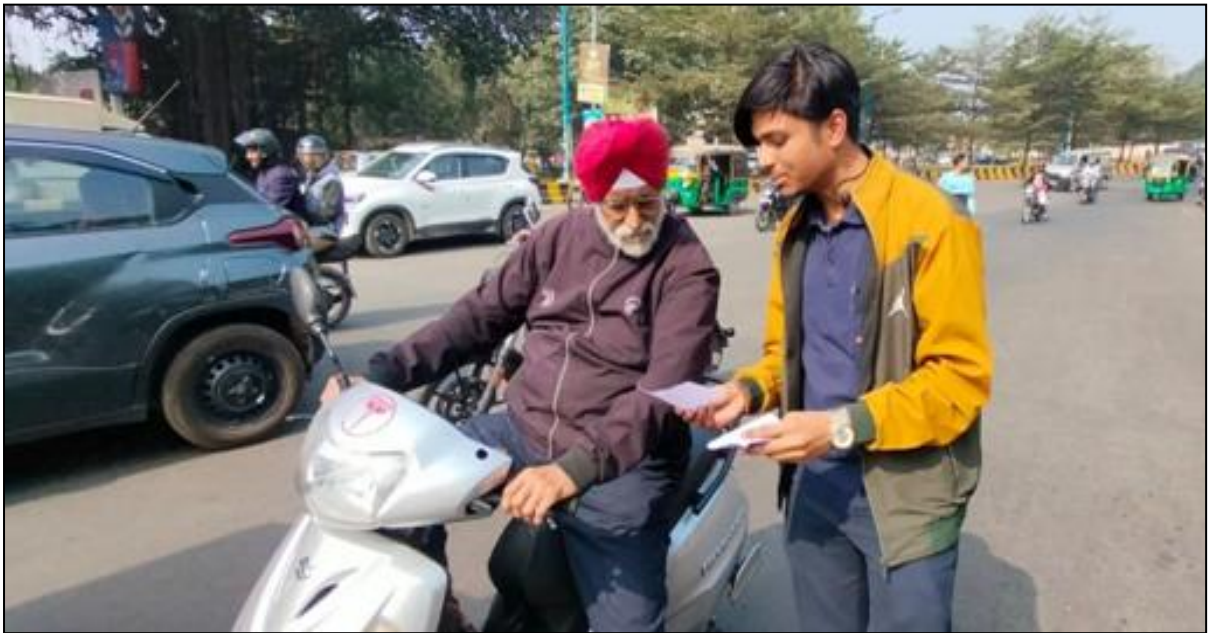
Fig. 3-Students explaining the Traffic rules to common public