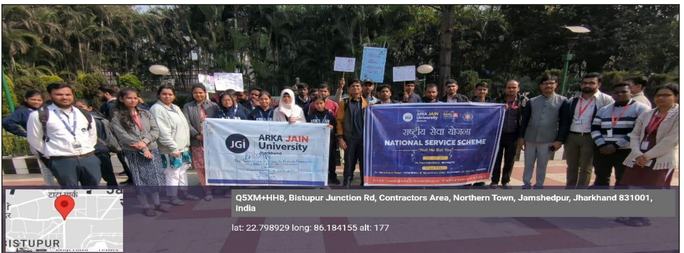
Fig.1- Geotag glimpses of Traffic Awareness Program 2025 “Awareness Against the Violation of Traffic Rules”