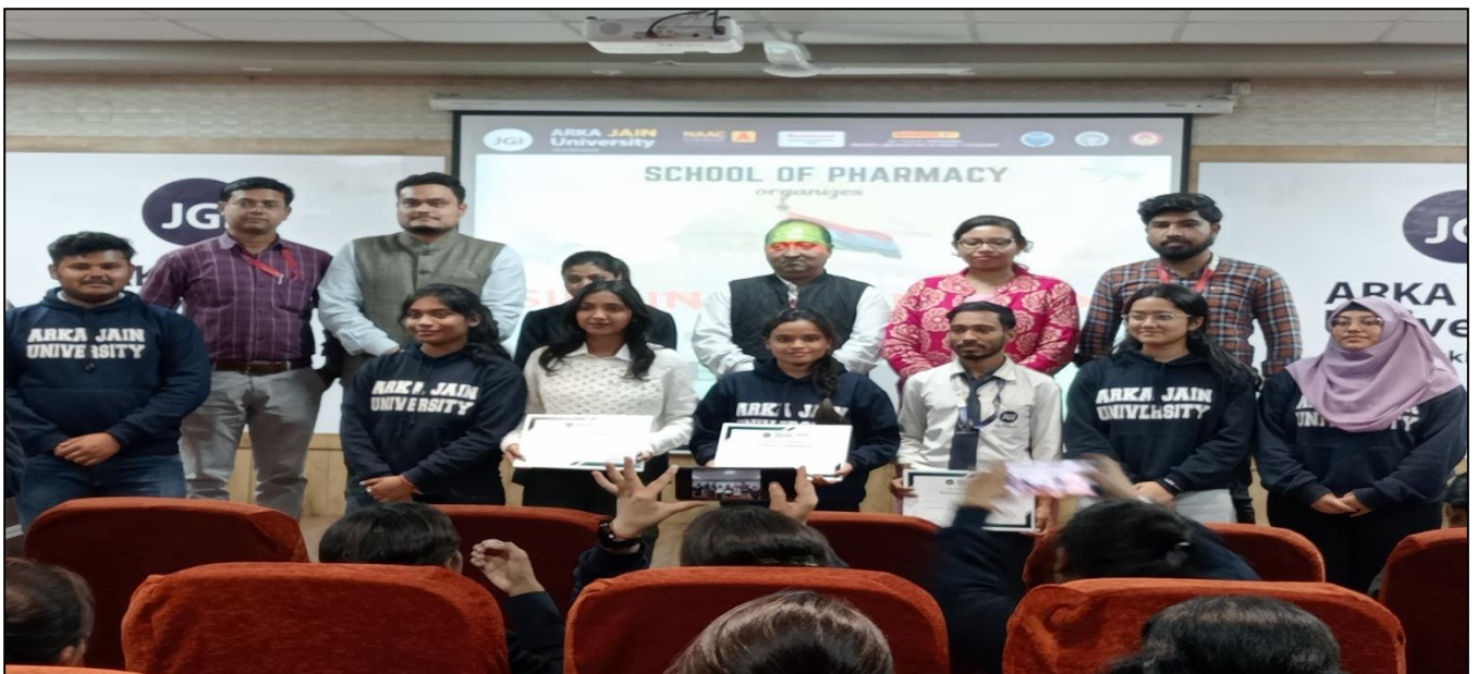
Fig.4- Prize winners of Singing Competition.