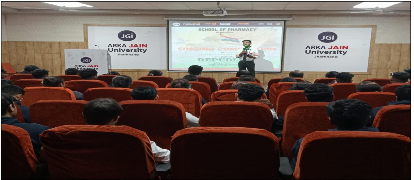
Fig.3- Students soaking in the joy of the singing competition.