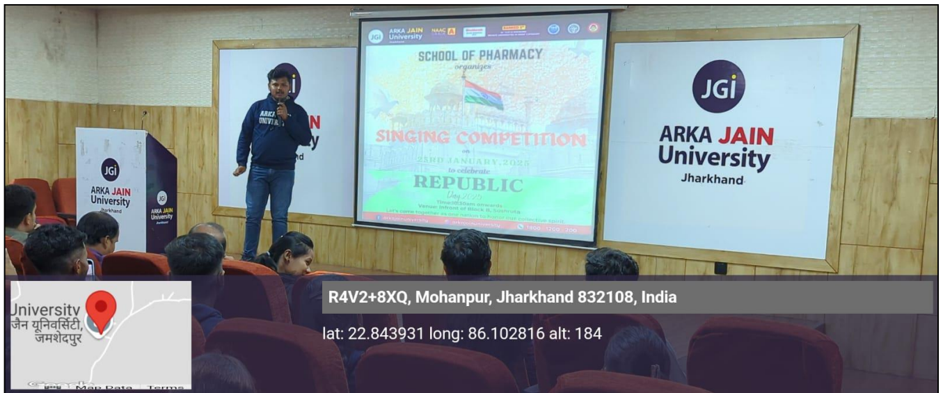
Fig.1- Participant of Singing Competition.