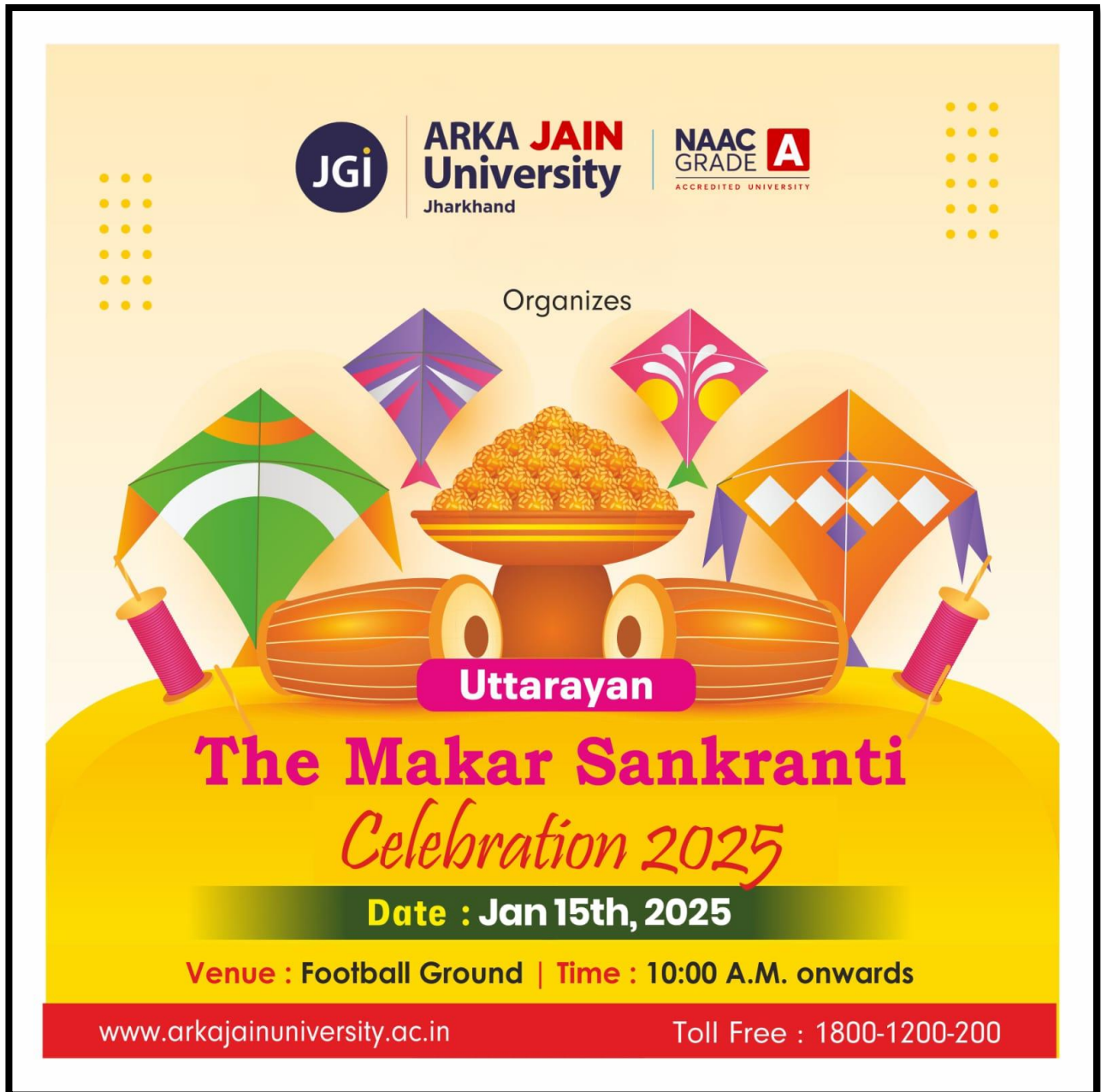
Figure 1: Poster of the Cultural Visit