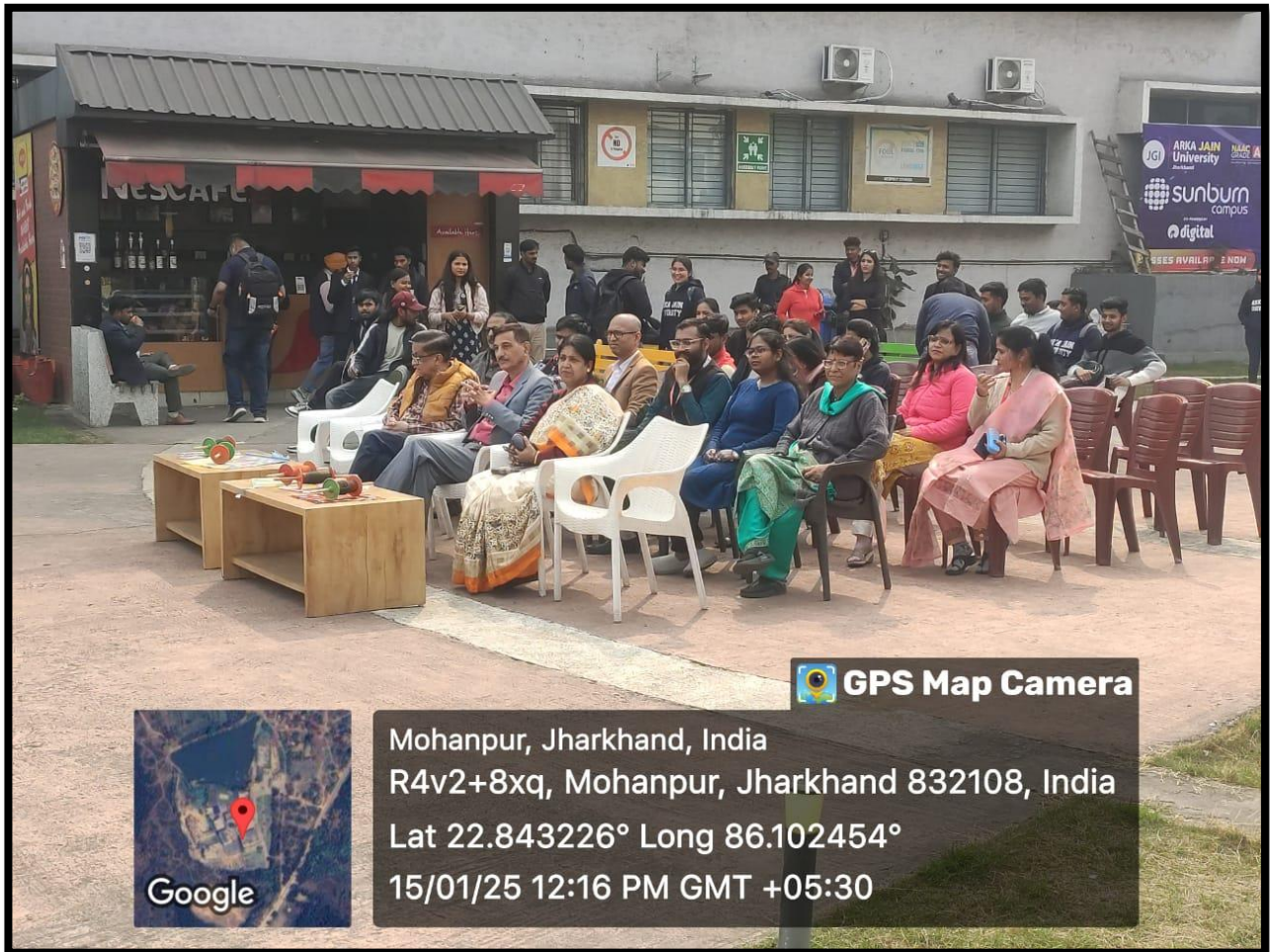
Figure 2: Guests and Dignitaries enjoying the program