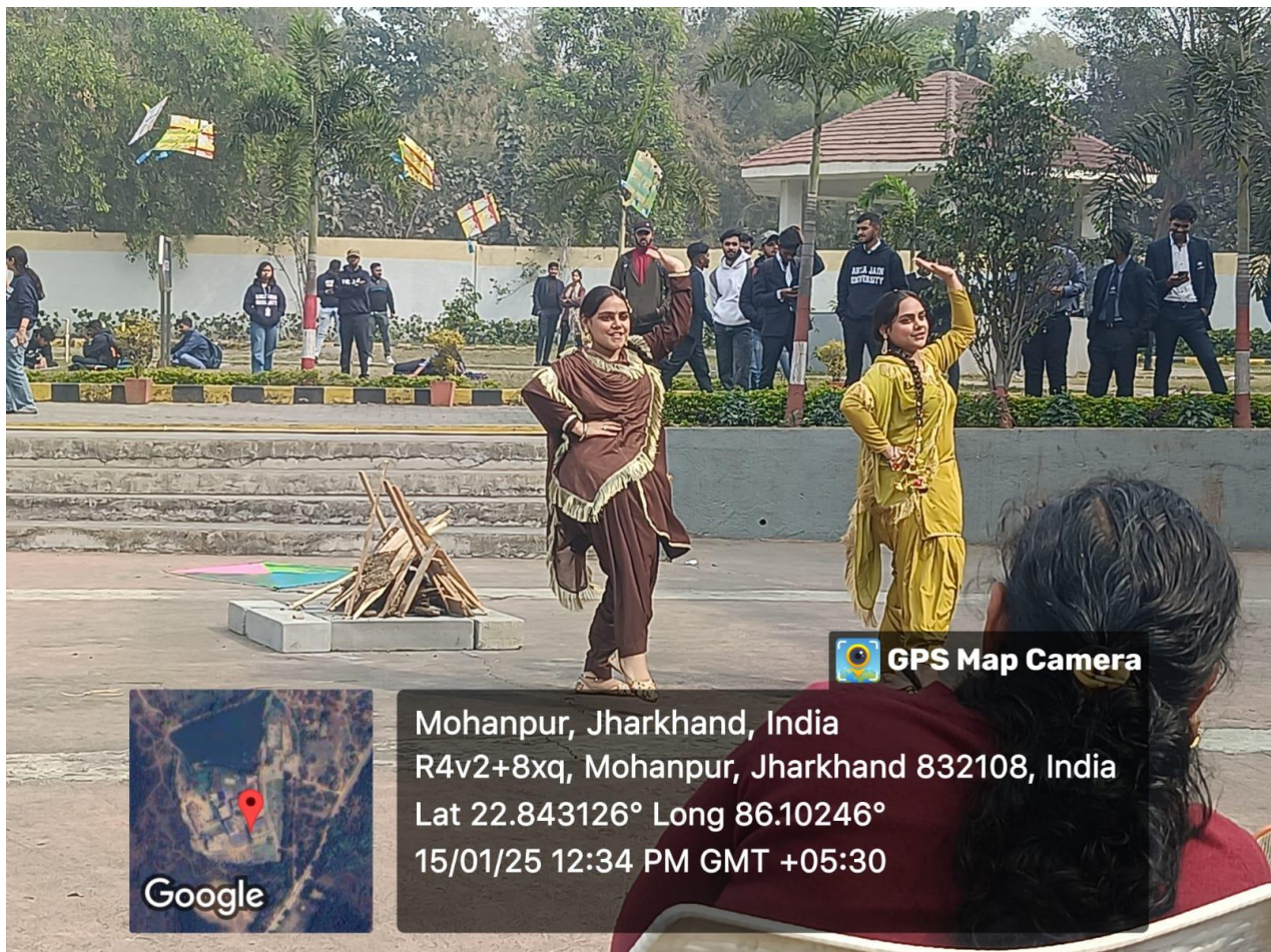
Figure 6: Dance performance by the students