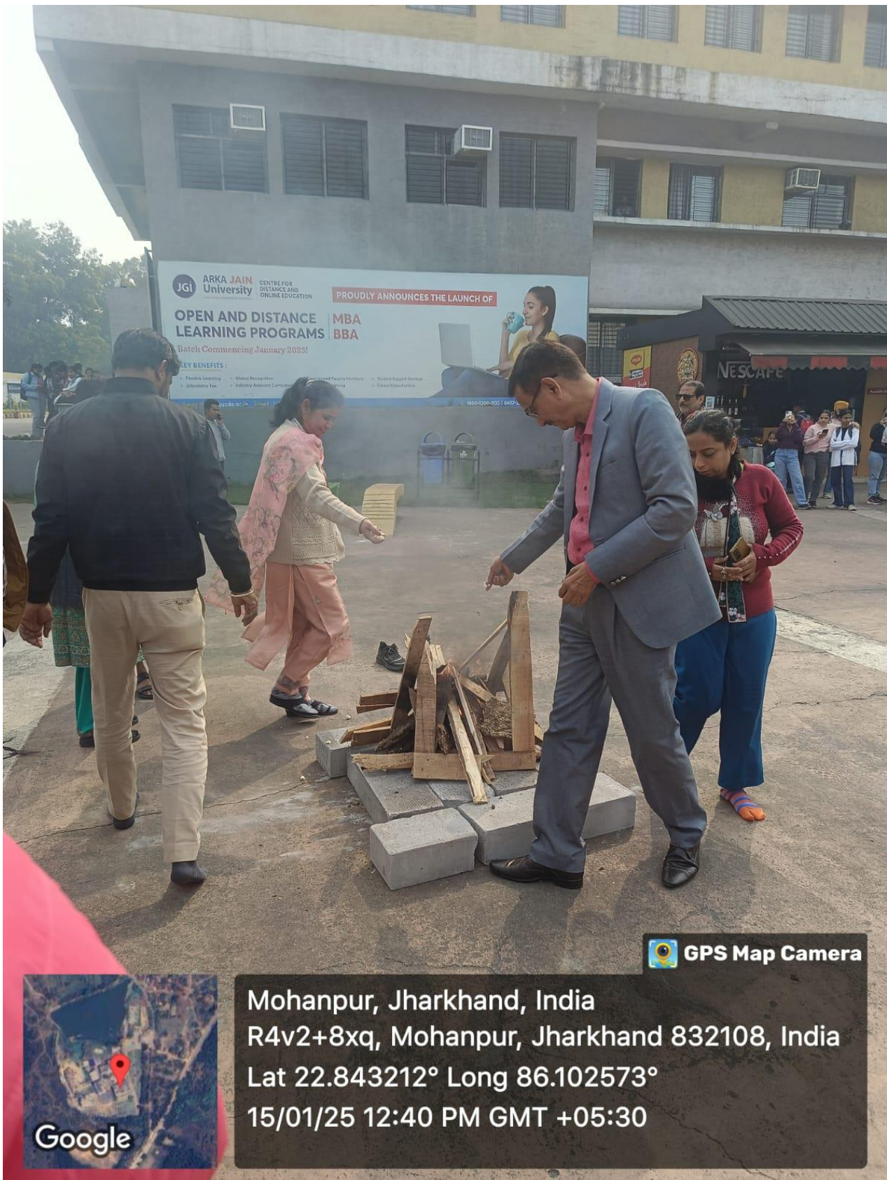
Figure 5: Guest and Dignitaries celebrating Lohri