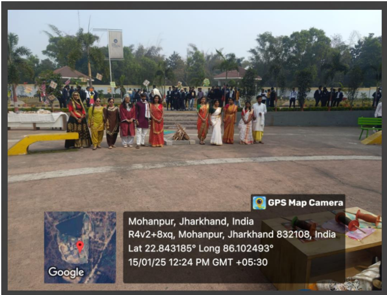
Figure 4: Participants of Ramp Walk