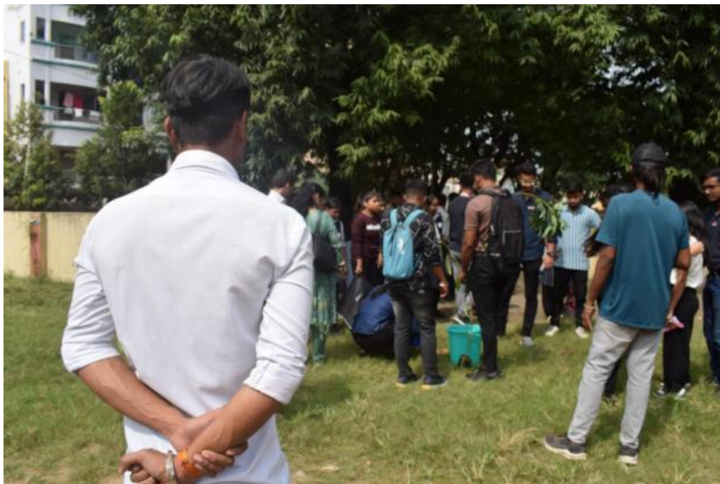
Figure 5: Plantation Drive