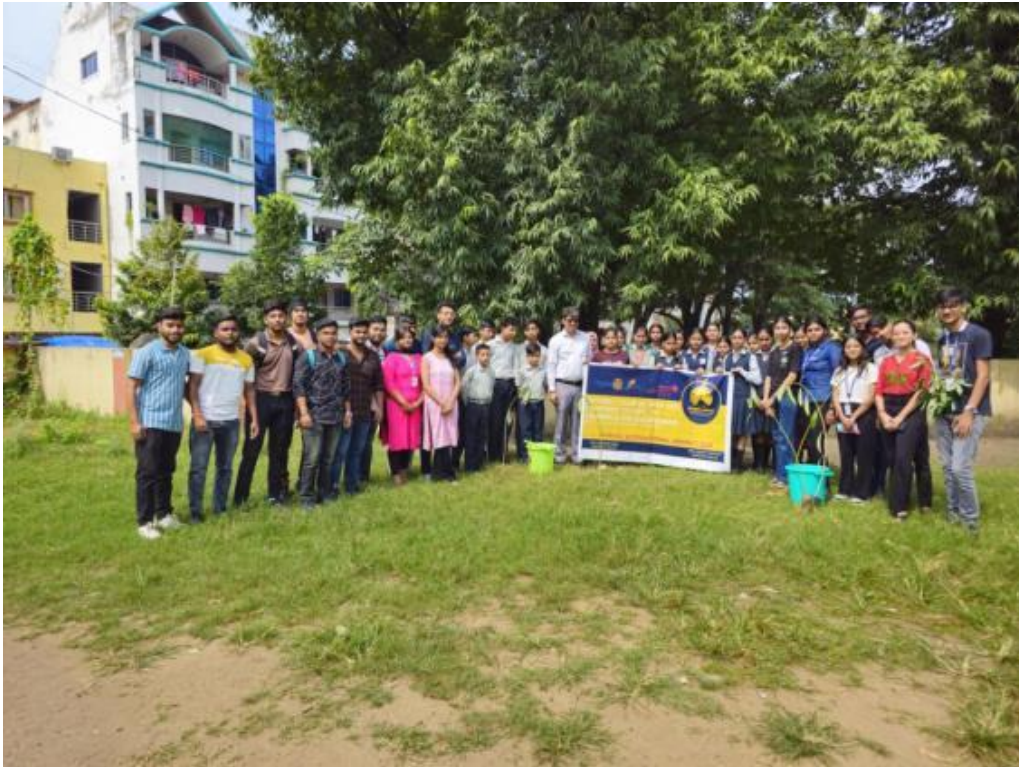
Figure 4: Plantation Drive