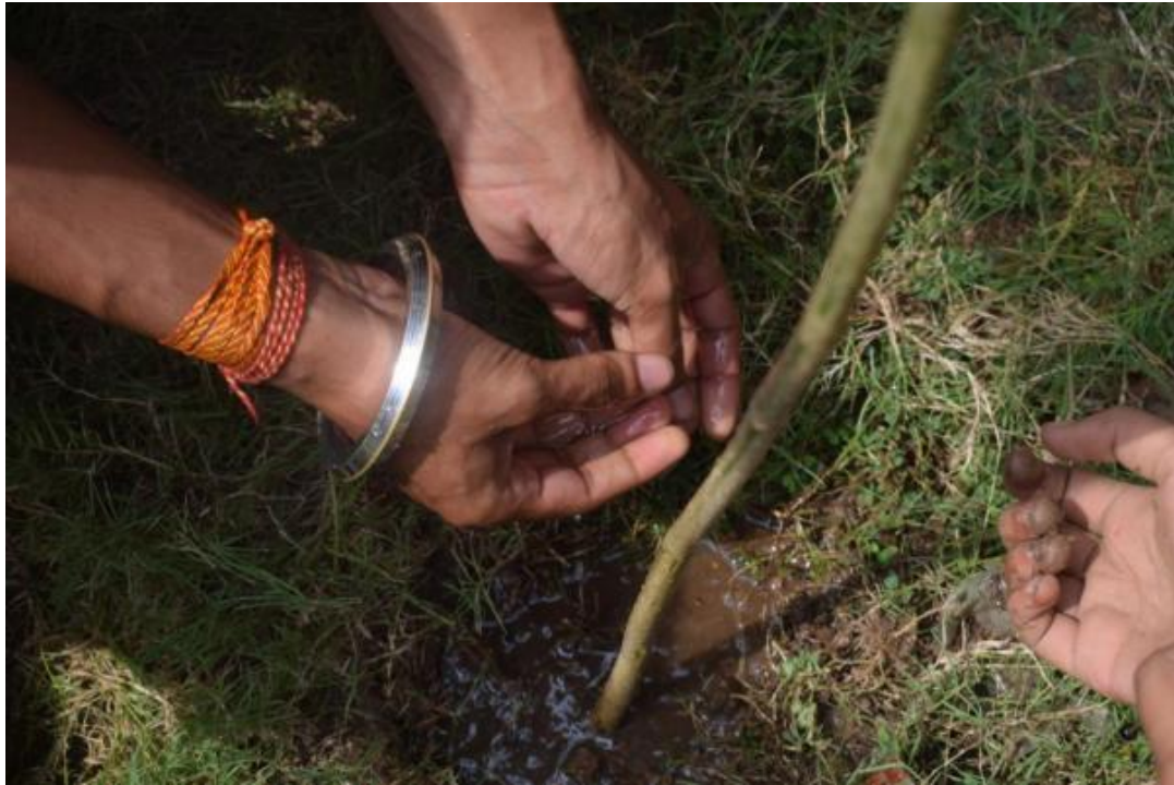
Figure 2: Plantation Drive