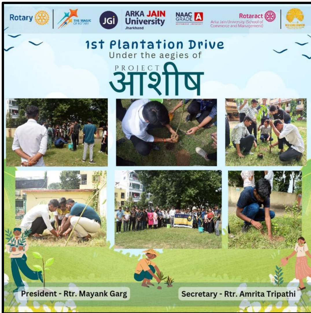
Figure 1: Plantation Drive