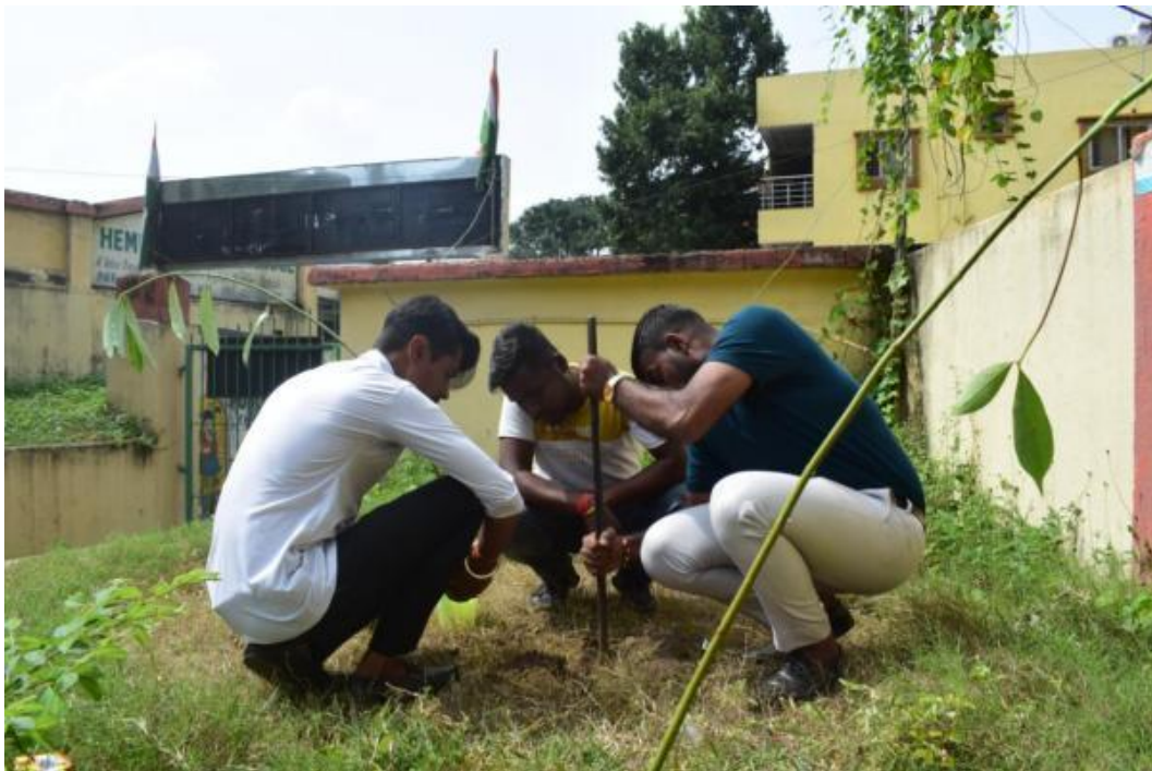
Figure 3: Plantation Drive